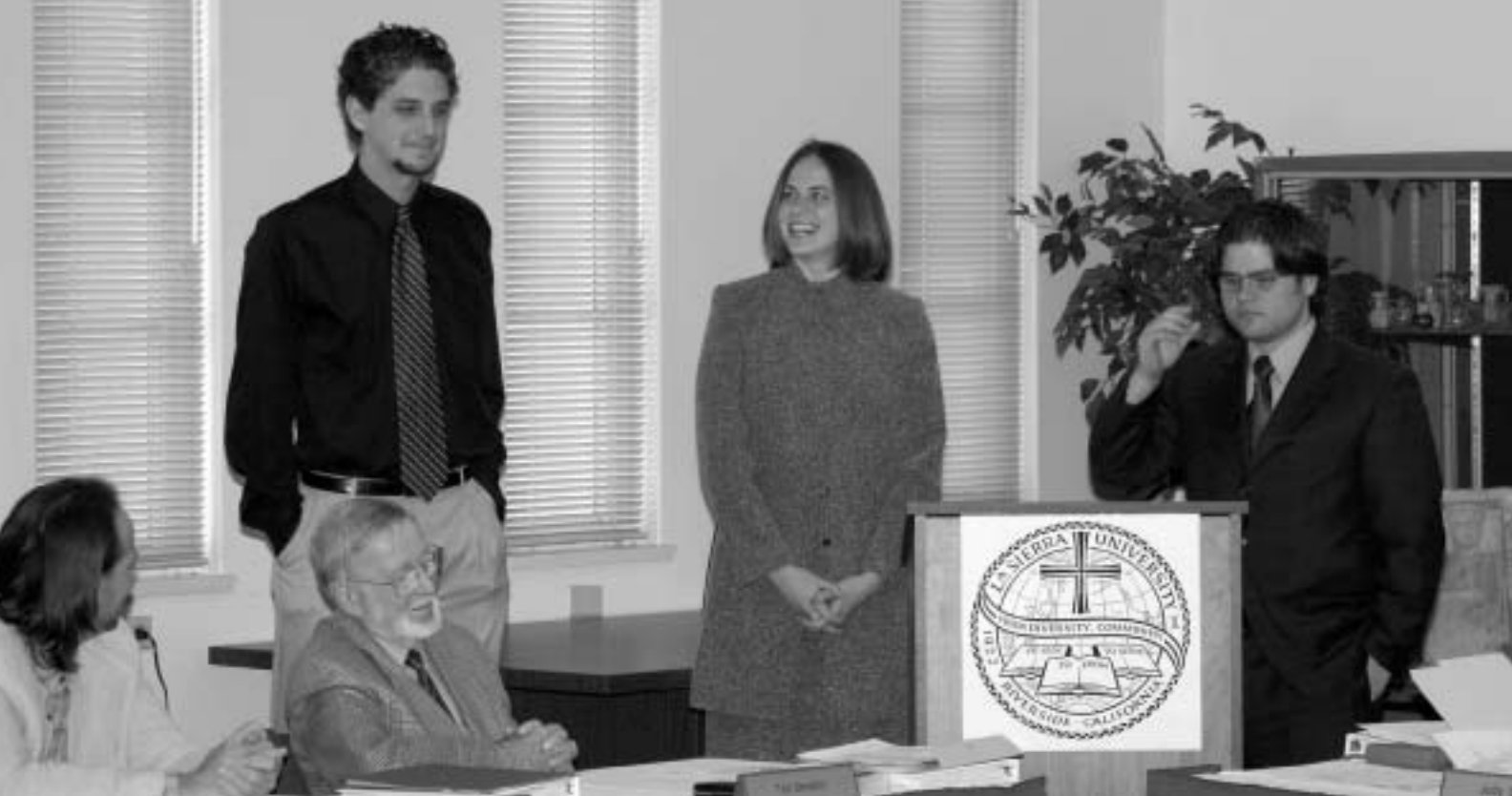
Officers of the university student association share students' concerns with the LSU trustees.

to three minutes on a topic of his or her choice. We have had students, faculty, and alumni take advantage of this opportunity. This plan undercuts the notion that the board is somehow shielded from the "truth" about campus issues.