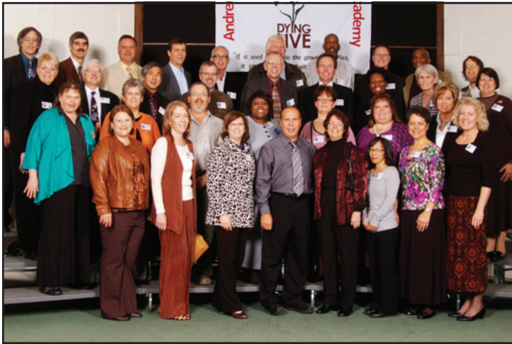
Class of 1975