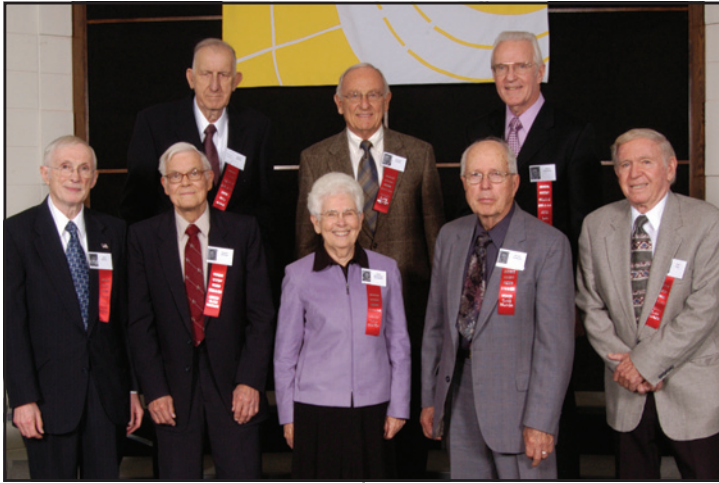
Class of 1943