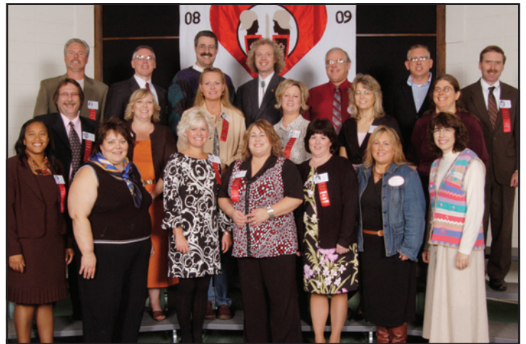
Class of 1979