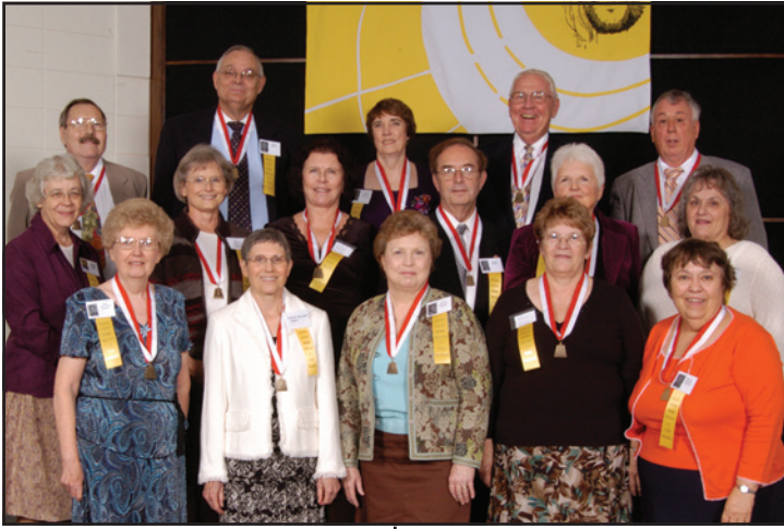
Class of 1958