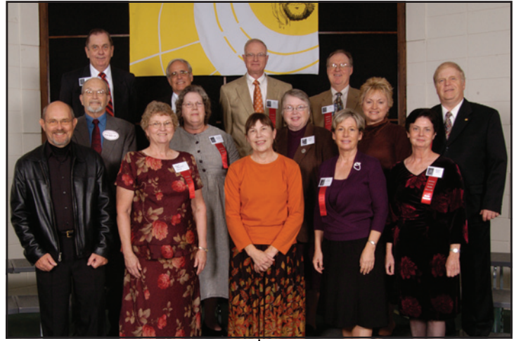
Class of 1963