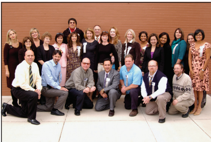
Class of 1985