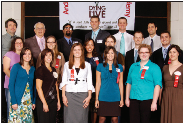
Class of 2000