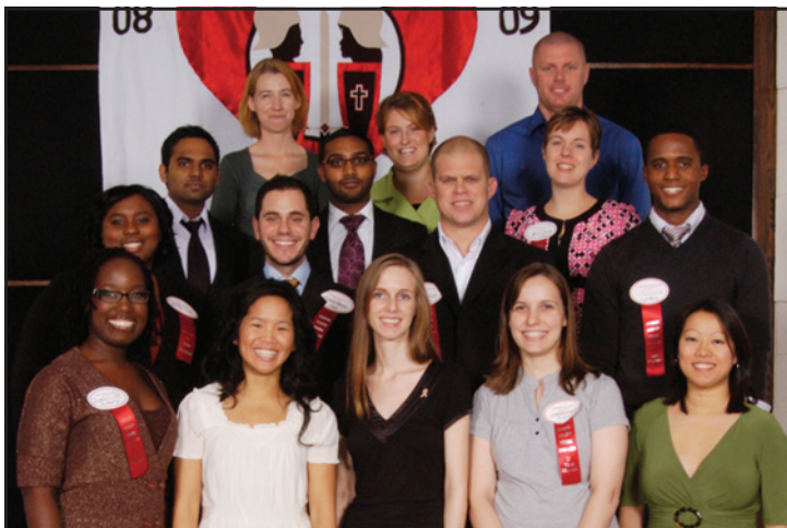
Class of 1999