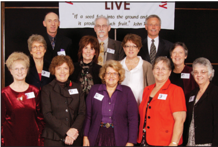
Class of 1965