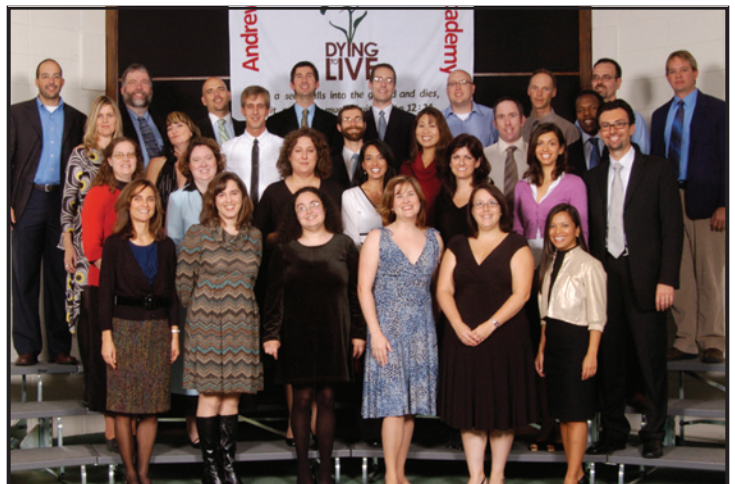
Class of 1990