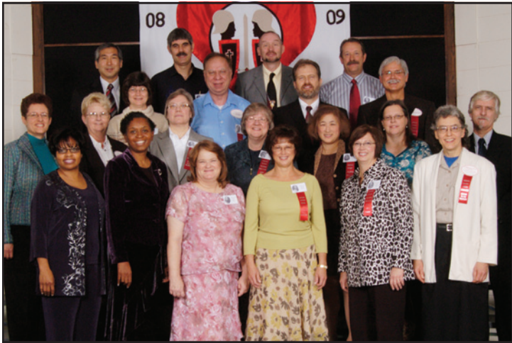
Class of 1974