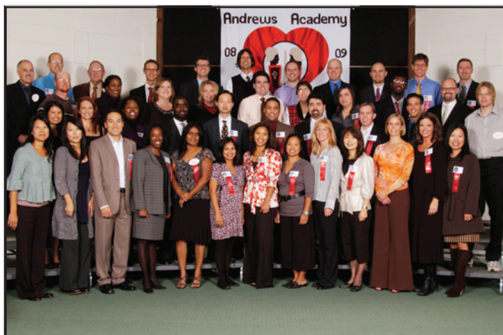
Class of 1989