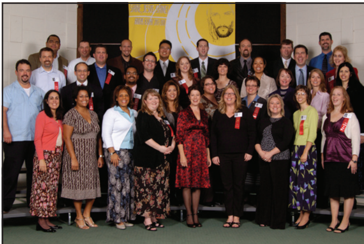
Class of 1988