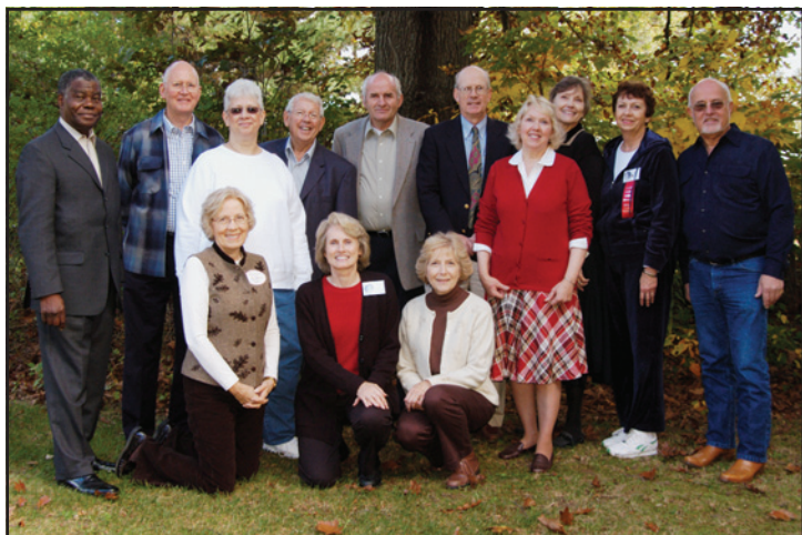
Class of 1964