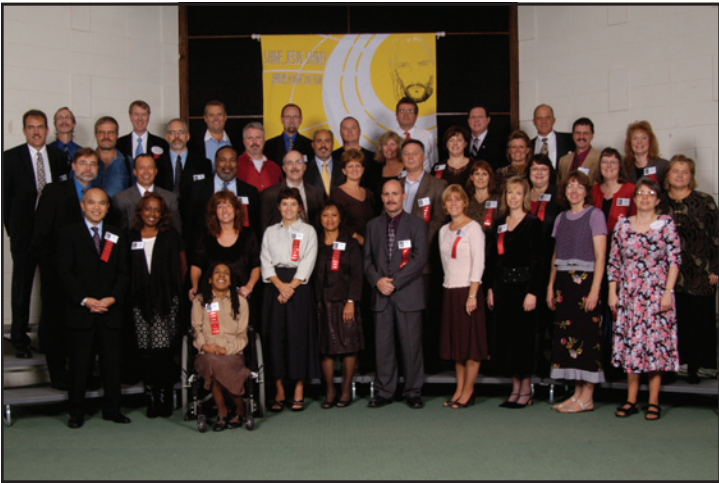
Class of 1978