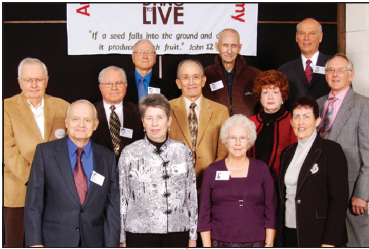
Class of 1955