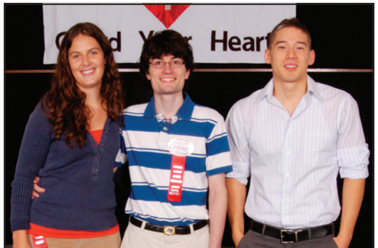
Class of 2004