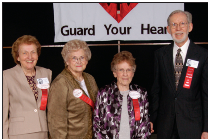
Class of 1949