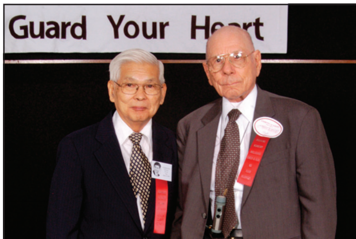
Class of 1944