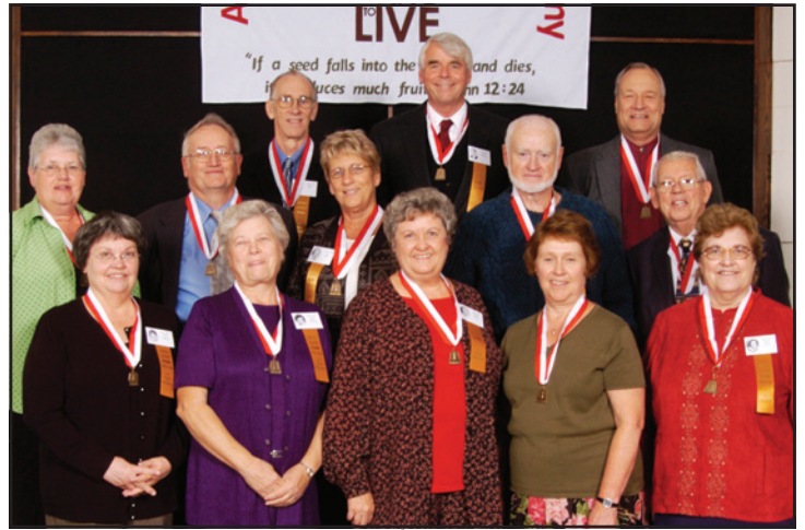
Class of 1960