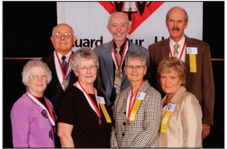
Class of 1959