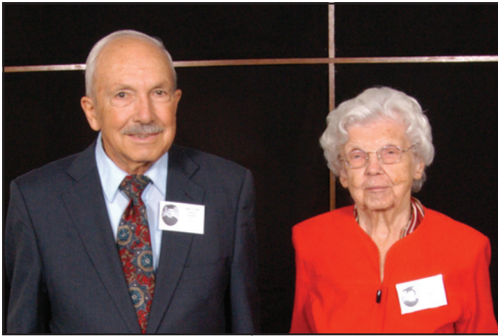
Class of 1940