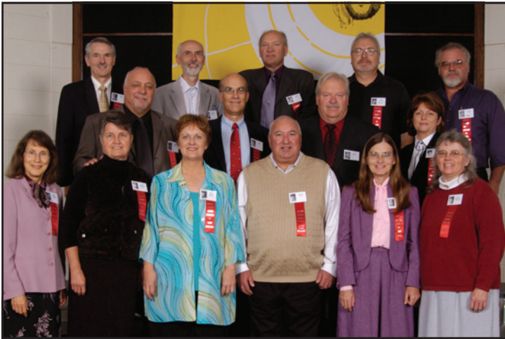
Class of 1968