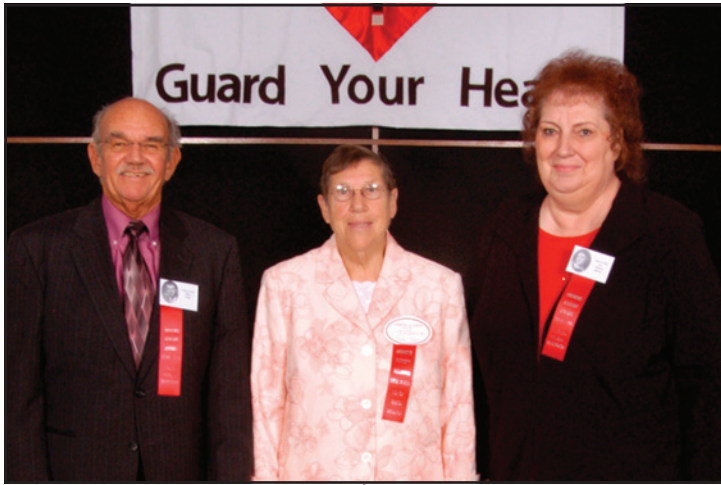
Class of 1954