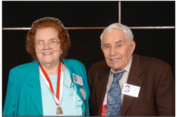
Class of 1950