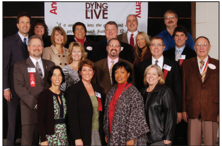
Class of 1980