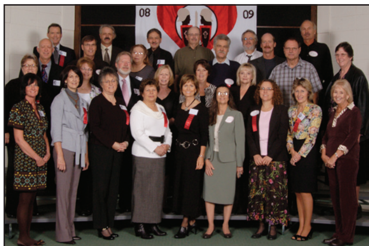
Class of 1969