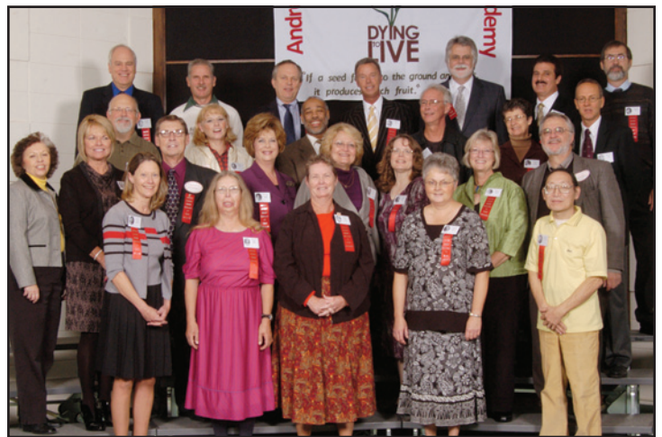
Class of 1970