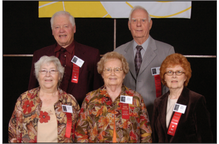
Class of 1948