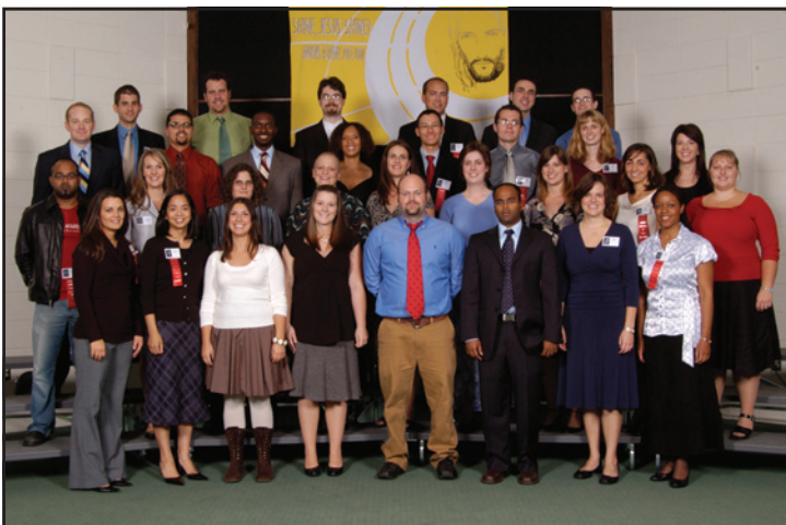
Class of 1998