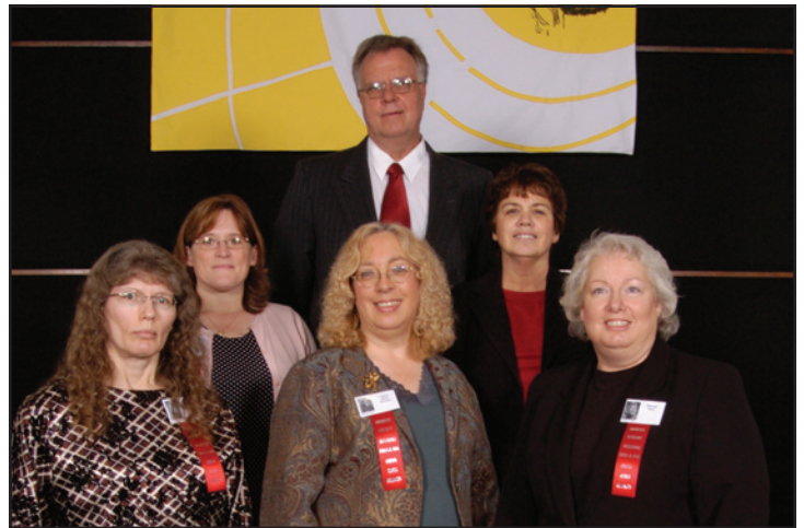
Class of 1973