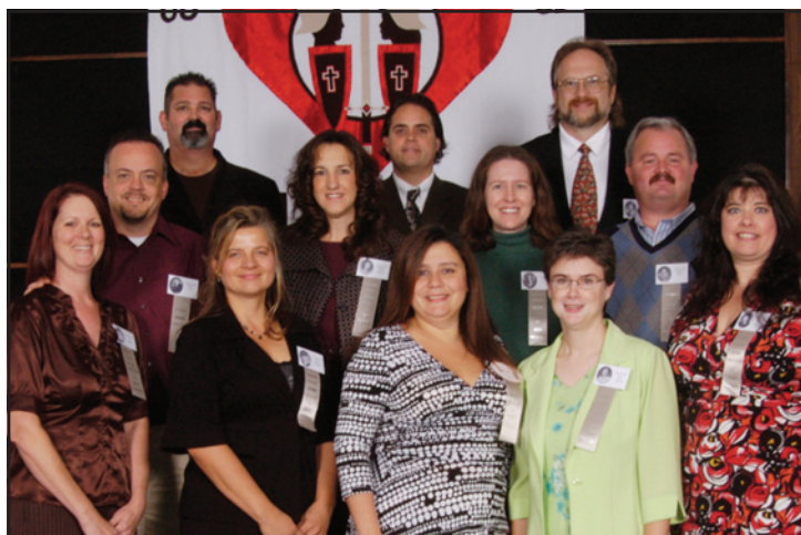
Class of 1984