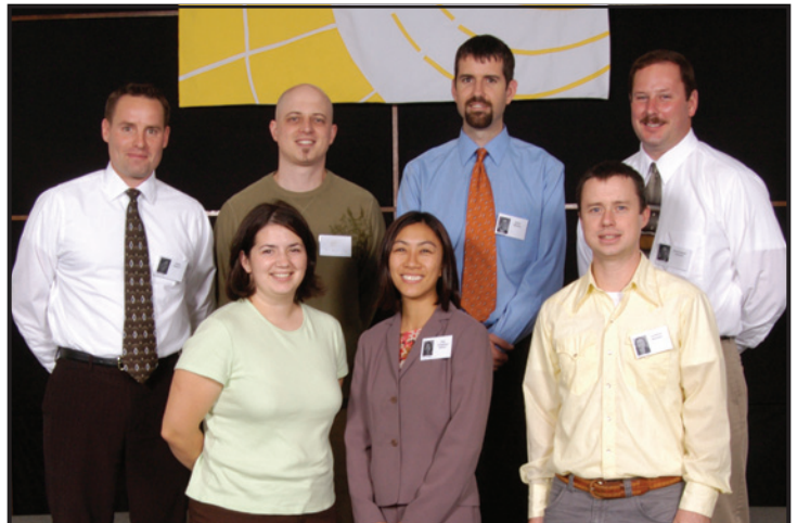
Class of 1993