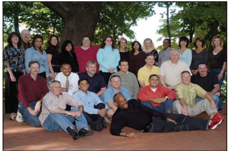
Class of 1983