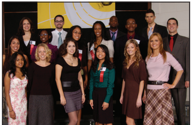
Class of 2003