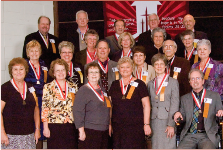
Class of 1961