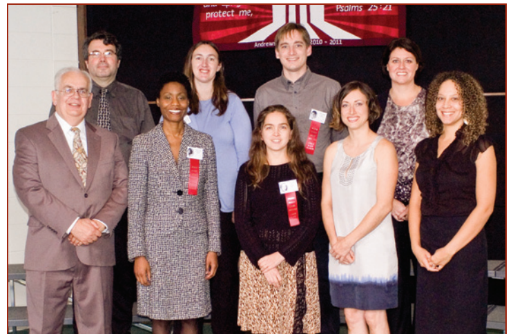
Class of 1996