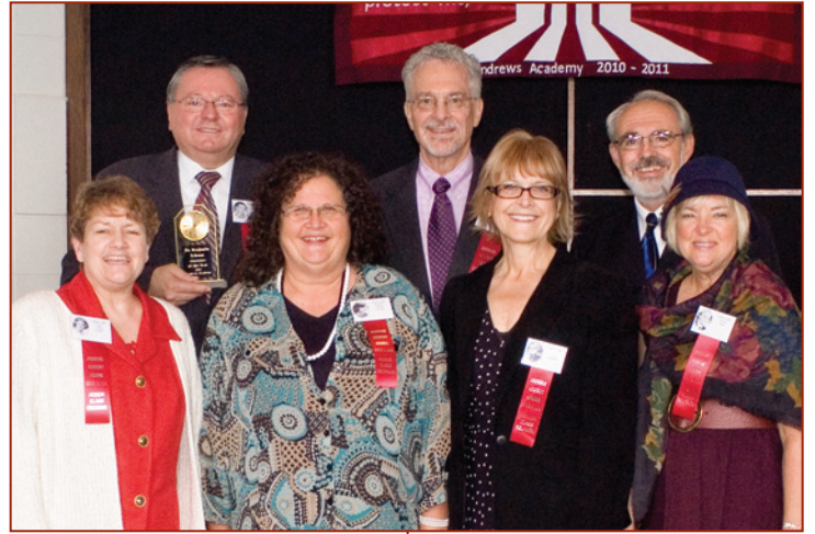
Class of 1966