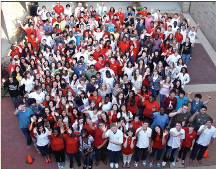
Say hello to 225 Andrews Academy students!