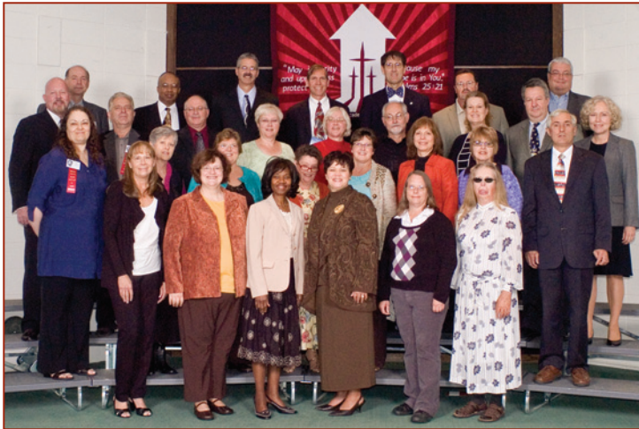
Class of 1971