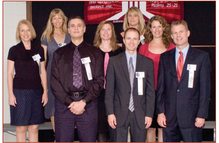
Class of 1986