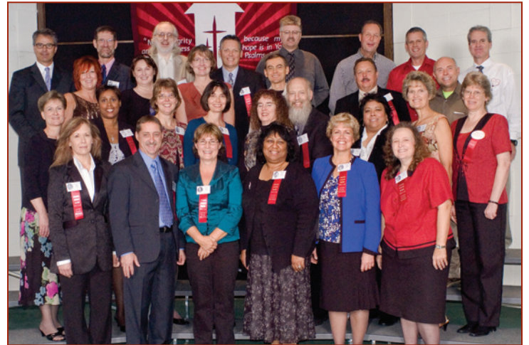
Class of 1976