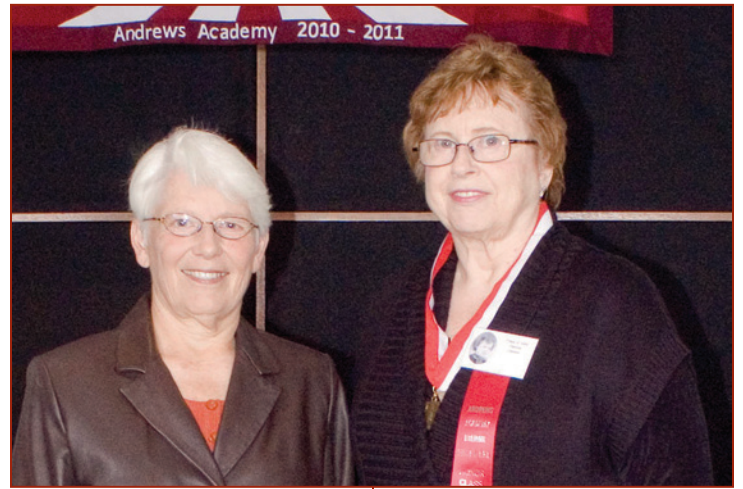
Class of 1956