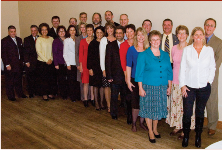
Class of 1981