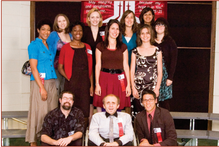
Class of 2001