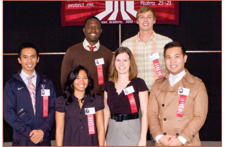
Class of 2006