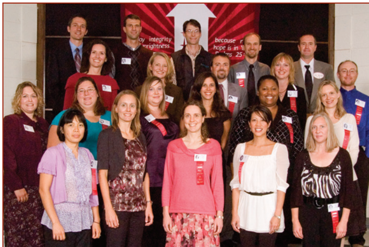
Class of 1991