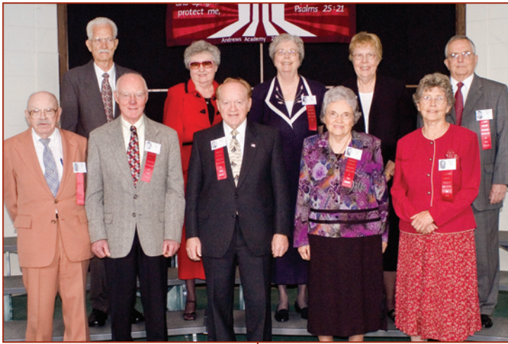
Class of 1951