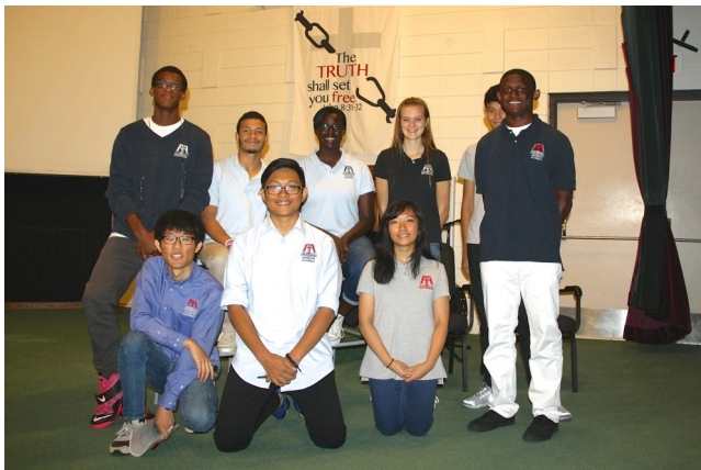
CLASS OF 2017 OFFICERS

Andrews Academy has a rich co curricular program which involves many students taking leading roles in these activities. On Sept. 4 elections were held for the sophomore and junior classes. Seniors had their elections last spring so they could use the summer to plan for various activities throughout the year and specifically the senior class trip in a few weeks. Freshmen will have their elections in a few weeks to provide a little more time for everyone to get to know each other. The election results are as follows: