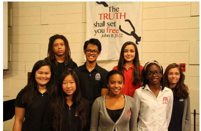
CLASS OF 2018 OFFICERS