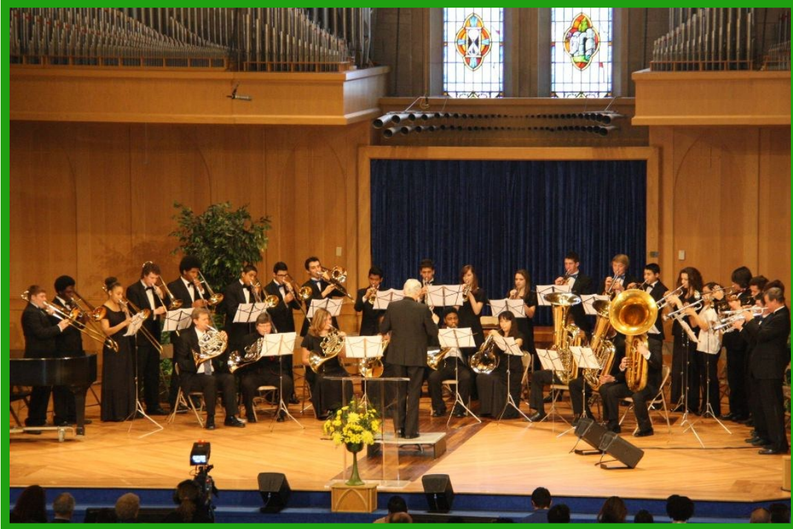
Top Picture: A number of Andrews Academy band members joined with other academy's from the Lake union to participate in this year's music festival held on the campus of AU this past weekend.