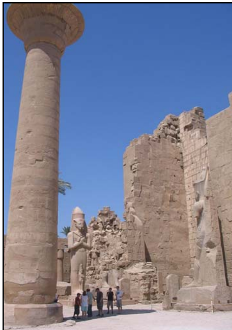
Students at Temple of Karnak.