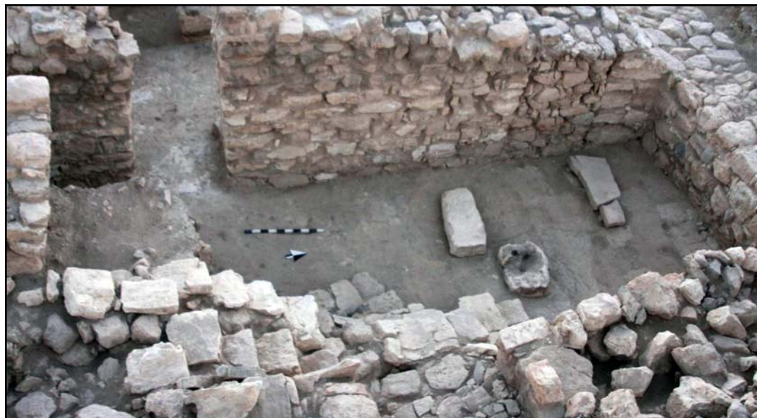
The entry room of the LB building with two fallen standing stones and the stepped entryway.