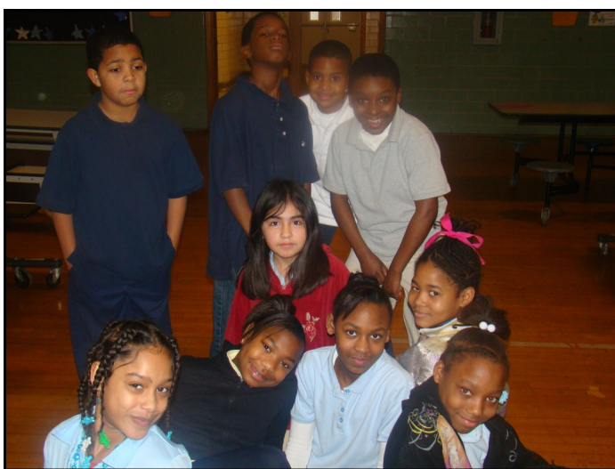
Students of the McCord Elementary School, a Socrates site in Benton Harbor, Michigan.