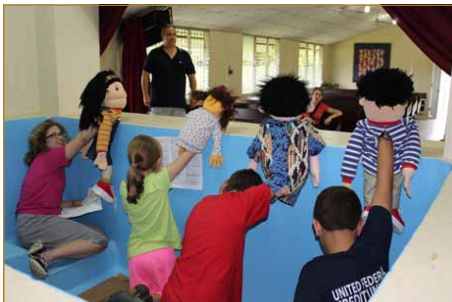
ASI Lake Union volunteers practice puppet presentation for evening worship program.

The fact that all this was accomplished in just a week is a small part of the story. It’s also the miracles the volunteers remember! All along the way,