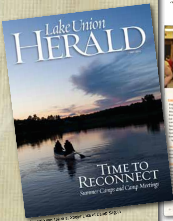
This photo was taken at Stager Lake at Camp Sagola in Crystal Falls, Michigan.

"Telling the stories of what God is doing in the lives of his people"