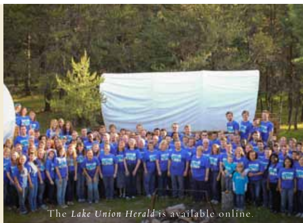
The Lake Union Herald is available online.