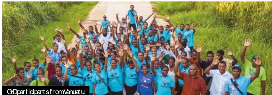
GYD participants from Vanuatu

The youth from Kiribati picked, husked and cleaned coconuts and then presented them to hospital patients.