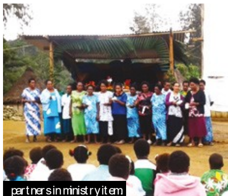
partners in ministry

Punano 2 community members were very pleased to have the gospel workers in their village and stressed that "angels had visited them" over the weekend. They couldn't let their gratitude vanish without a feast in the Eastern Highlands tradition, which closed the retreat program.