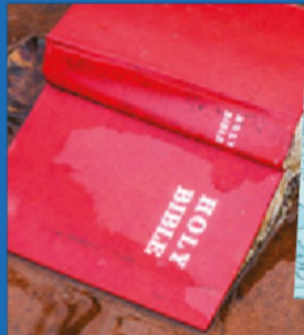
Aussies choose "no religion"