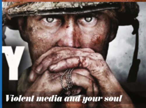
Violent media and your soul