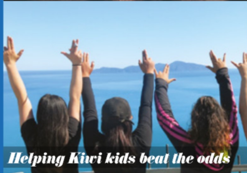
Helping Kiwi kids beat the odds