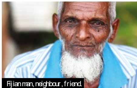
Fijian man, neighbour, friend

You can view the videos at: vimeo.com/spddiscipleship .