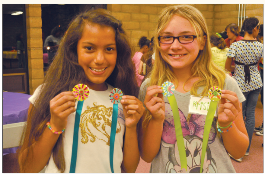
Two girls display their Bible bookmarks, one of several crafts available.

Girls were learning fun ways to memorize scripture, making crafts, and going to classes like Modesty Moments