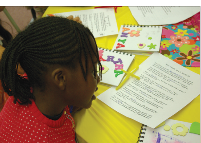
A young girl reads a paper titled "How Much am I Worth." Scriptures on each one's worth in God were included and each girl could personalize each Scripture by adding her name.