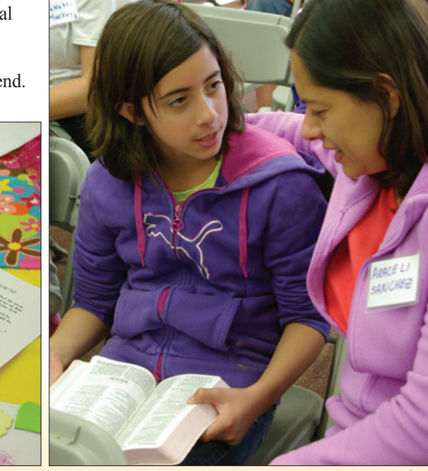
A Mom and daughter discuss a Bible verse in a meeting. Girls, ages 9-12, attended the retreat together. Mom and daughters separately for small groups and seminars.