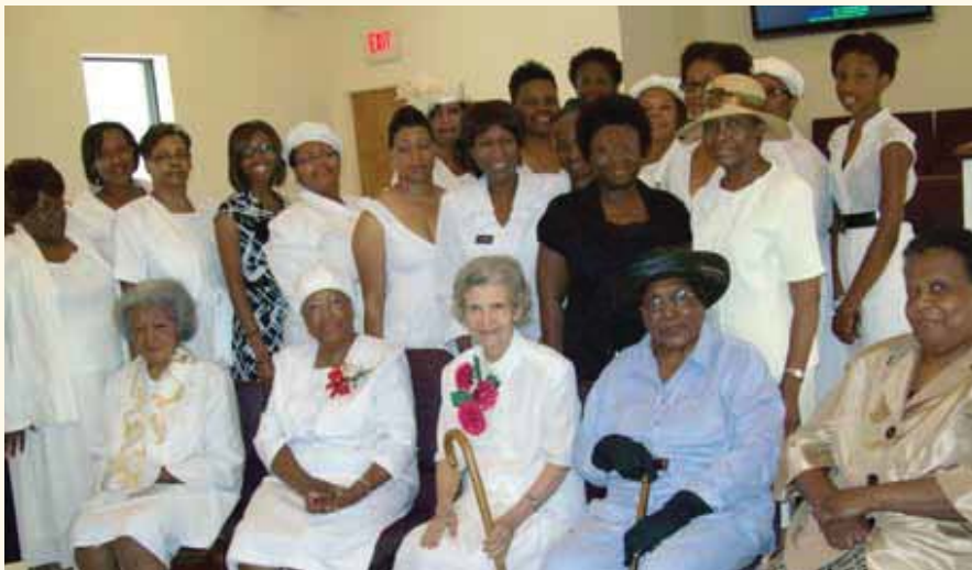
Pictured are the women who participated in the 40 days of prayer devotion.