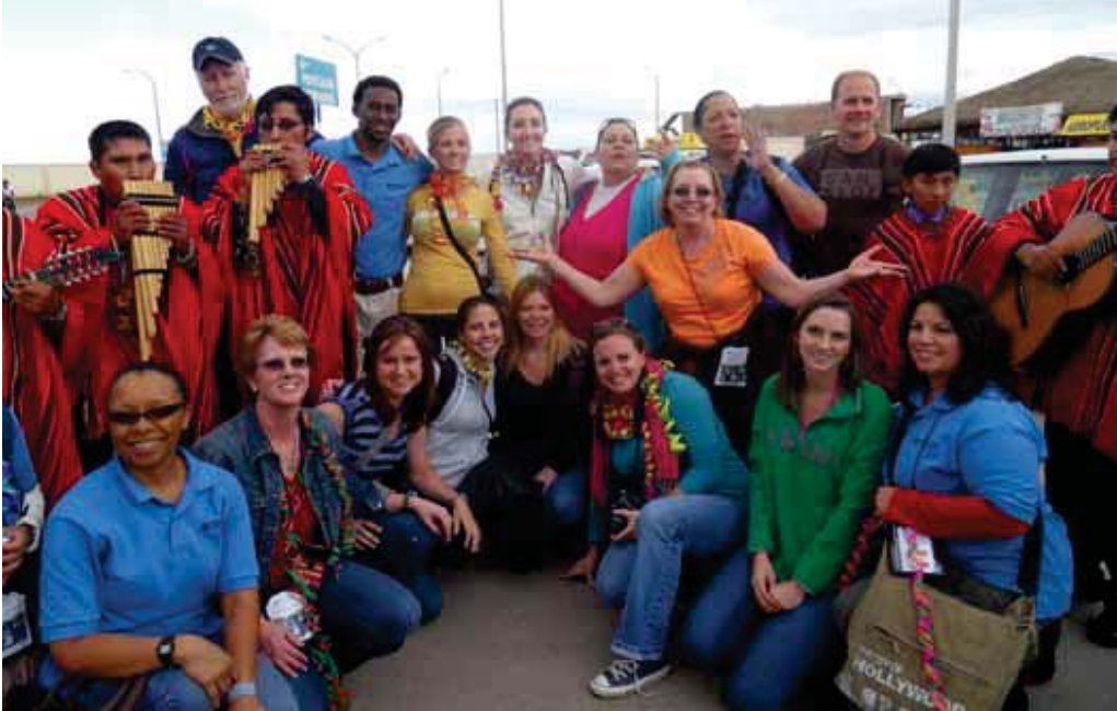
The group is greeted by clinic staff and folk performers.