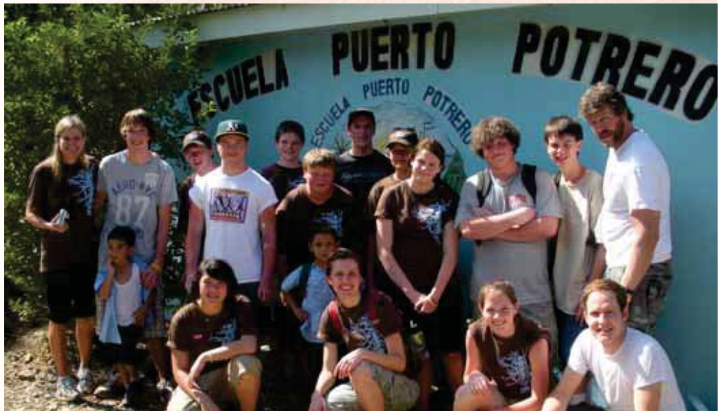
Members of the Mission 517 pose outside by the school sign in Tamarindo, Costa Rica.