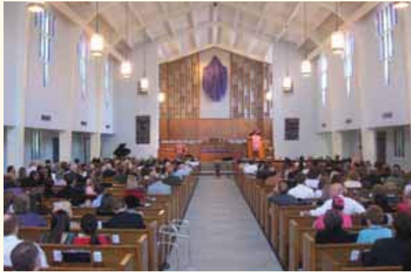
More than 300 people came to the Sabbath worship service.

“We have nothing to fear for the future, except as we shall forget the way the Lord has led us...” was the theme for Memphis Junior Academy’s (MJA) celebration of the school’s 100th anniversary.