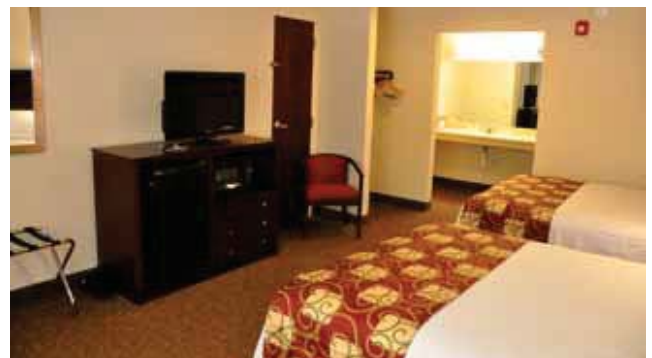
The new housing units were a welcome addition to the River Oaks property in Orangeburg, S.C.

The housing project is the third phase of the campground improvement initiative. The 4,100-seat adult pavilion was completed in 2001, and the youth pavilion with gymnasium was opened in 2006. The debt on both pavilions has been liquidated.