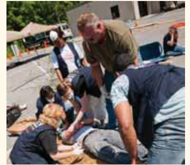
Participants responded to disaster simulations during the emergency response training.

The School of Social Work faculty and students hope this was the first of