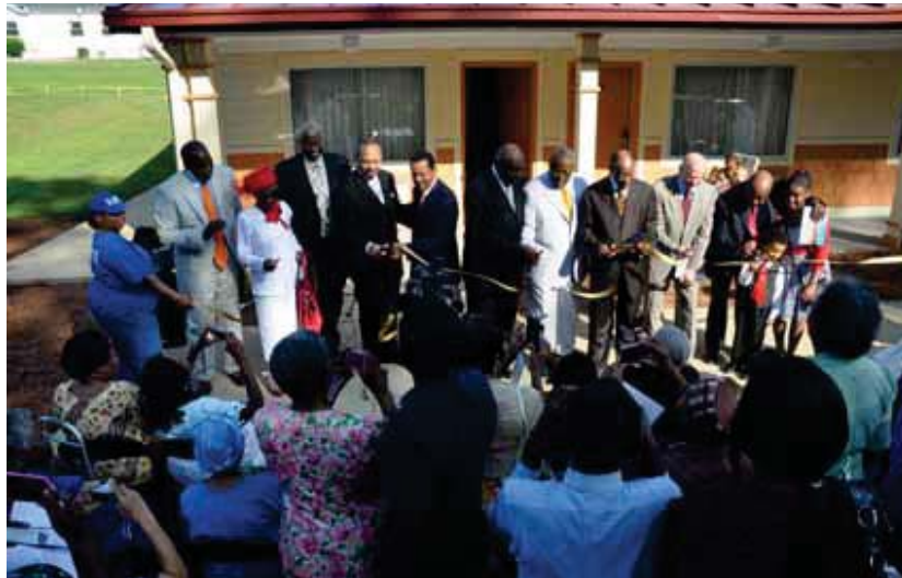
As the ribbon was cut by the Conference officials, and gently floated to the ground, the crowd responded with applause in praise to God.