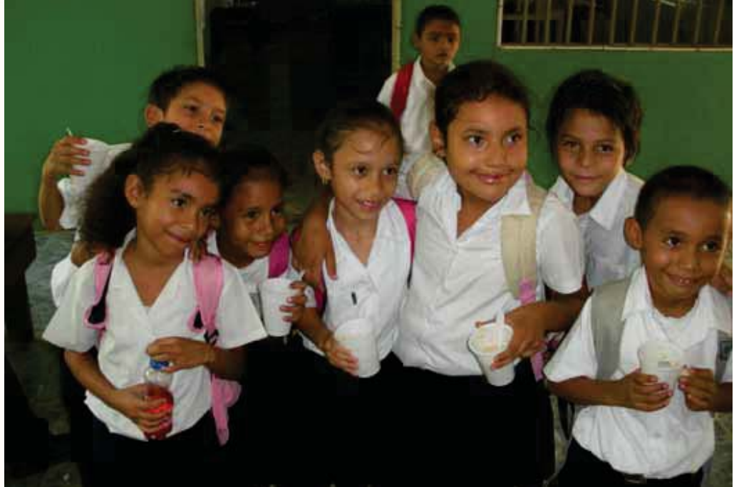
Happy, smiling children welcome the team in Tamarindo, Costa Rica.