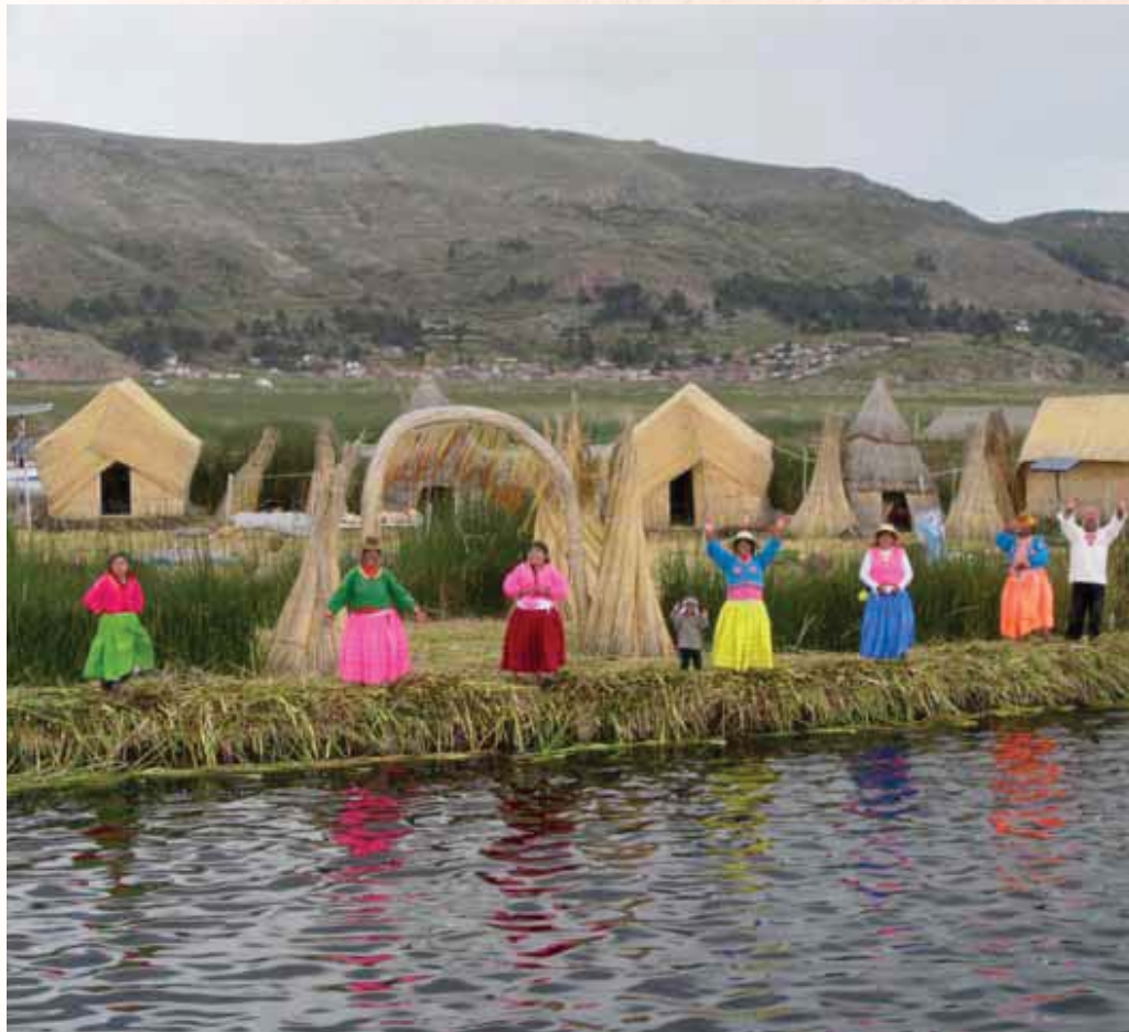
Members of the local Peruvian village greet the mission team in their native attire.