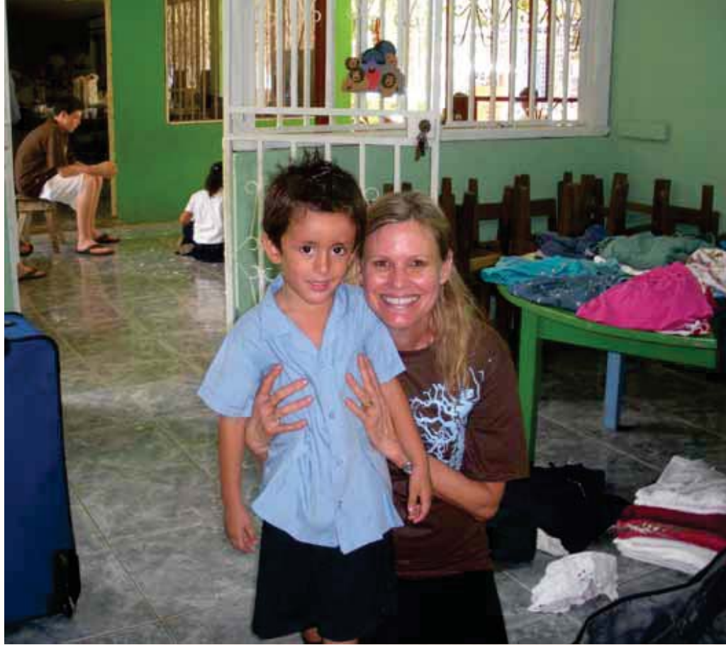
Happy smiles are everywhere on Mission 517 trips.