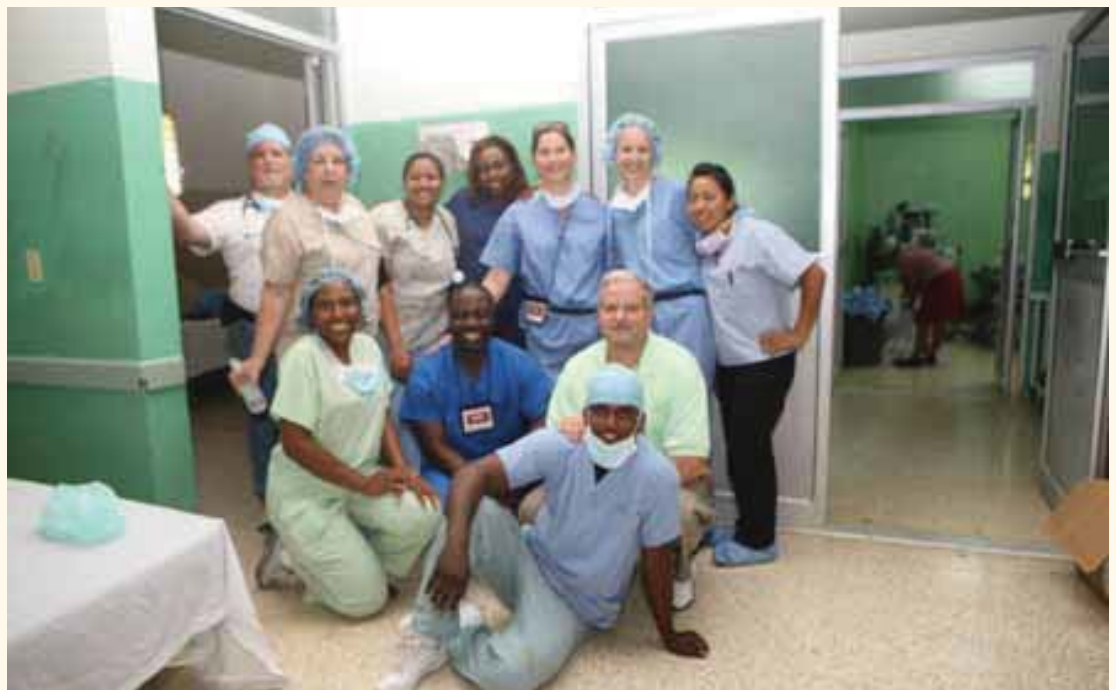
Members of the medical mission team gathered at the end of a long day of surgeries at the clinic in Sanchez, Dominican Republic.