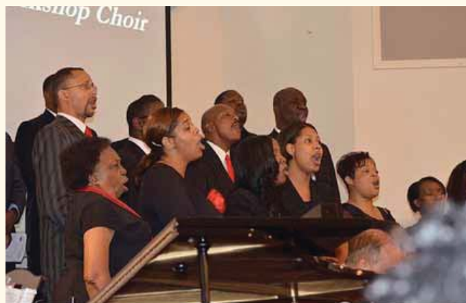
The JUICE workshop choir performed during the Sabbath, May 21, 2011, church service.