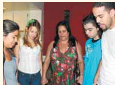
Participants pray that God will “increase their territory” in the Miami area.