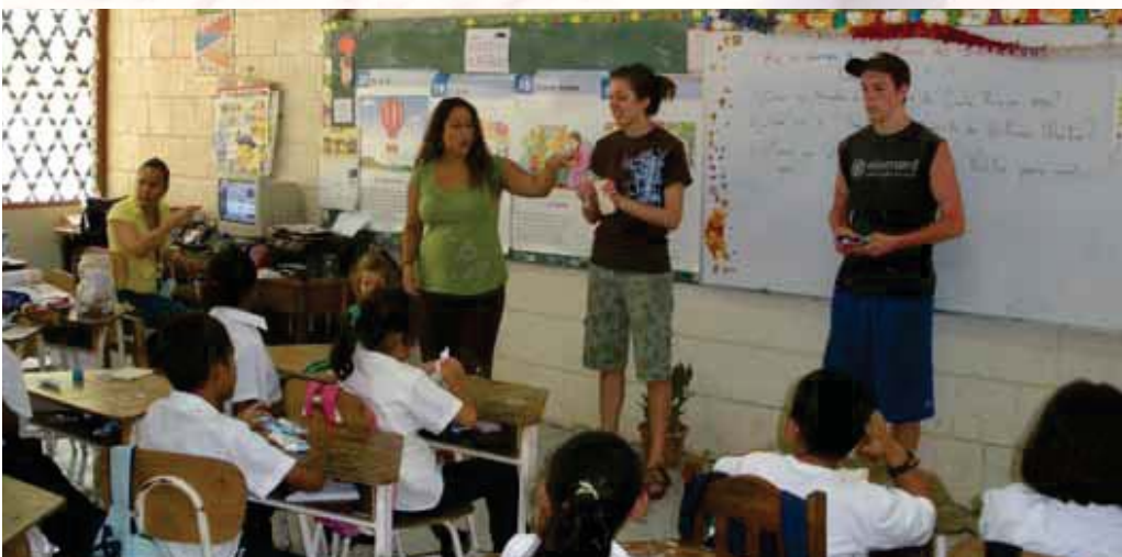
Members of Mission 517 assist the teacher in the classroom.