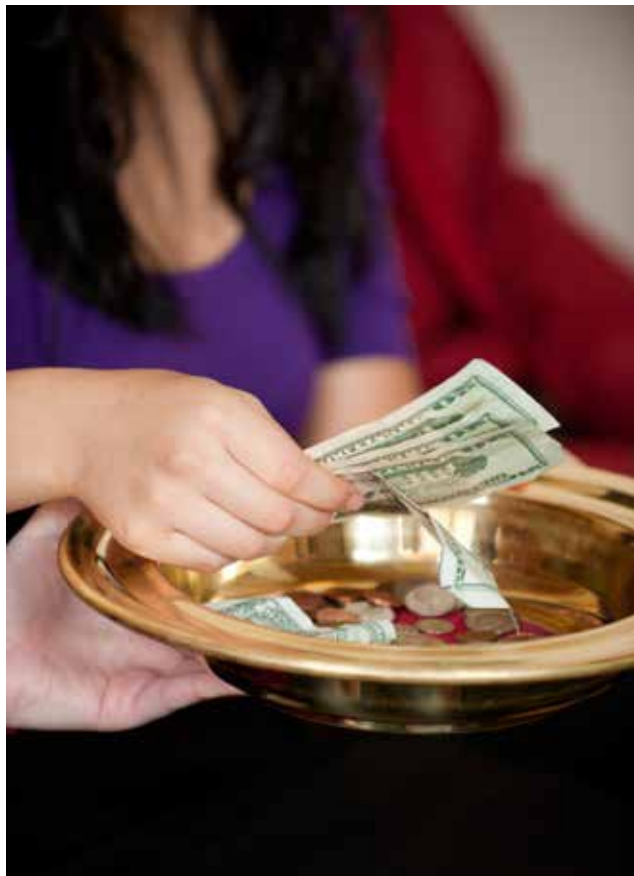
Financial planning instructions can be found throughout the Bible. If followed, these principles can lead to personal wealth and financial success for our churches.

David tells us in the Psalms to honor the Lord with our wages, and put God first with the increase of our finances. For those who do not heed David's message, Malachi further instructs us as to why we may not receive God's blessings.