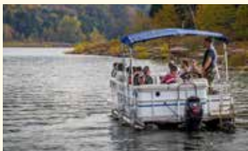
The men enjoy a ride and the beautiful surroundings at Center Hill Lake.

For the second year in a row, the Lord blessed with stunningly beautiful fall weather as the men of the Kentucky-Tennessee and South Central conferences gathered at Indian Creek Camp in Liberty, Tenn., October 24-26, for a joint Men’s Ministries Conference. Approximately 75 men were in attendance from Alabama, Georgia, Indiana, Kentucky, Mississippi, Ohio, and Tennessee.