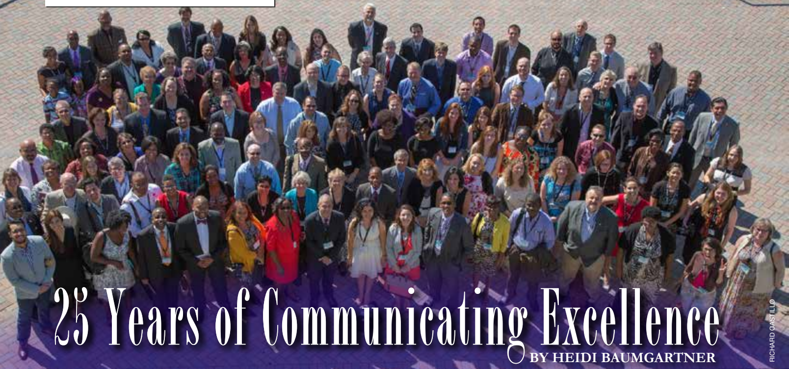
Pictured are attendees of the 25th anniversary celebration of the Society of Adventist Communicators in Jacksonville, Florida, October 16-18, 2014.

If you surveyed Adventist communicators in the last 25 years, they would tell you the city of their first time attending the Society of Adventist Communicators (SAC) convention. Some might say Orlando, Florida; Huntsville, Alabama; Ontario, California; Nashville, Tennessee; Rochester, New York; Denver, Colorado; Dallas, Texas; Albuquerque, New Mexico; or many other locations across the country.