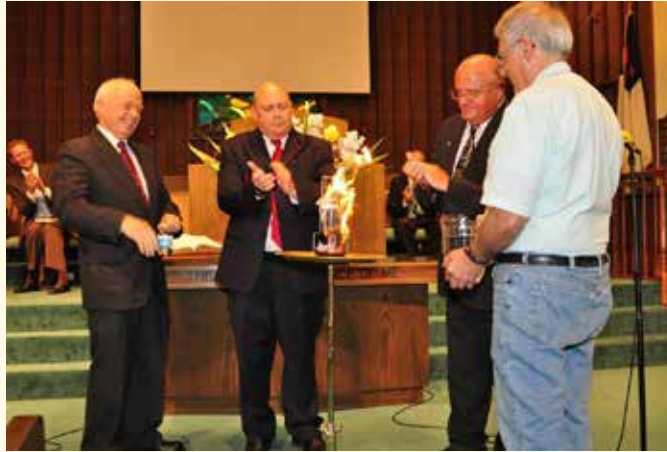
MCDONALD ROAD CHURCH

The church had been working to pay off the mortgage since members decided to add a new children’s wing, which opened in 2003. Church members completed payments on the $775,000 debt in January 2014, which was five years early. A special service was held May 10, 2014, to burn the church’s mortgage and dedicate the children’s wing.