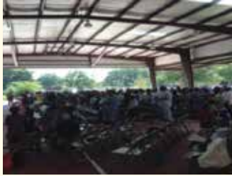
More than 300 individuals attended the dedication service of the Jay Winston Lifestyle and Community Center at Shiloh Church on August 23, 2014.

The members of Shiloh Church in Ocala, Fla., held a dedication service for its newly built community services center on August 23, 2014.