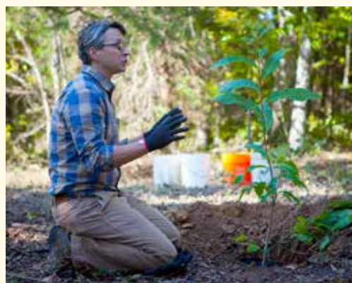
For the land dedication event, Southern partnered with a national conservation group in the planting of two American chestnut trees, a formerly abundant species which struggled in the last century but is making a comeback.