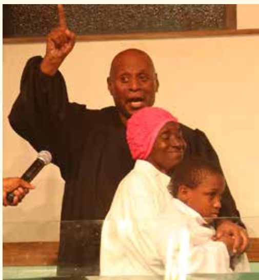
A mother and son are baptized after the Truth for Youth crusade held at Mt. Sinai Junior Academy in Orlando, Fla., from September 22 to October 10, 2014.