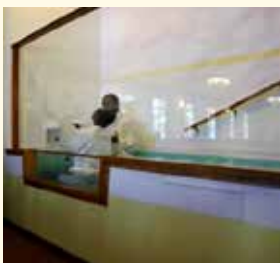
Mt. Gilead Church dedicates new baptistry.

Nestled close to downtown Bradenton, Fla., is the home of Mt. Gilead Church.