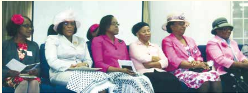
Platform participants, and most everyone in the audience, wore pink and gray attire in support of Margate Church's Women's Ministries Day program.

The event lauded two young people for their contribution and leader-