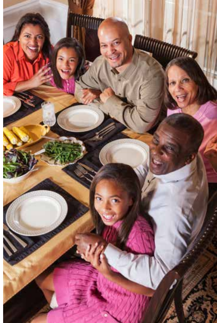
God promises to preserve our health if we are faithful and follow His promises.

The gas couldn't have been turned off. I was currently using the gas to cook. I quickly called the gas company who confirmed the gas was turned off, and would not be back on until Monday. I