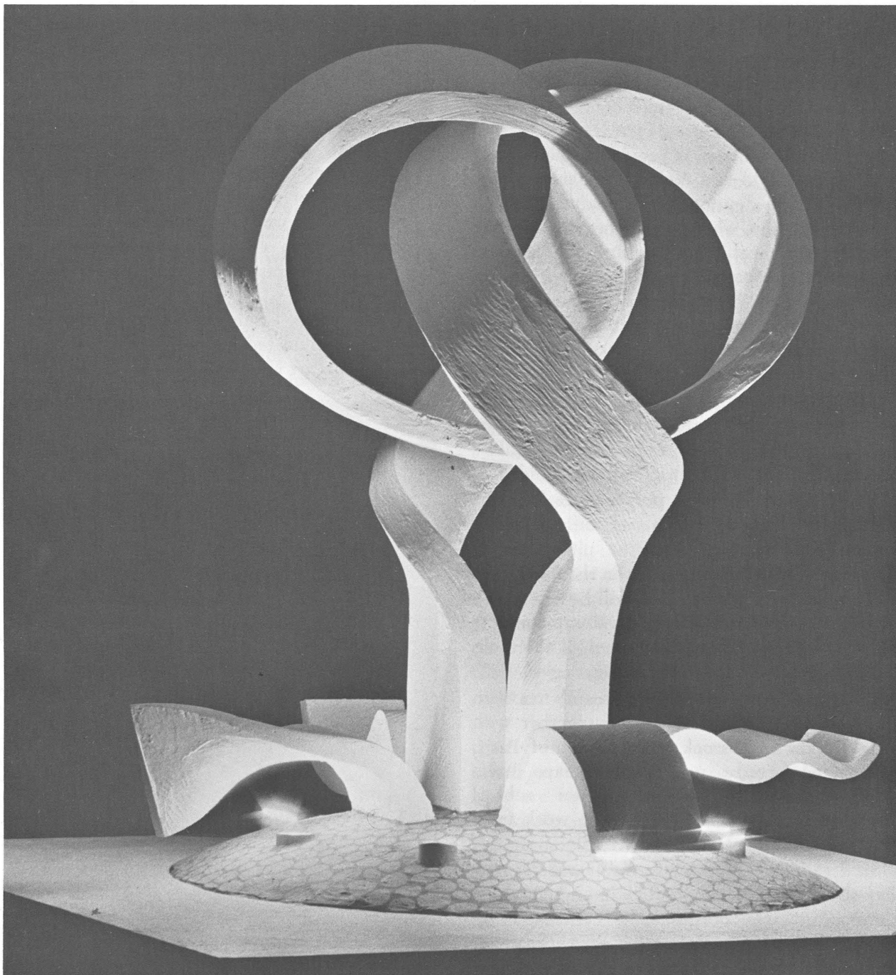
A model of Alan Collins' sculpture, Regeneration.

However, the search for iconographic validity was still on and a fairly clear mandorla form was found imprisoned in the intersecting loops. This