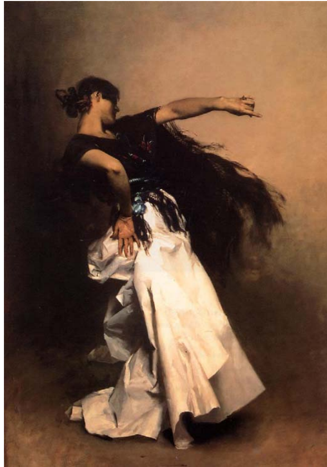
John Singer Sargent, "Spanish Dancer," 1880-1881