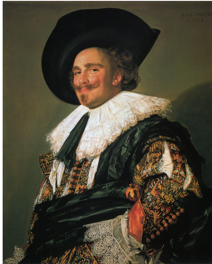
Frans Hals, "The Laughing Cavalier," 1624