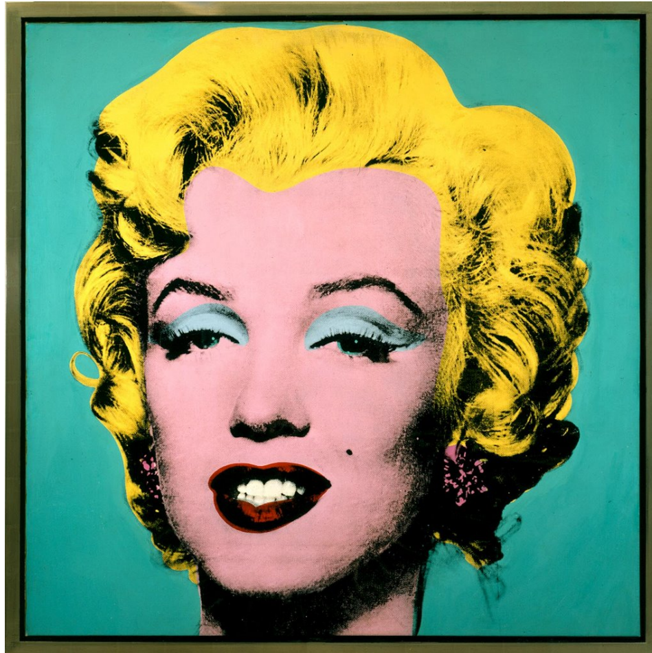
Andy Warhol, "Marilyn"

2. A given name that refers to no one else