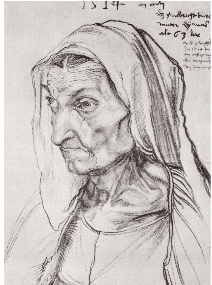
Albrecht Durer, "Portrait of the artist's mother," 1540