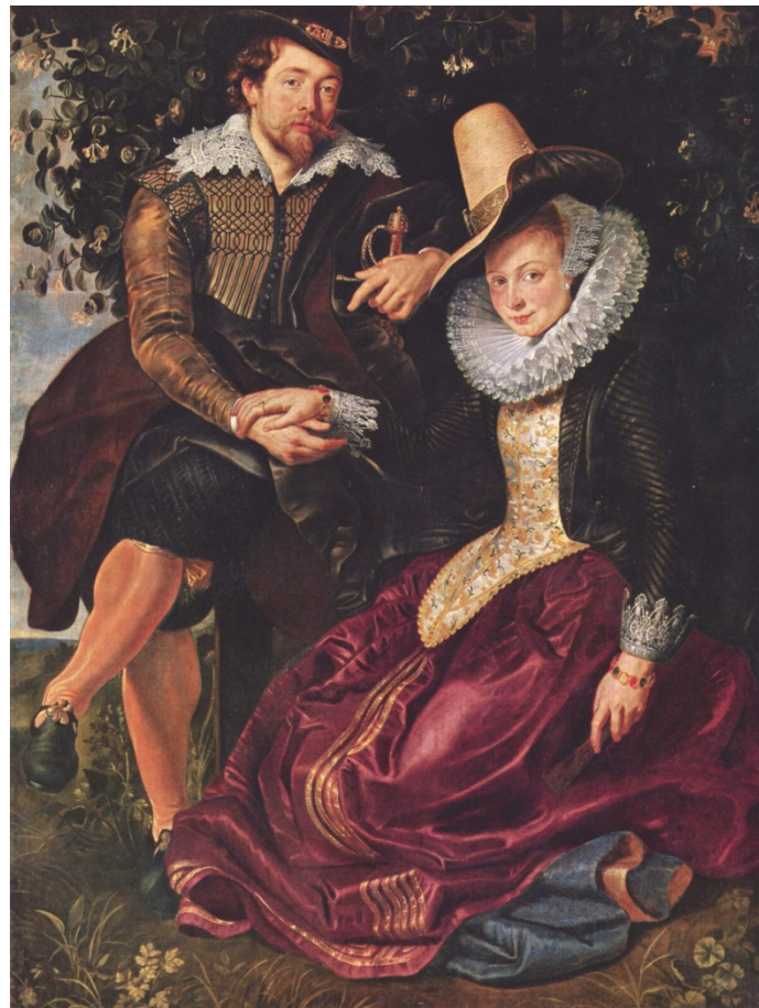
Peter Paul Rubens, "Rubens and Isabella Brant in the Honeysuckle Bower," 1609-1610

5. A consciousness of the distinction between one's person and another's, and the possible relationship between them