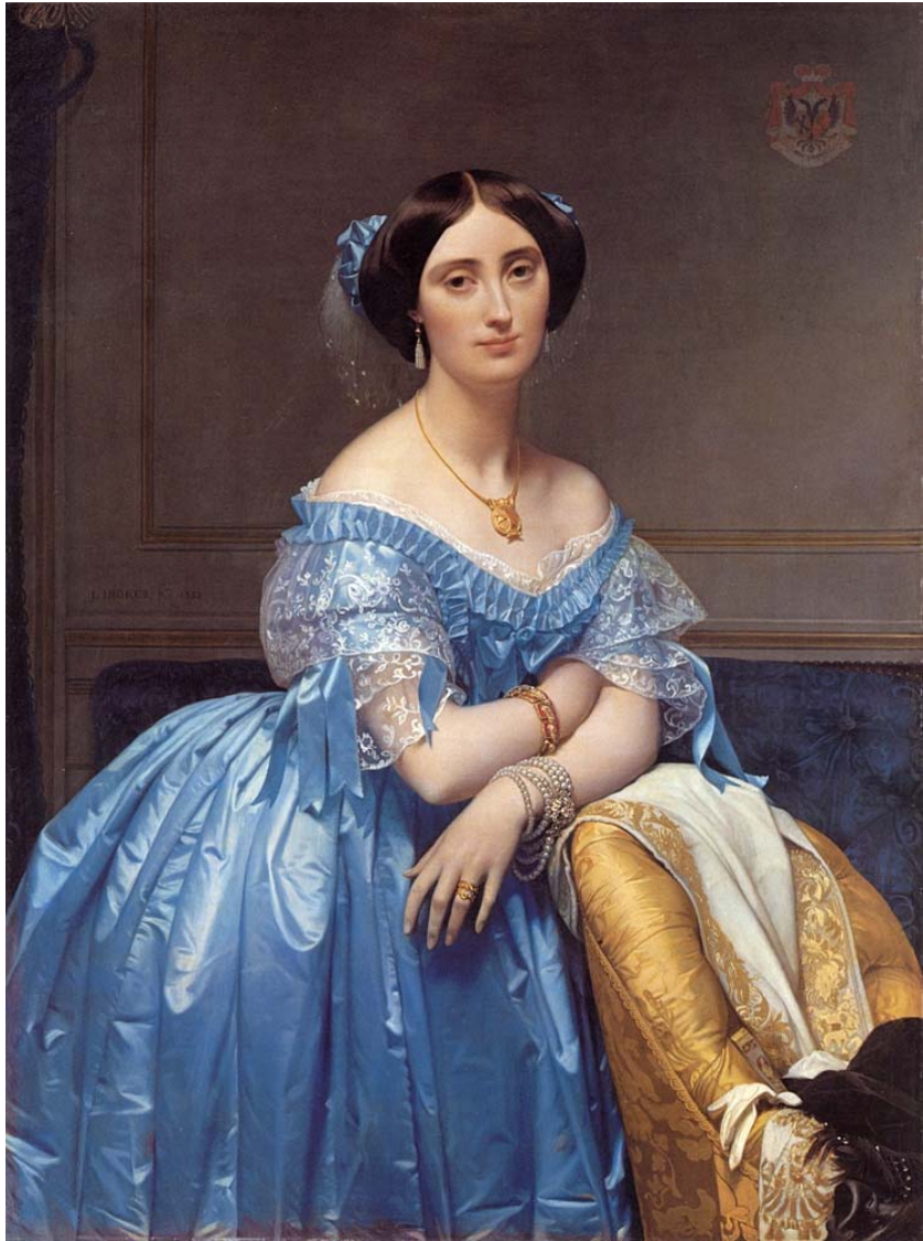
Jean Auguste Dominique Ingres, "Princesse Albert de Broglie," 1853