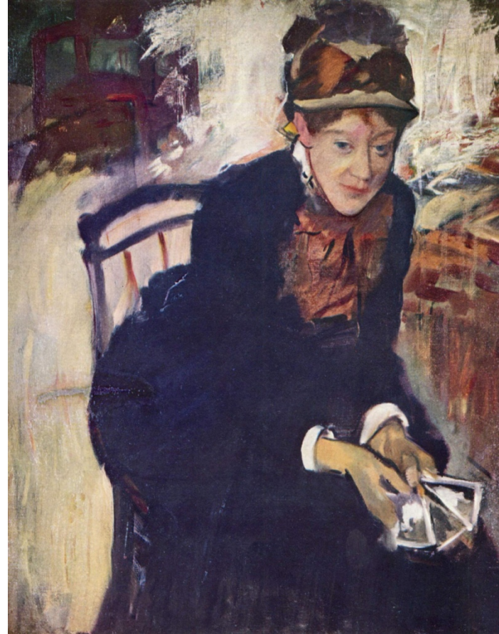
Edgar Degas, "Portrait of Miss Cassatt, Seated, Holding Cards," 1876-1878