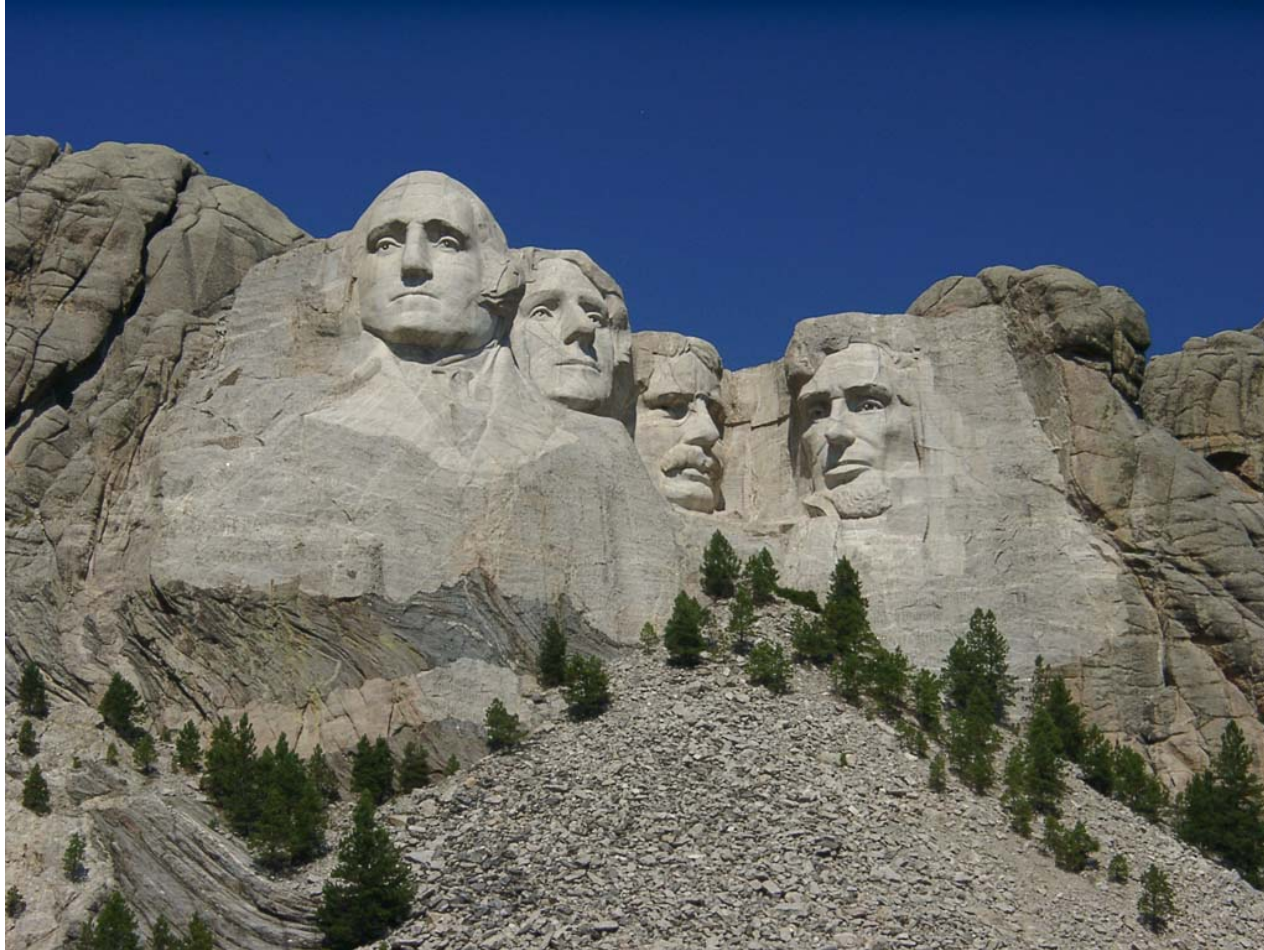
Gutzon Borglum, "Mount Rushmore National Memorial," 1927-1941