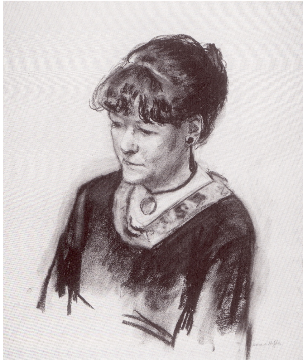
Edward Hopper, "Jo Hopper," 1945-1950