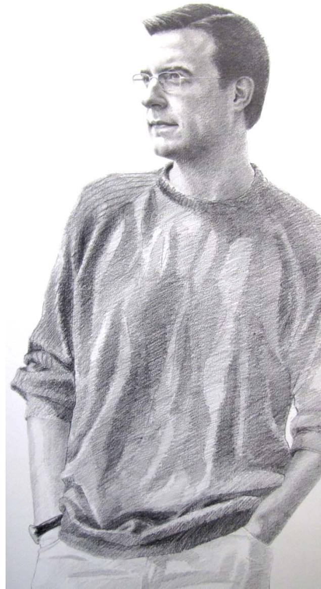
“Eric,” 2009 (Detail)