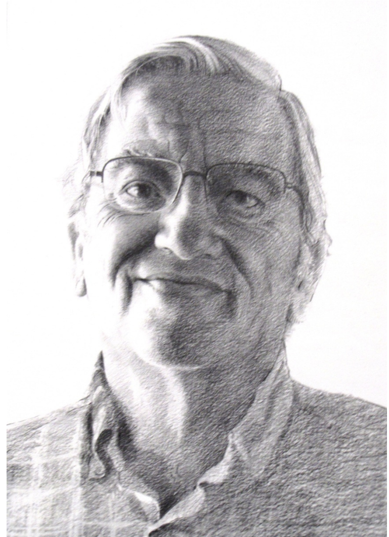
“Dad,” 2009 (Detail)