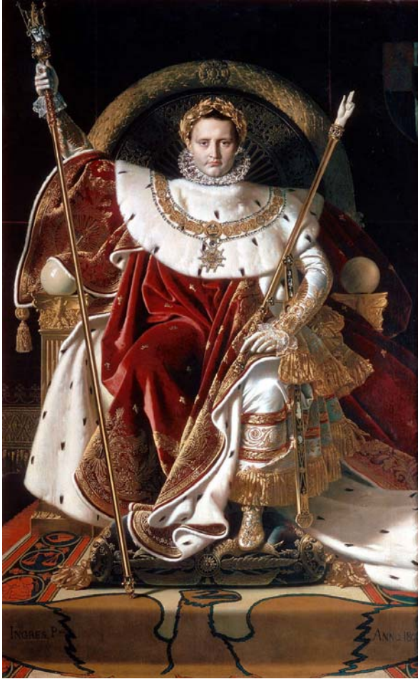
Jean-Auguste Dominique Ingres, "Napoleon I on His Imperial Throne," 1806