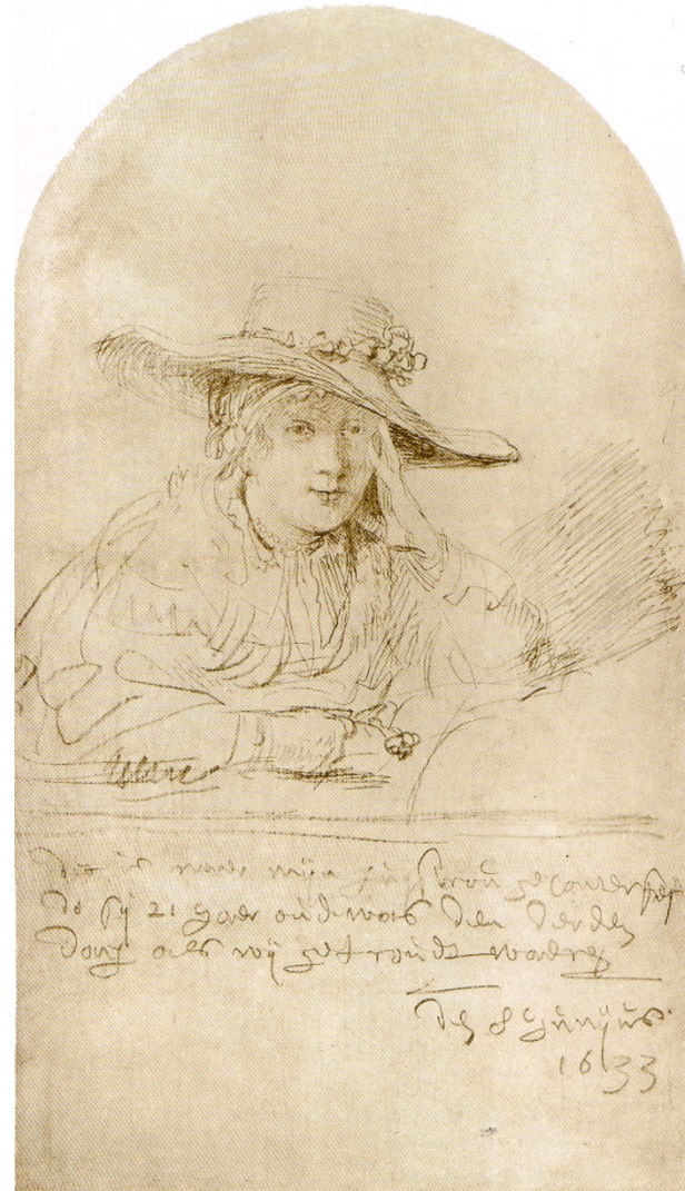
Rembrandt van Rijn, "Saskia van Uylenburgh," 1633