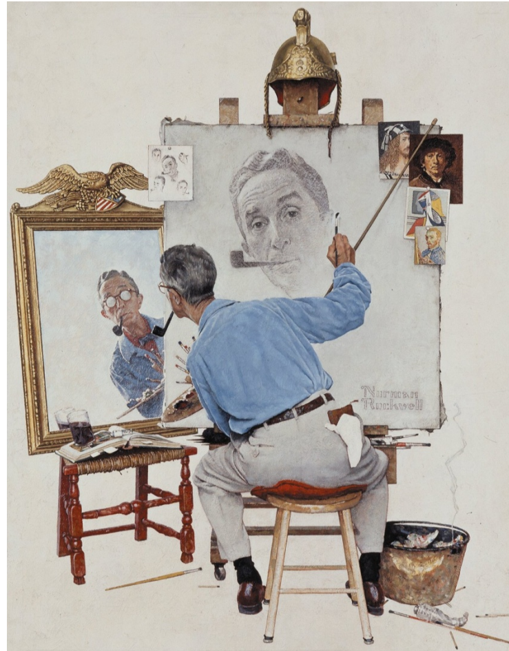
Norman Rockwell, "Triple Self-Portrait," 1960.