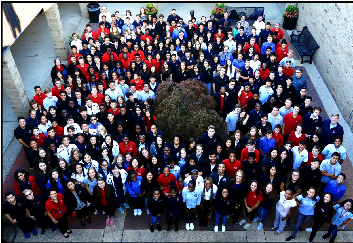
AA Family 2018-19

Current girls locker room that needs to be renovated.