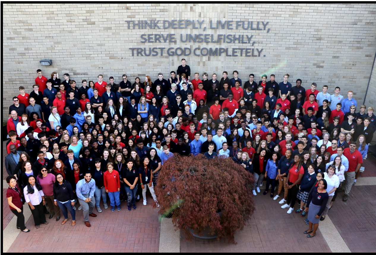
AA Family 2019-20