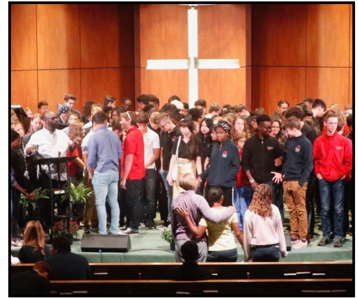
Updated Chapel Wall