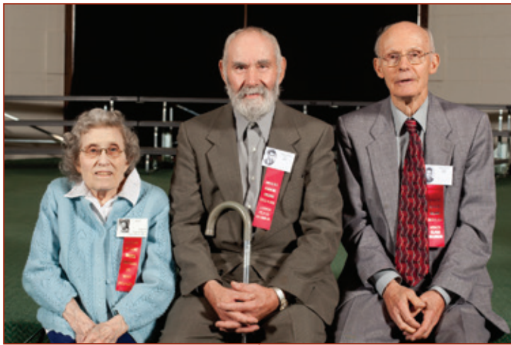
Class of 1947