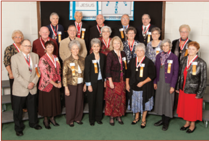
Class of 1962