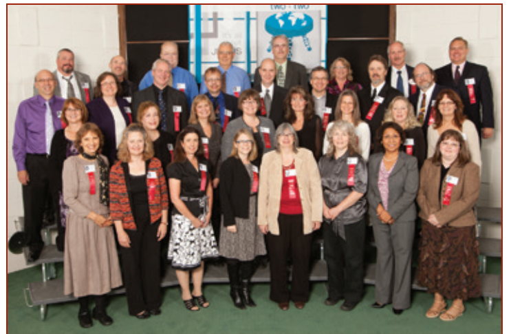
Class of 1977