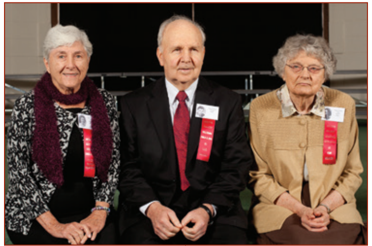
Class of 1952