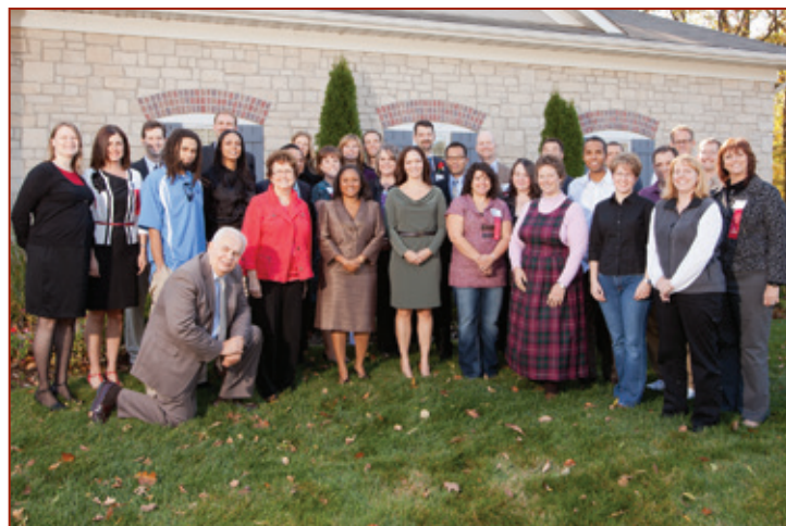
Class of 1992