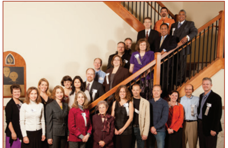
Class of 1987