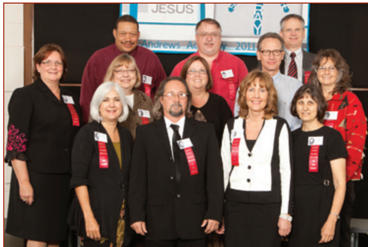
Class of 1972