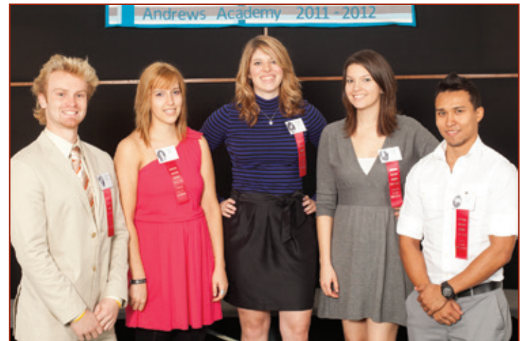
Class of 2007