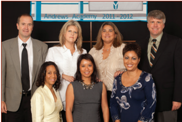
Class of 1982