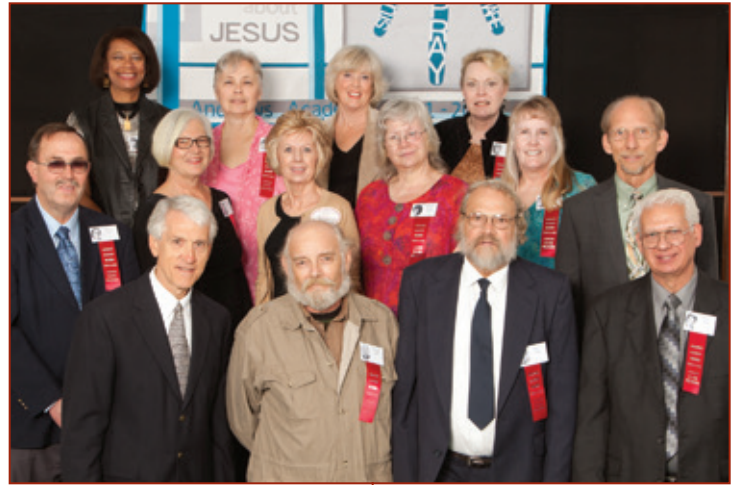
Class of 1967