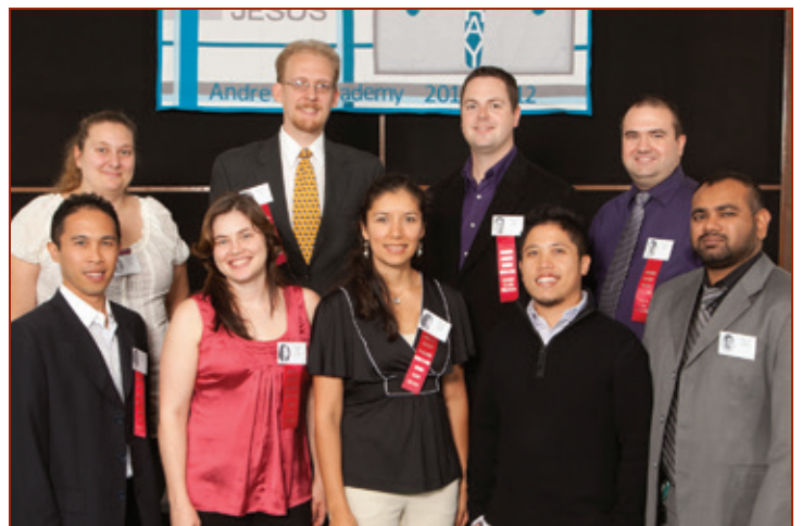
Class of 1997