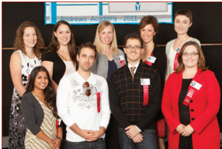
Class of 2002