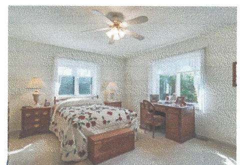
5 Bedroom's with EnSuite Baths

photography & flier by SouthBendRealtyPhoto.com