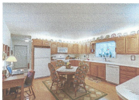
Spacious Kitchen w/ Casual Dining