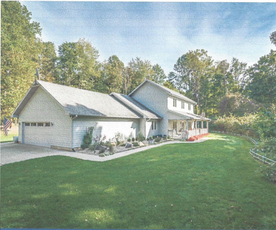
Naturalist's Delight on 2.71 Acres with St. Joseph River Frontage

11941 S. Lake Chapin Rd, Berrien Springs