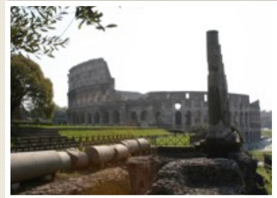
The Colosseum, Rome

• For more information: email: gctours@mac.com or call 269-815-8624.