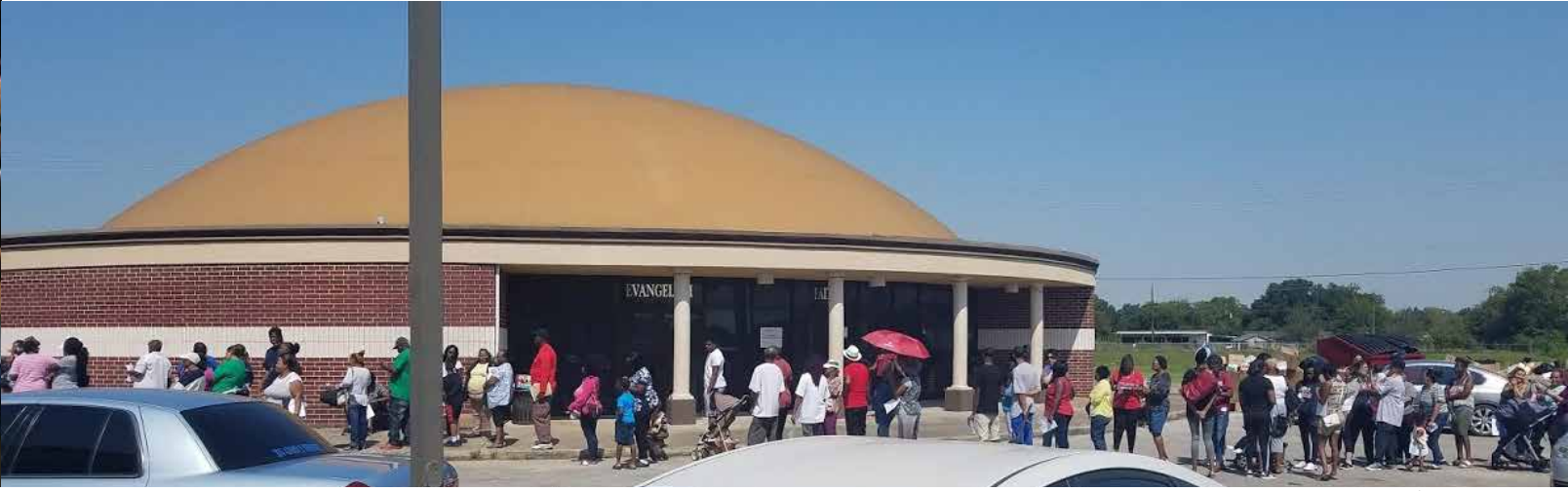
▲ Hurricane victims form long lines at the World Harvest Outreach Church in Houston.