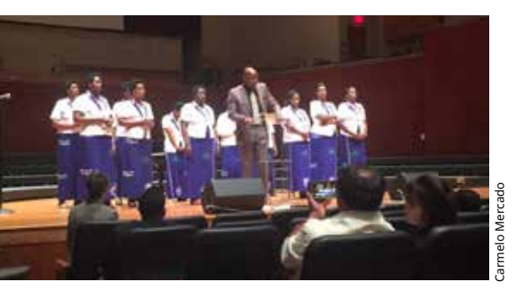
▲ The Rwandan choir from Grand Rapids sang during the Sabbath program.