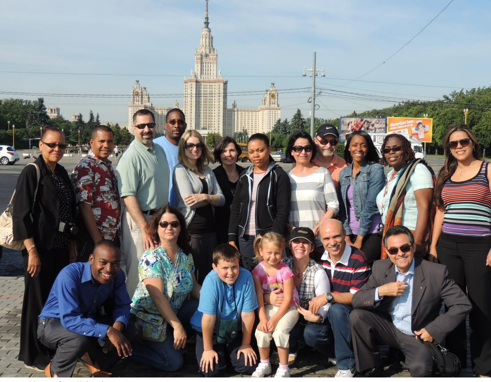
Moscow State University