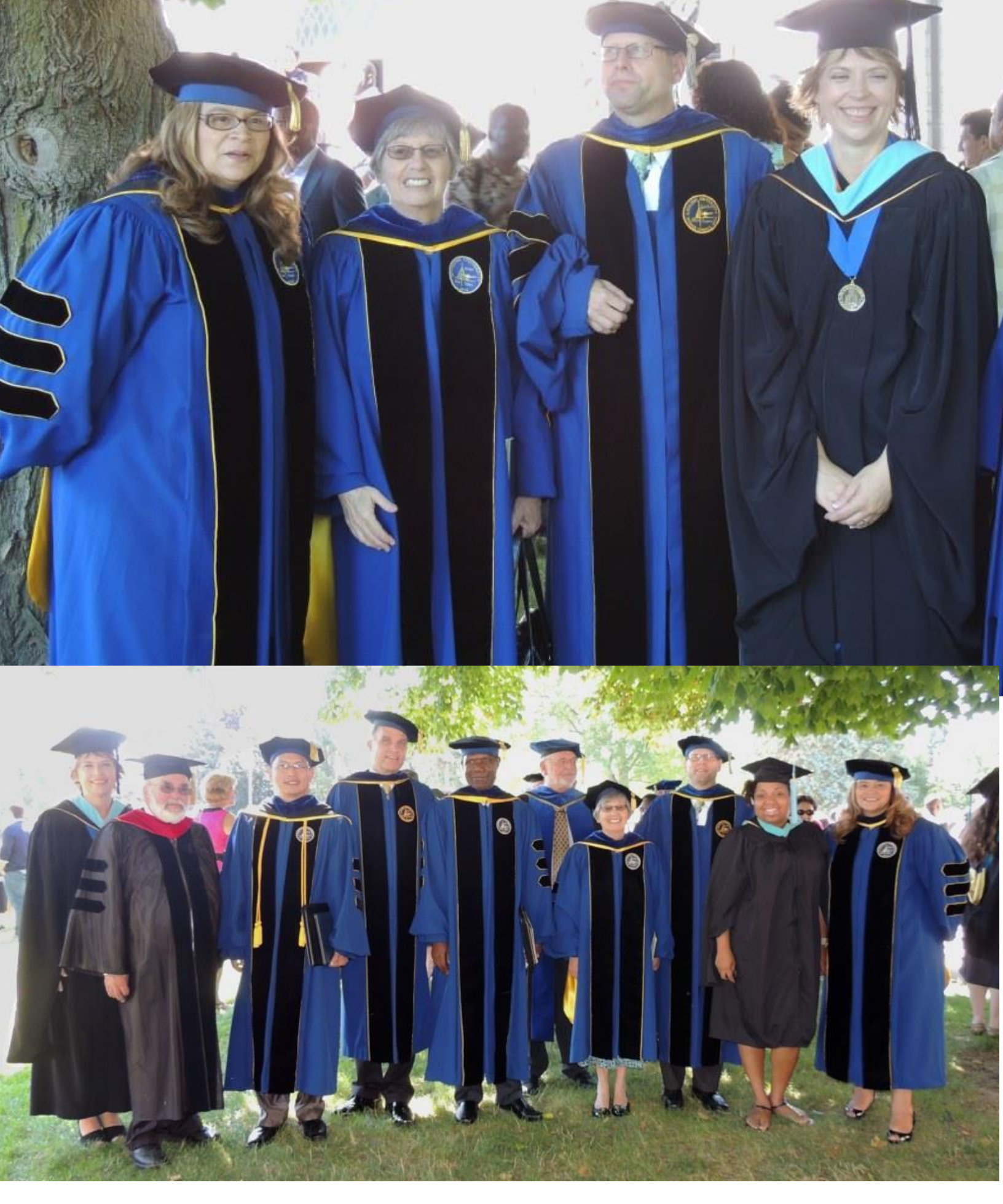
Graduations are a time of joy for graduates, family members and the faculty. After years of diligence commitment, the long awaited day arrives. We celebrate with those who have endured and completed this phase of their dreams and aspirations. Congrats Graduates!