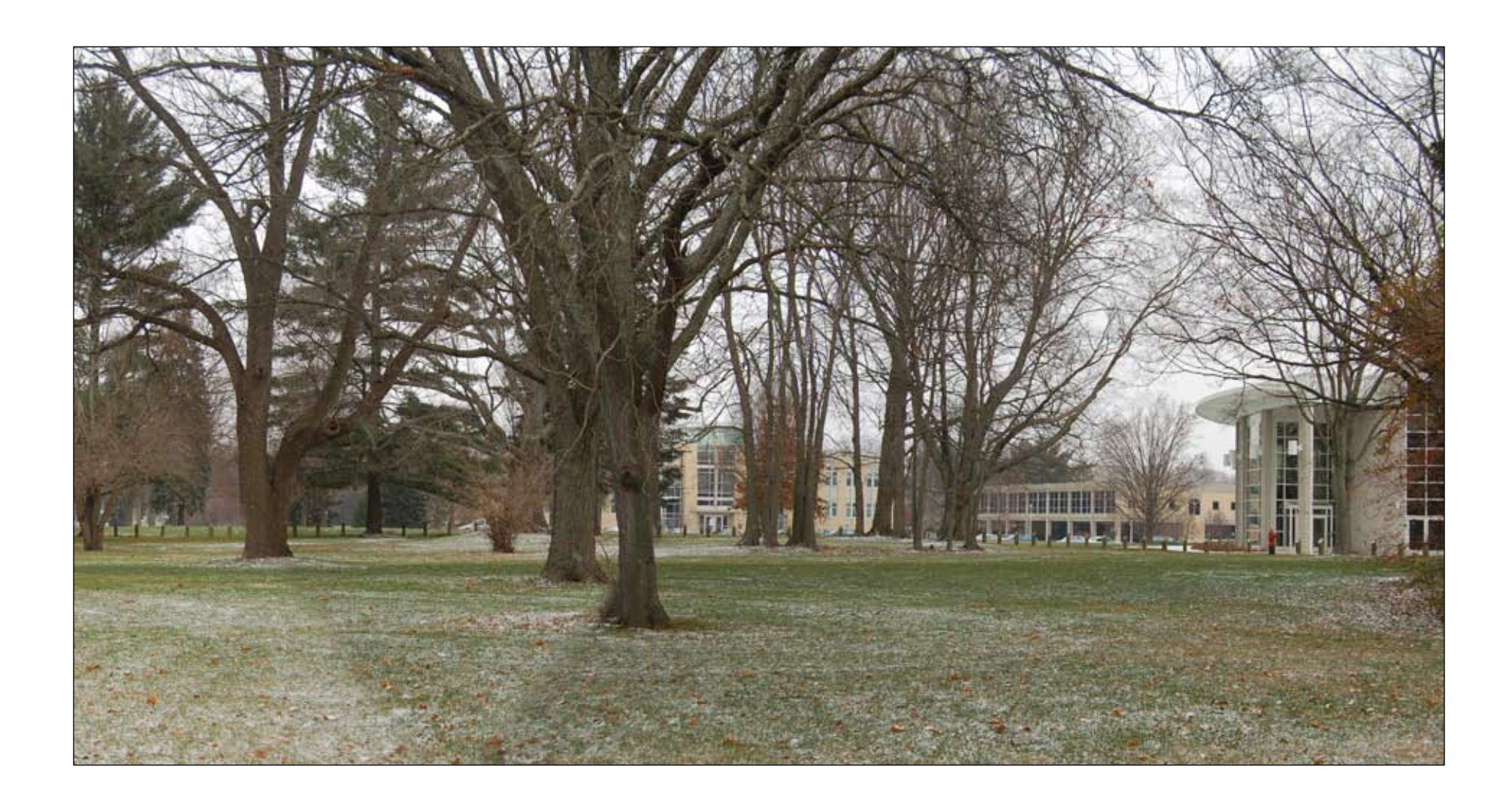
Existing View of Proposed Entry Road Location