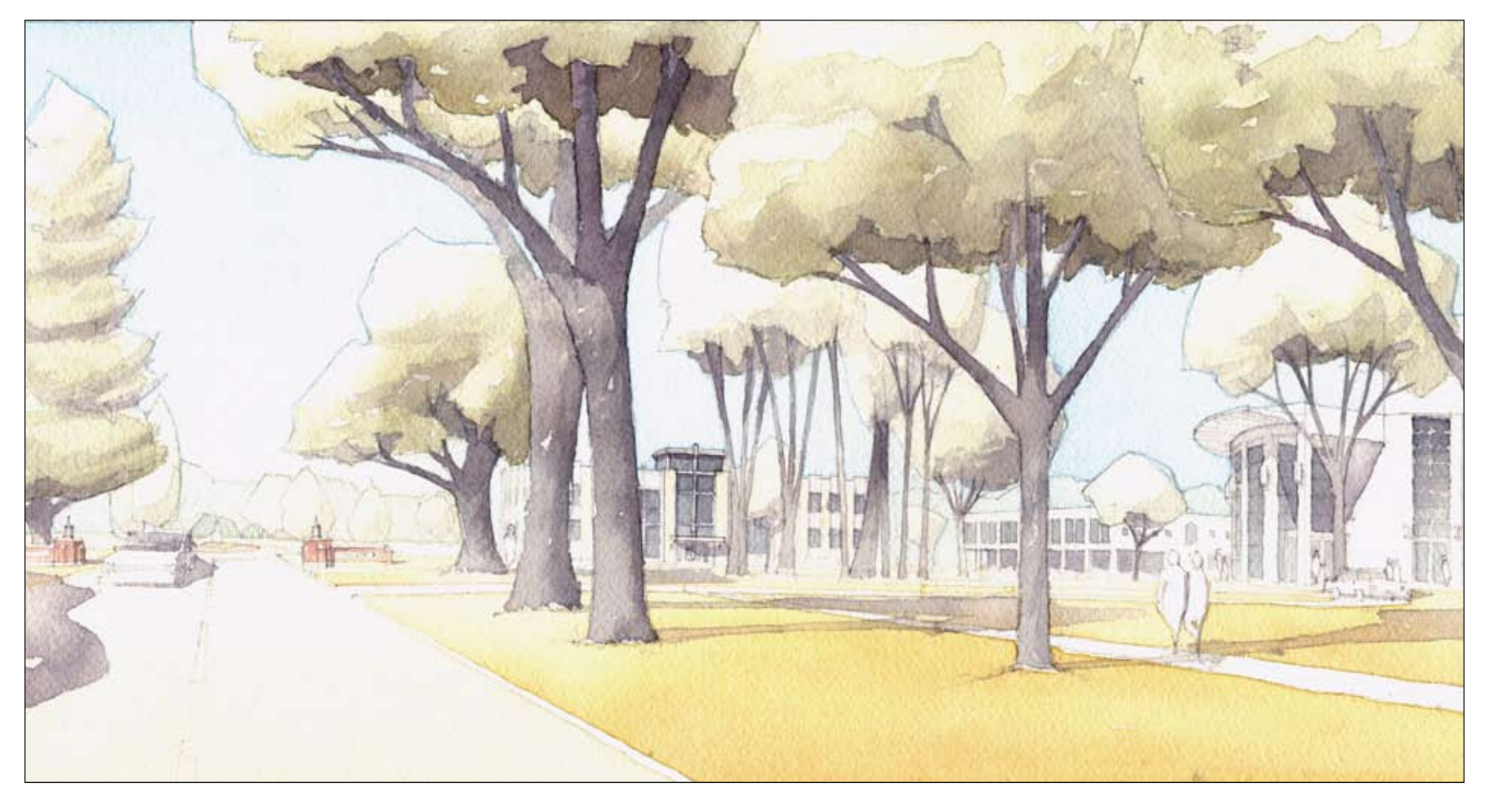
Proposed View upon "Entry" into Campus

Rendering prepared by Jonathan Harrison (AU Class of 2007) of Hibler Design Studio