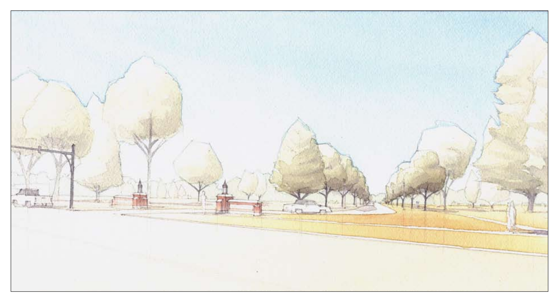
Proposed View of New Entry Road from Old US 31 Rendering prepared by Jonathan Harrison (AU Class of 2007) of Hibler Design Studio