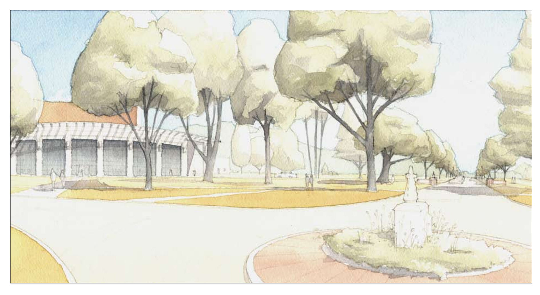
Proposed View looking South towards Old US 31 and the Howard Performing Arts Center