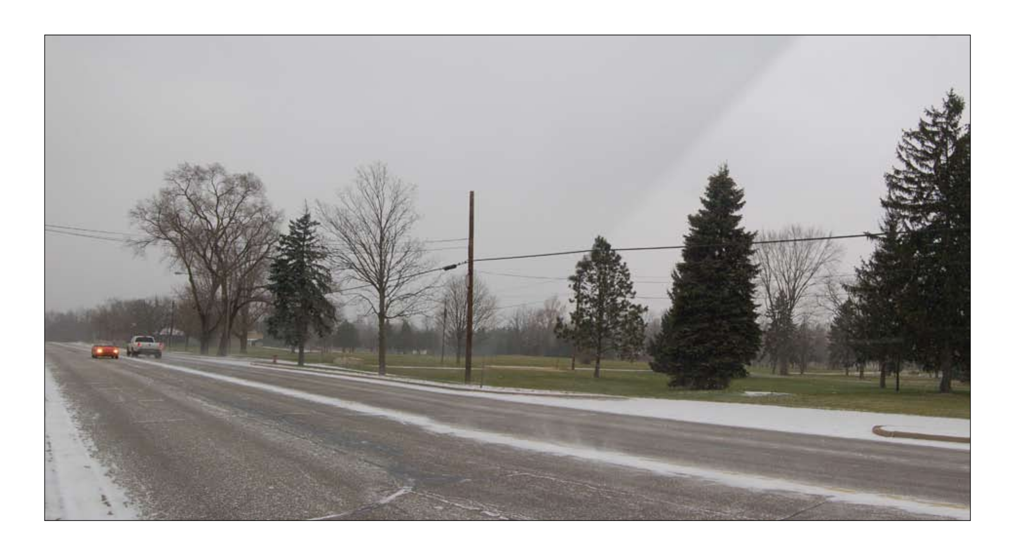
Existing View of Proposed Entry Road Location