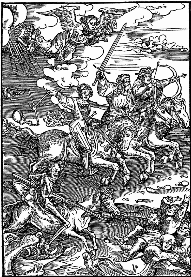
The Four Horsemen of the Apocalypse. A woodcut by Lucas Cranach in Luther's September Bible . Reproduced from Strand, Woodcuts from the Earliest Lutheran and Emserian New Testaments , p. 27.