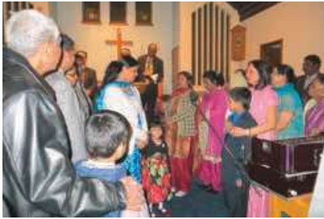
At the organization service the Greater New York Conference officers call the names of the charter members of the New York Southern Asia church.