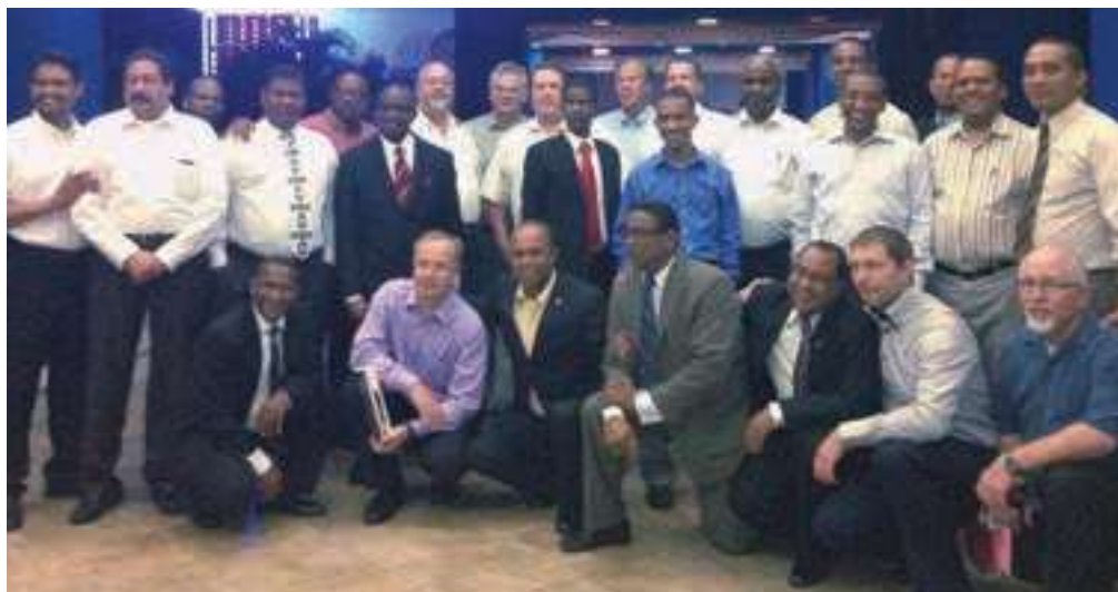
Pastors from the New York Conference and the Dominican Republic during the New York Conference mission trip to Santo Domingo.

Four ministers' wives also made the trip. The