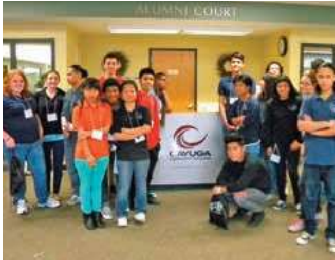
Union Springs Academy class of 2015 participate at the Jump Start 10 youth leadership summit.

Fun highlights of the day included free Jump Start 10 sports packs and giveaways from various non-profit booths at the community