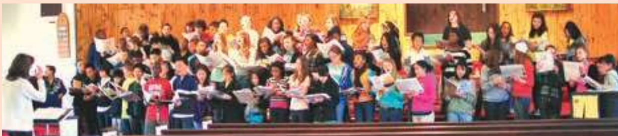
Students from New York Conference schools practice for the music festival.

More than 75 students in grades 6-9 attended the New York Conference Music Festival hosted by Union Springs Academy in March. With a theme of "You are Invited," songs focused on the glorious hope of Jesus' soon return