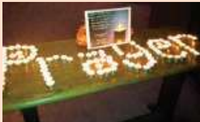
The Boston Temple church held a candle lighting and prayer service in honor of those impacted by the tragic bombing during the Boston Marathon.

A journal was made available for individuals to share their thoughts and prayers. Some of the thoughts included: