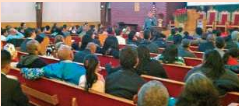
More than 150 lay people attend the Evangelism Institute sponsored by the Greater New York Conference Hispanic Ministries Department.

The Greater New York Conference's Hispanic Ministries Department launched the Evangelism Institute on January