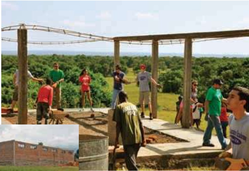
The South Lancaster Academy students used their spring break to build the boy's dormitory at the Oloosinon Primary School in Kenya.

The students made three trips to the brick factory to pick up 1,200 bricks each time. The students created a human chain to load and unload bricks many times throughout the work days. Twice, students went on "sand runs" to the river 45 minutes away to shovel sand into the truck and then unload at the building site. Daily, students went to a "cow pond" to fill buckets of water, loading them into an enormous water barrel on the back of the truck, transporting it to the build-