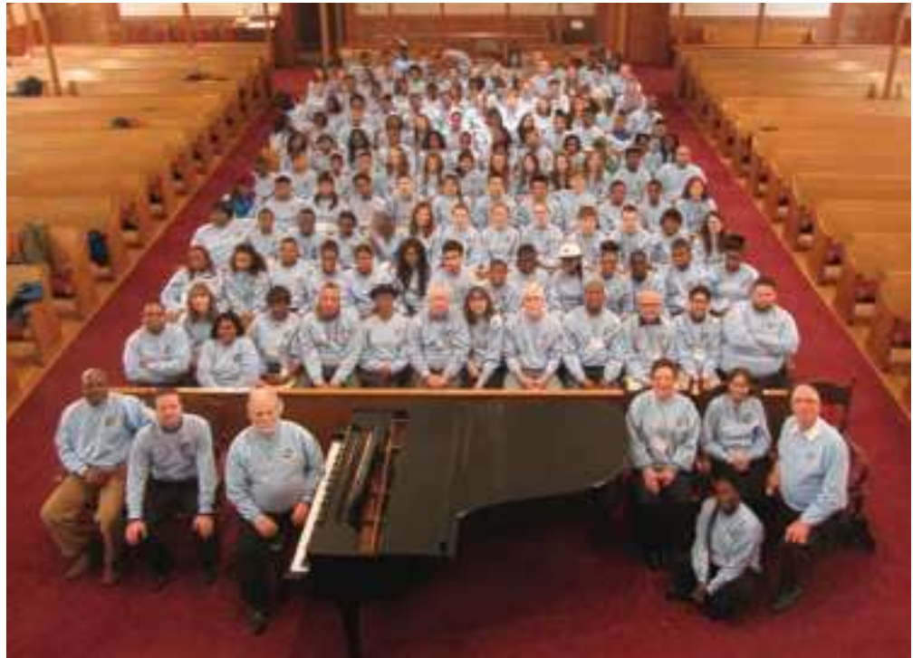
Students from Bermuda Institute, Central Vermont, Greater Boston, Greater York, Northeastern, Pine Tree, South Lancaster, and Union Springs academies participated in the music clinic in Brooklyn, New York.