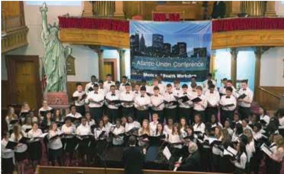
Academy students participate in the final concert for the weekend on Saturday night at the Hanson Place church.