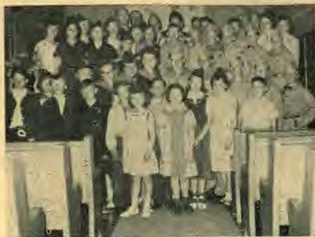
Thirty-eight Pathfinders and seven of their leaders constituting three Alberta clubs in the Leduc Seventh-day Adventist church. The picture was taken at the time of their investiture on May 24.

To combine an investiture service with an overnight outdoor camp and to take in a church picnic the next day is barrels of fun. At least this is the opinion of thirty-eight JMV Pathfinders and their seven counsellors when they talk of the successful Friend investiture service held in the Leduc, Alberta Seventh-day Adventist church Saturday night, May 24.