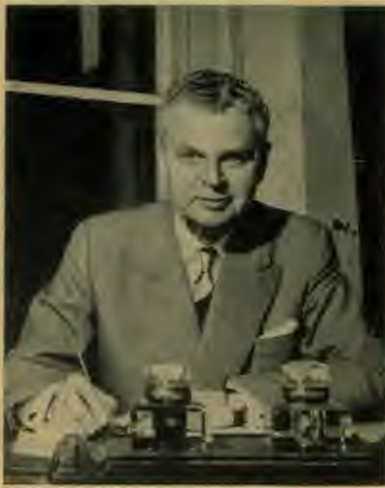
Prime Minister Diefenbaker