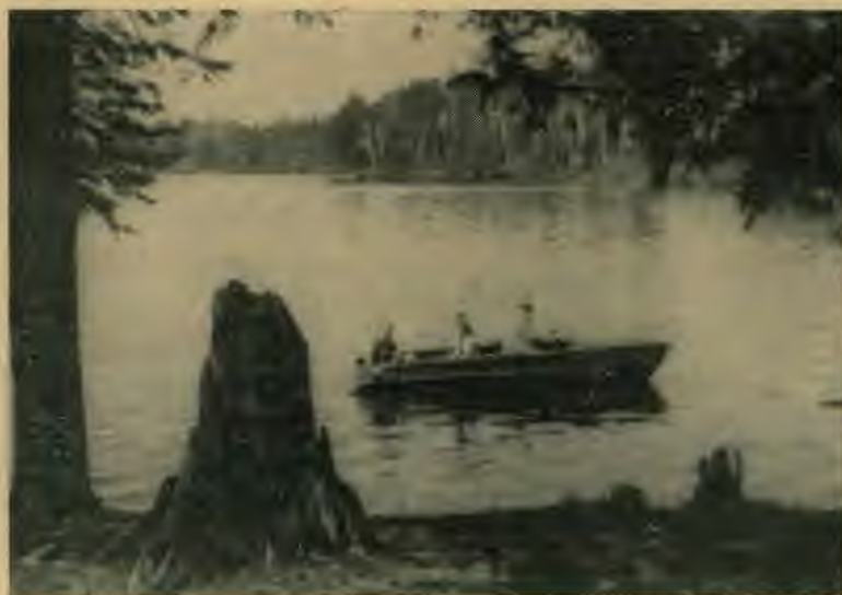
Beautiful Camp Frenda is calling boys and girls to attend July 7-20 and those interested in Senior-Family camp July 21-27.

Where can your boy or girl have more fun for the two weeks of July 7-20 than at Camp Frenda? Has the application for your child been sent in? For $23.00 each child from 9-16 may attend. Additional children from the same family or sponsor may attend for $21.00 each. Application forms may be had from MV Department, 114 King St. East, Oshawa, Ontario. Bus service is available from Oshawa to Camp Frenda and return for $4.00 per child. The bus leaves Oshawa promptly at 9 a.m. Monday, July 7. If coming a long distance, lodging will be provided at Oshawa Missionary College Sunday evening, July 6.