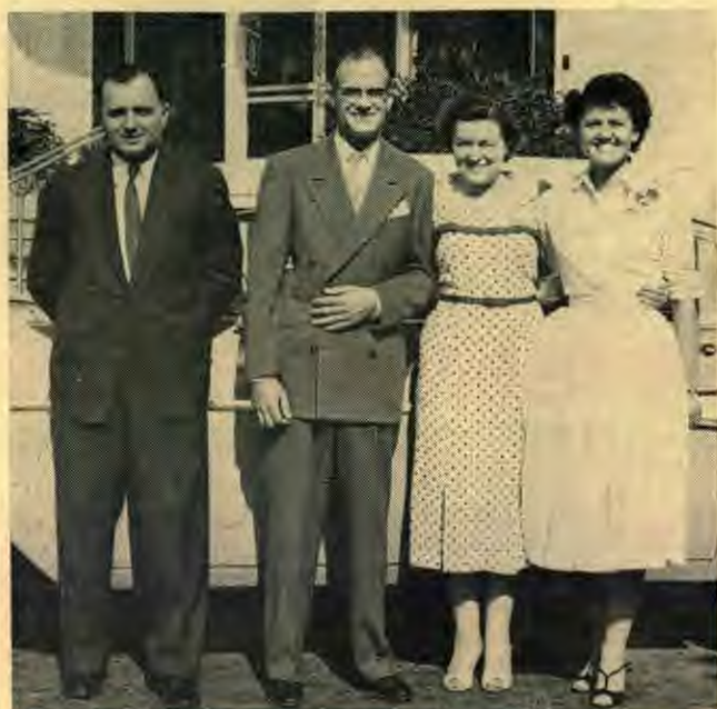
VOICE OF PROPHECY GROUP