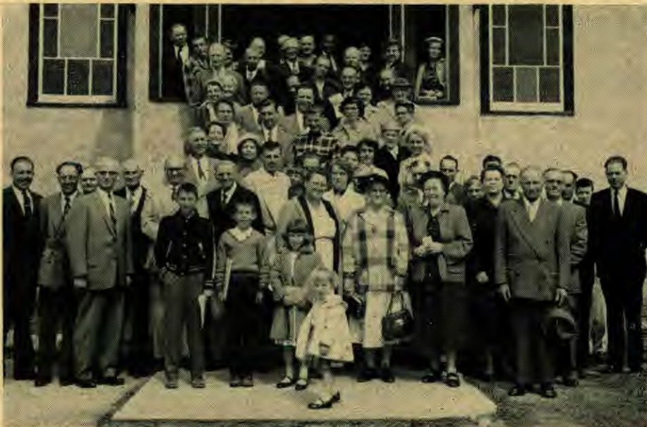
Literature Evangelism Beginners' Institute, Rutland, B.C.