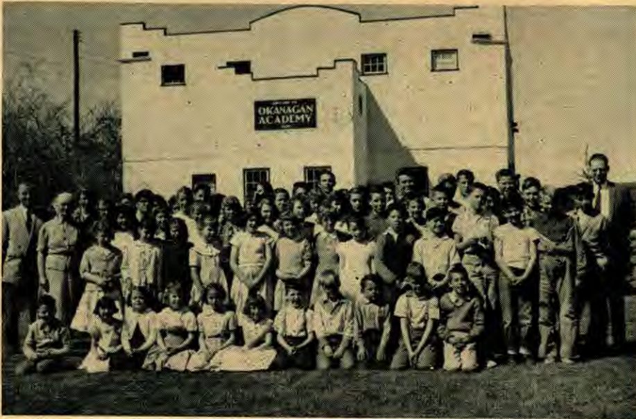
Okanagan Academy Colporteur Club.