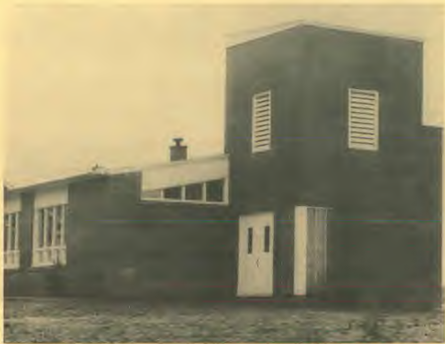
The Sudbury Seventh-day Adventist Church is the former Presbyterian church that five years ago was purchased for the sum of $25,000.00, and was dedicated debt free November 1.

The dedication of the Sudbury Church was a day of great rejoicing for the church members who, in less than five years, were able to burn the mortgage and be debt free. The church was full to capacity on November 1 for the dedication services. Pastor Pearse had just finished a series of evangelistic meetings culminating in a baptism, and was happy to be in Sudbury with his wife for the