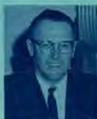
Albert Grabo Maritime