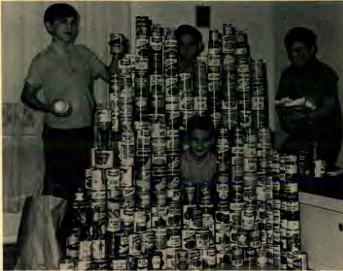
Elementary Students with some of the 1000 cans of food they collected on Halloween night.

Instead of the usual Halloween pranks on Halloween night, the Elementary students of Canadian Union College collected food for gift baskets during the Christmas season.