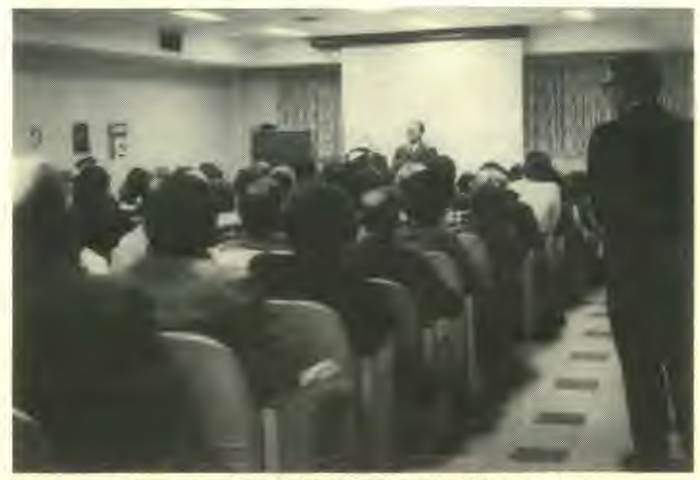
Group attending Halifax-Dartmouth Five-day Plan

January, 1974, brought a record enrollment of 117 to the Halifax Infirmary Auditorium. After the final session one lady