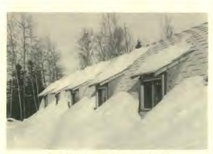
Youth Auditorium-ready for all weather use.

If you are a supporter of the camp, you are a supporter of one of the best programs possible — a program of bringing the SDA members together, united through the Spirit of Christ and a program of witnessing which reaches throughout the length and breadth of Alberta.