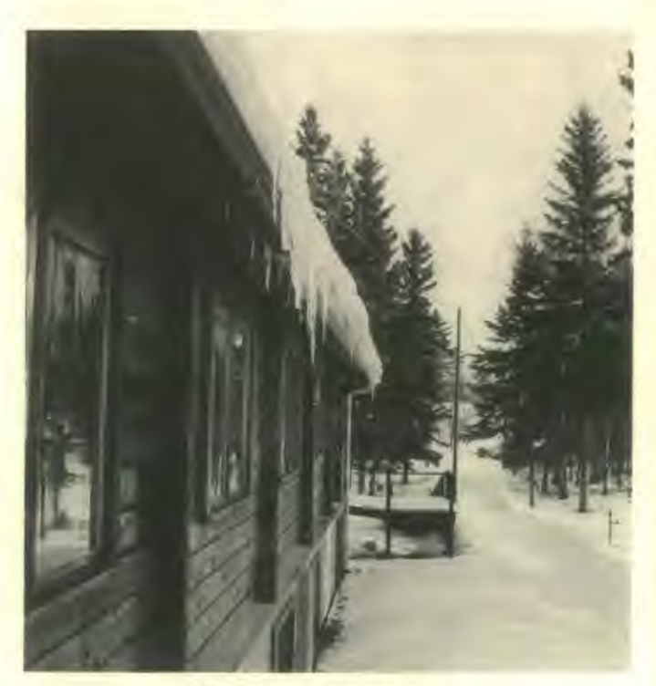
The Lodge-in perpetual use.