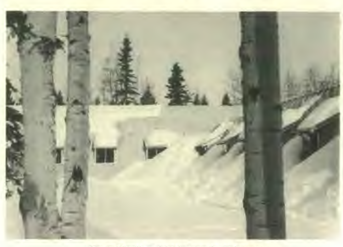
Camp Meeting Auditorium in February.