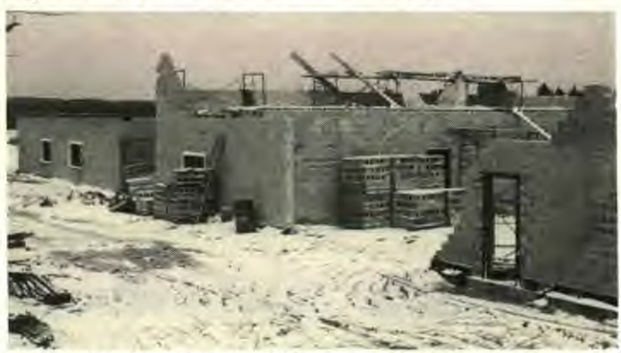
Halifax District school-auditorium complex being constructed

God's leading has been apparent all through the undertaking. This was especially true in the acquisition of the property by the Maritime Conference. This beautiful 75-acre site was owned by two elderly ladies who had repeatedly refused to even discuss