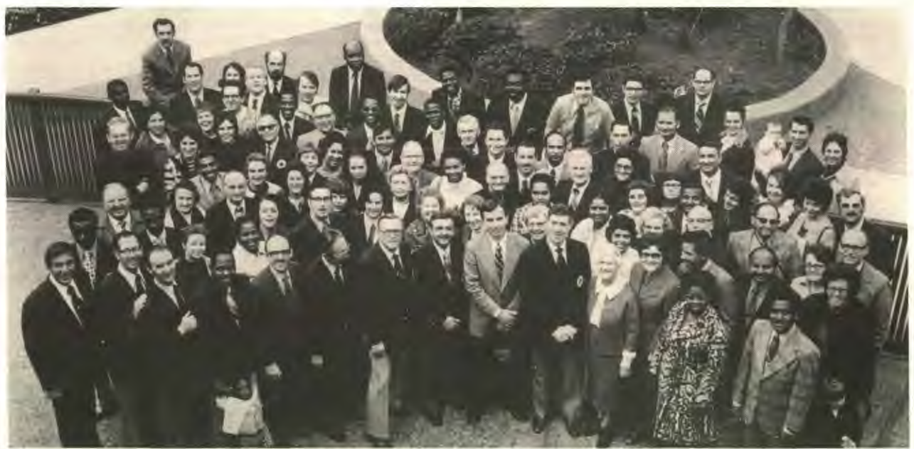
A happy group of Canadian Literature Evangelists visiting Pacific Press Publishing Association.