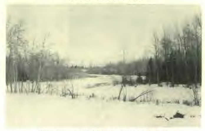
Camp property-in Alberta's winter wonderland