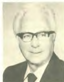
P. Moores Radio, TV Center