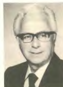
P. Moores Adventist R-TV Center