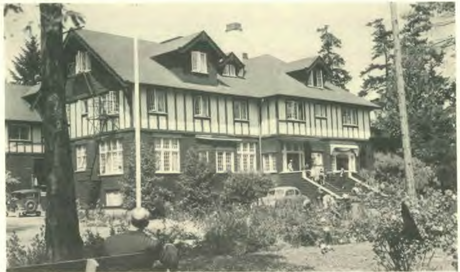
Beautiful Rest Haven Sanitarium as it was in the early years of its operation.

Our limited space will not permit inclusion of the many expressions of community reaction articulated with affection and a sense of great loss as Rest Haven now closes its doors. Former patients and members of our dedicated staff feel deeply and understandably repress with difficulty, their emotional response to the end of an era.