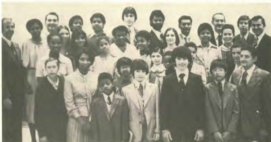
Part of the baptismal group on the last Sabbath of the Crusade.