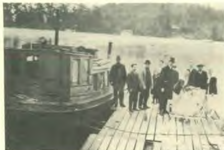
First patient arriving by boat in Dec. 1921.

Armed with these promises, the case was spread out before the Lord, confident that He would guide and show that plain path that He had promised. When all the facts were in and studied, only one decision could be reached: Rest Haven was sold!