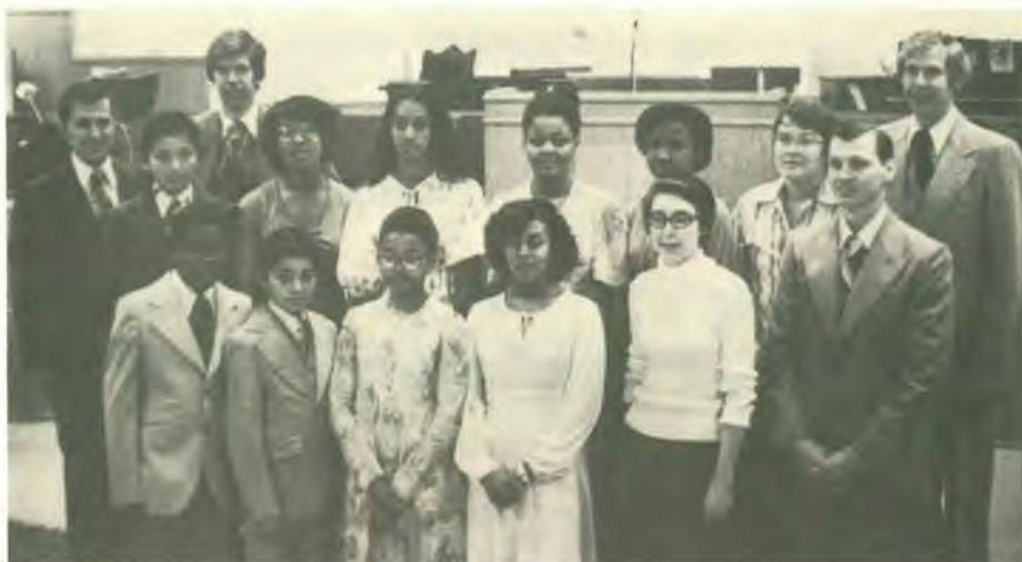
Some of the baptismal candidates who took their stand on the first Sabbath of the last week of the Crusade.