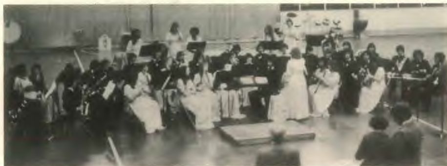
Concert Band playing at Kiwanis Festival.