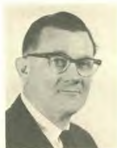
A. Mazat Pacific Press