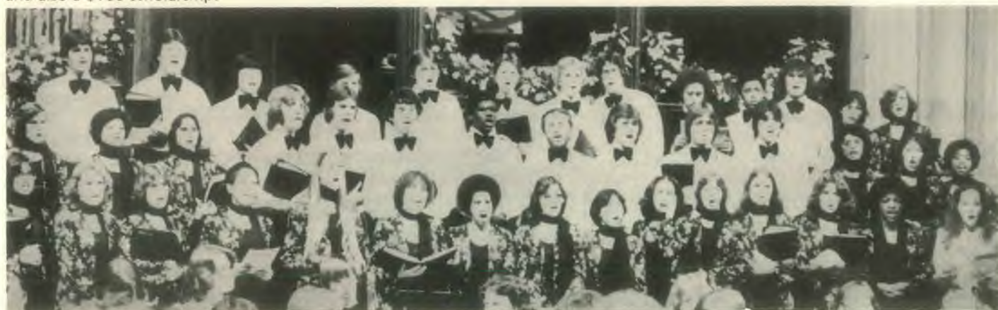
The highlight of the tour — singing at the National Cathedral, Washington.