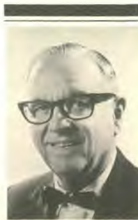
F.W. Detamore Evangelist, Voice of Prophecy Camp meeting 2