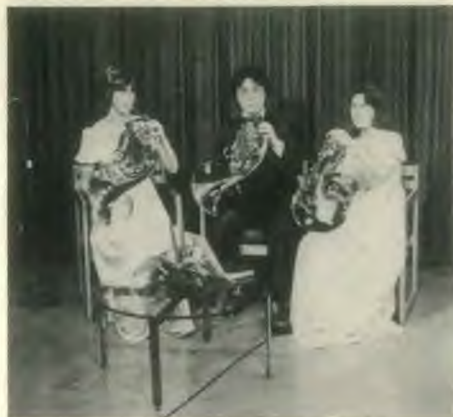
Brass Ensemble performs on Cable TV.