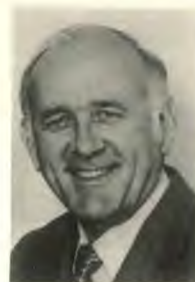
W. Ruba Publishing