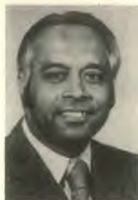
N. O. Matthews Senior College