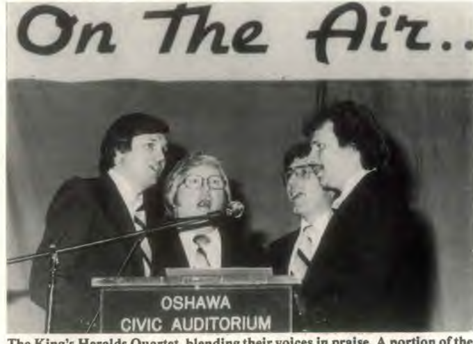
The King's Heralds Quartet, blending their voices in praise. A portion of the banner, "On the Air . . . Everyday, Everywhere" is above.