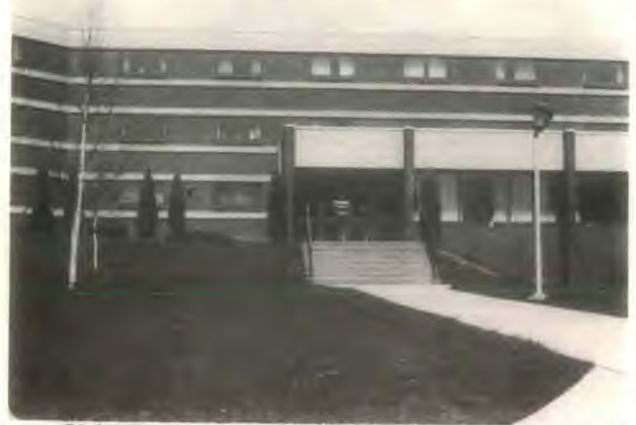
Girls' Dorm - The portal to a Christian environment.