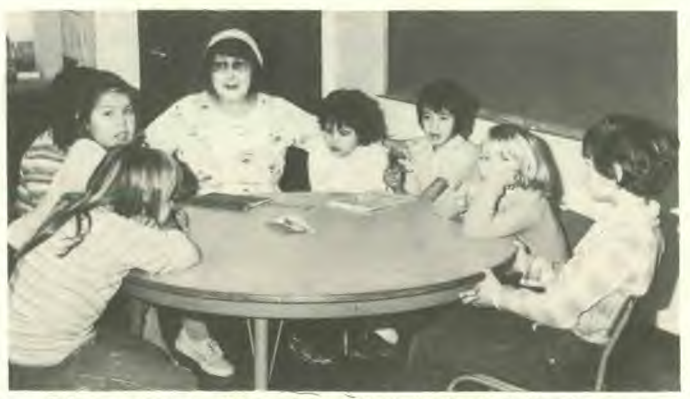
Primary students with teacher of the Bella Coola Indian language.