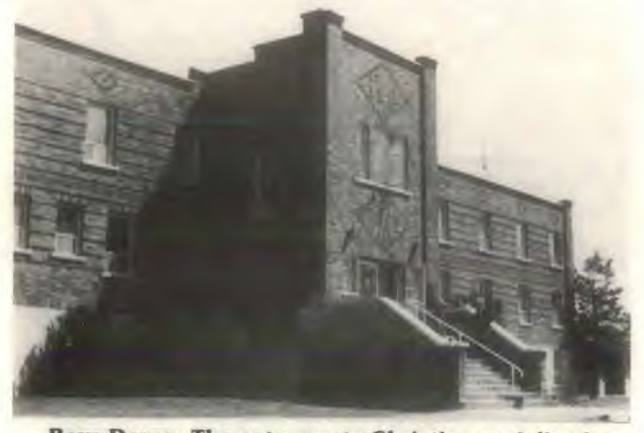
Boys Dorm - The entrance to Christian socialization.