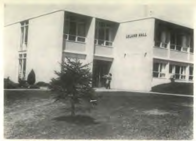
Leland Hall - the gateway to Christian academics.