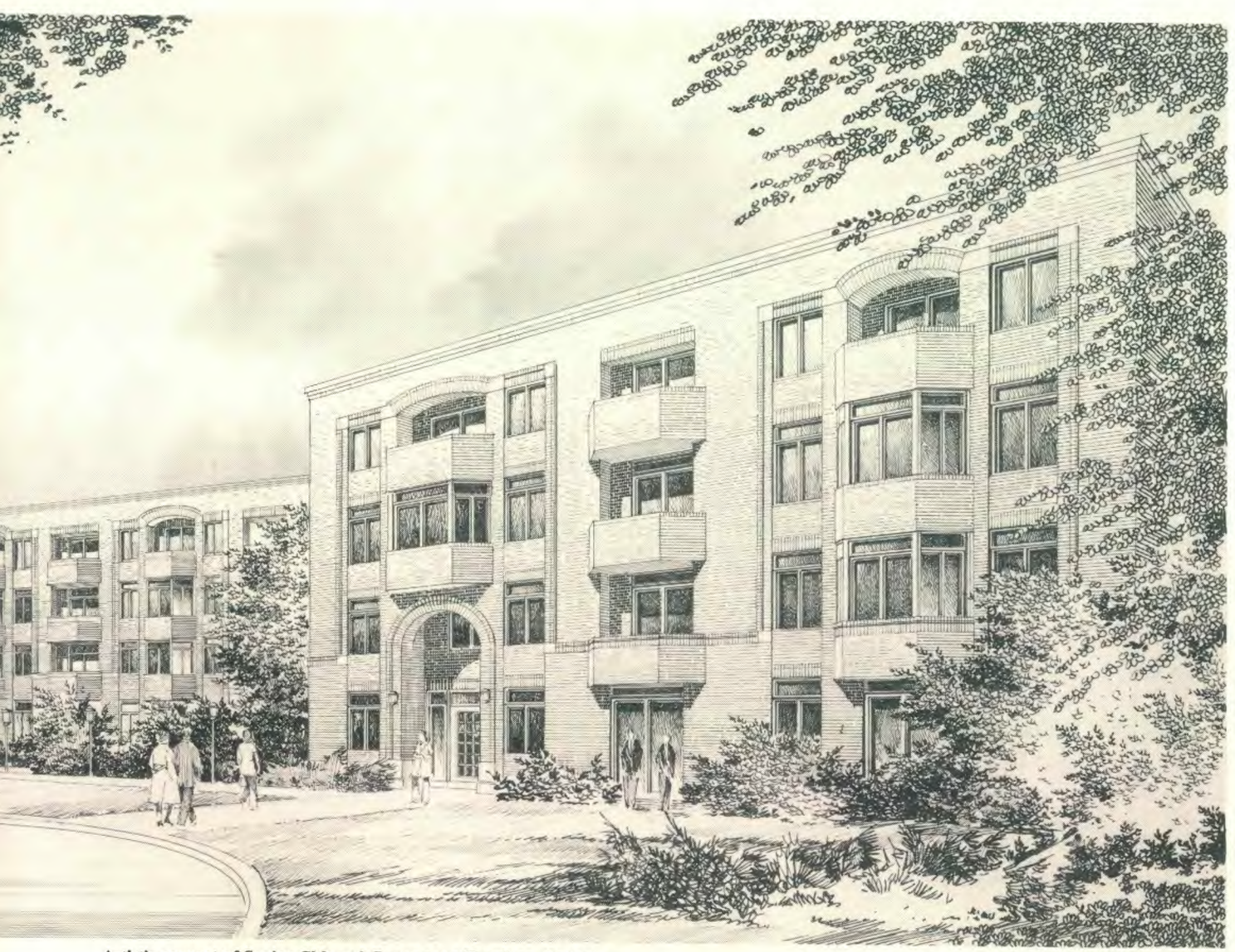
Artist's concept of Senior Citizens' Centre near Hamilton, Ontario.