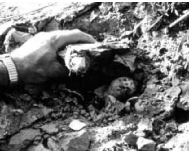
Gull eggs buried by Mount St. Helens' eruption.

what I could learn about dinosaur egg fossilization from my ashfall experience. So one year