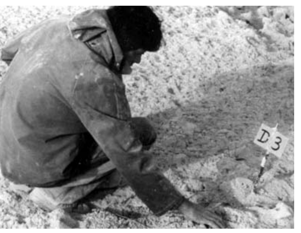
The author inspects the site of a ring-billed gull nest on an eastern Washington breeding colony on May 19, 1980, one day after the Mount St. Helens' eruption. The nest, which contains three eggs, is completely covered by volcanic ash.

Archaeologists tell us that, long before the time of Christ, people who lived in the region of presentday Mongolia wore jewelry made from dinosaur eggshells. It's unlikely, however, that these people knew anything about the source of their