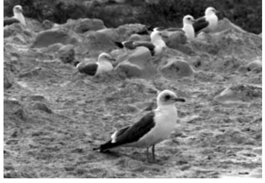
California gulls (avian dinosaurs!) on May 19, 1980, one day after Mount St. Helens' ashfall. The colony surface looks like a moonscape. Note the dirty feathers around the eye of the gull in the foreground. Many of these birds developed temporary conjunctivitis due to irritation from the ash.

ever, my purpose in this article is to consider how dinosaurs lived and be haved , especially in relation to reproduction. My reason for this is that in our rush to try to answer these other questions, we have overlooked some fascinating information about the day-to-day lives of some very interesting animals!