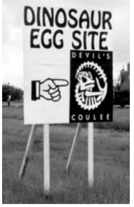
Sign in Warner, Alberta, which directs visitors to the Devil's Coulee egg site where many fossilized dinosaur eggs and babies have been found.

At some localities, dinosaur eggshell is the most abundant type of fossil. In Walking on Eggs , Louis Chiappe and Lowell Dingus describe their 1997 discovery of a huge dinosaur egg site in Patagonia: "Eggs were everywhere. . . . In many places the fragments of eggs were so abundant that we couldn't walk without stepping on pieces of fossil eggshell." Some of these eggs contained the