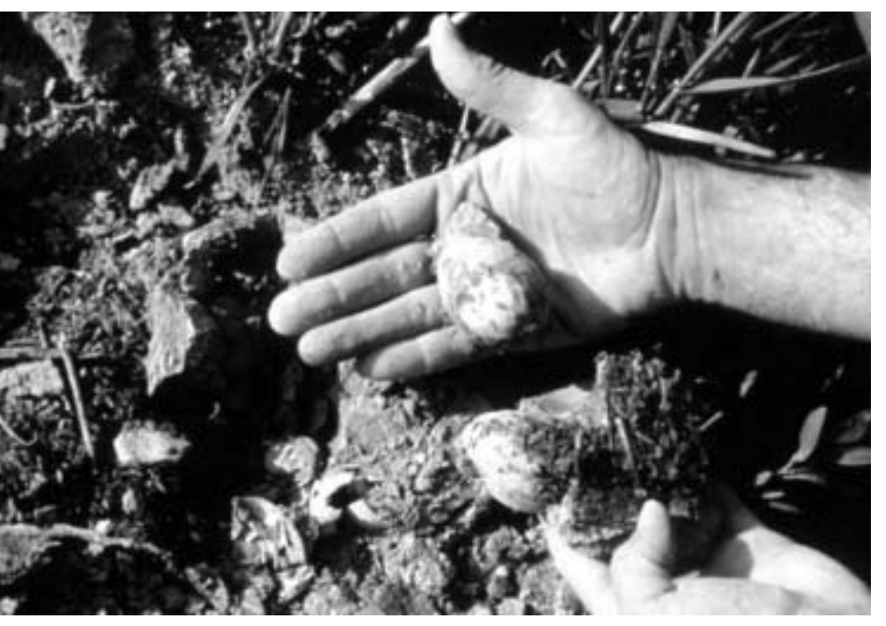
In 1981, one year after the Mount St. Helens' ashfall, an ash-buried ring-billed gull nest is uncovered, and then removed from the ash layer.

Feathers have been found only on small dinosaurs. This makes sense in view of the warm-blooded hypothesis. Large-bodied dinosaurs would be able to retain heat much easier than small dinosaurs. In fact, large dinosaurs may have faced the opposite problem—overheating. Small dinosaurs, including the babies of large