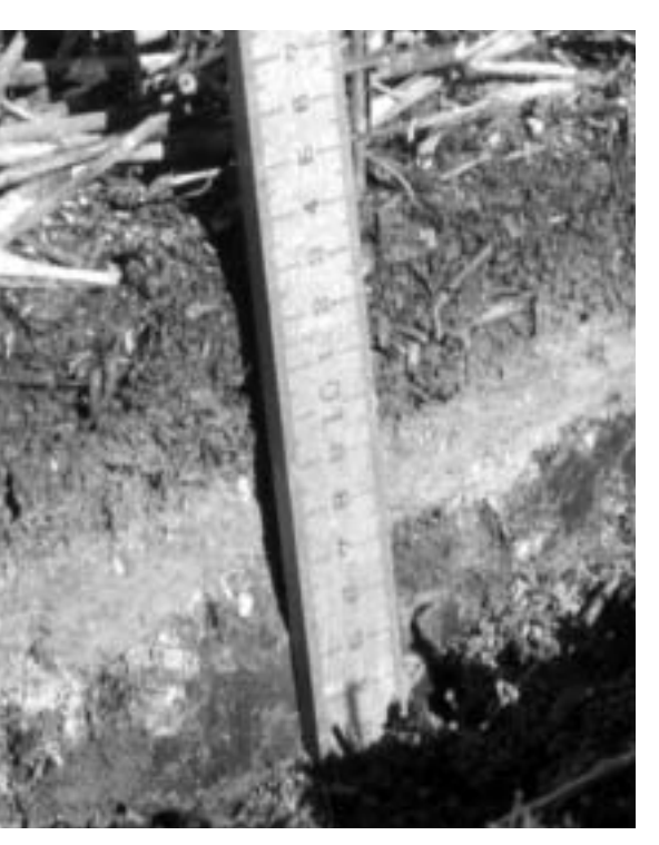
In 1987, seven years after the ashfall that buried an eastern Washington gull colony, the 1980 ash layer that contained buried nests and eggs appears as a light band 2-3 centimeters deep. Approximately 4 centimeters of material have been deposited on top of the ash layer since the ashfall. The gulls now nest on top of the new material.

The most dramatic evidence for parental care by dinosaurs was reported in late 2004. In the Liaoning province of China, paleontologists uncovered the skeleton of a small vegetarian dinosaur, Psittacosaurus , over a tight cluster of 34 juvenile members of the same species. The juveniles, all the same age, had wellformed bones, indicating post-hatch-