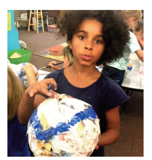
Student learning about the world for her Olympic games project.

students sharing stories they researched about extreme makeovers and how that translated to the work of the Holy Spirit in their lives.