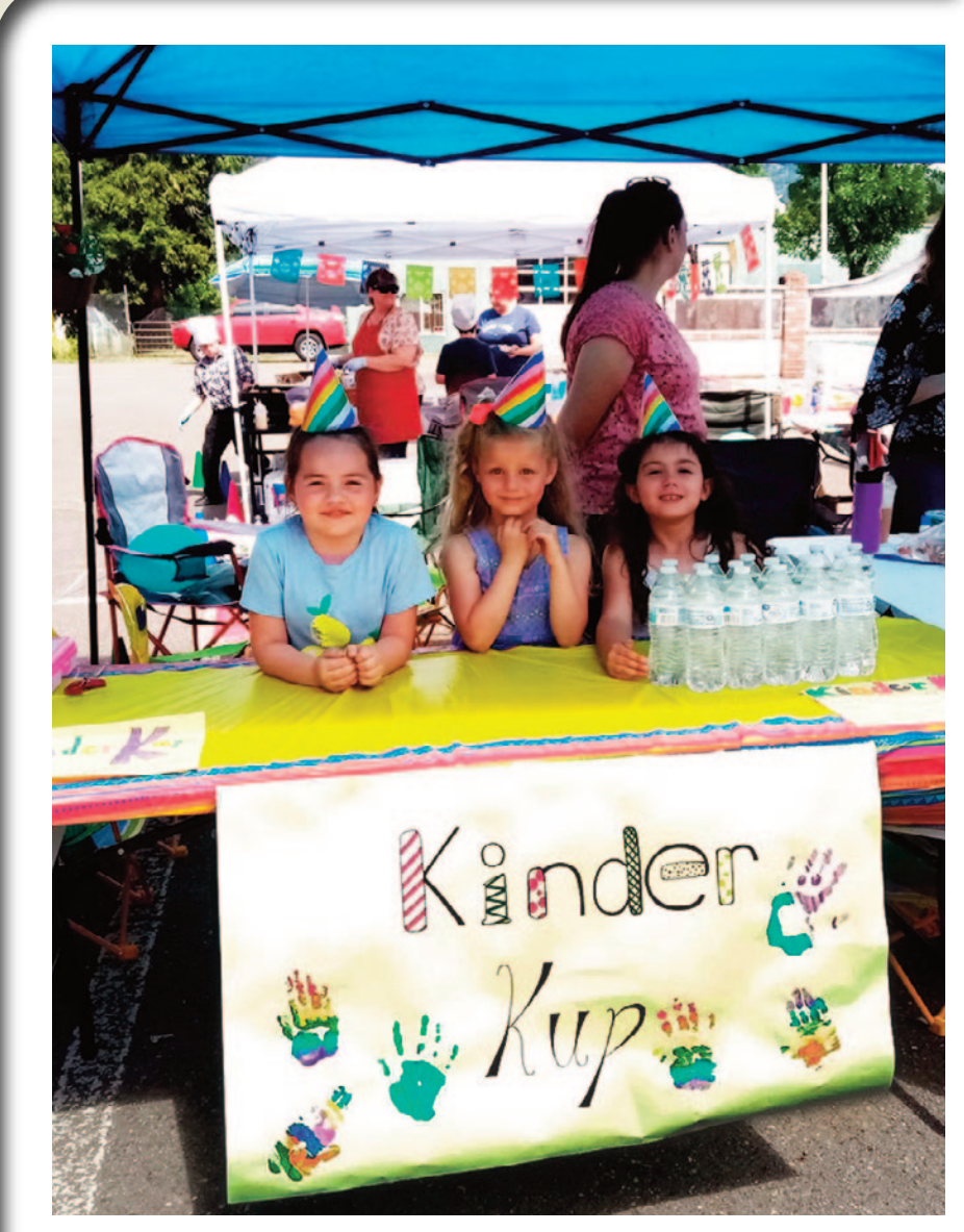
Kindergarten entrepreneurs sold water and other miscellaneous items.

In small schools, using PBL to enhance the curriculum and drive learning is effective. <sup>15</sup> Indeed, many successful small-school teachers have been teaching this way for years. Encouraging student leadership, differentiating the requirements (in rubrics) to meet the needs of the wide span of learners, and allowing for individual originality and ingenuity are just some of the benefits of PBL. Rather than PBL being something that small schools can contrive a way to implement, this methodology seems to naturally fit small schools' needs.