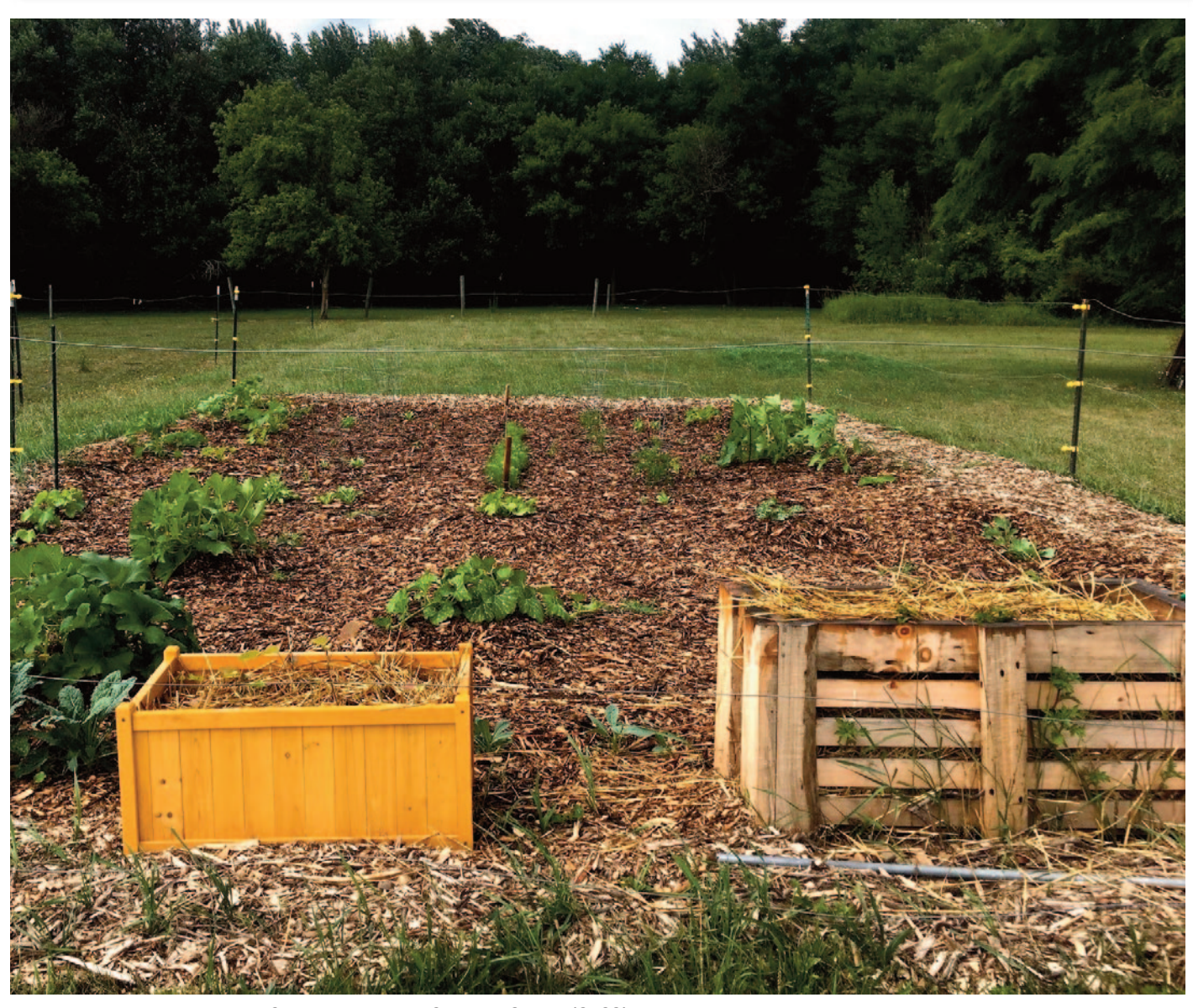
Charlotte Adventist Christian School (CACS) garden project in the early summer.

"This project inspires students to adopt part of the garden over the summer to ensure it receives good care, and it encourages them to return the following year to learn and benefit from the harvest and seedcollection process. It is rewarding to watch students comprehensively understand the life cycle of a garden. They can try foods fresh from the earth and learn about individual plants and how to harvest their seeds. They not only learn the importance of a garden, how to keep it healthy, and the benefits of delicious food, but also how to use items from the garden to