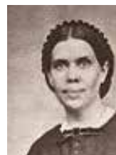
Ellen G. White, 1827–1915, received the spiritual gift of prophecy, and the fruits of her life and work accord with the biblical tests of a true messenger of God. To this day, her counsels are an incalculable blessing to God's people around the world.