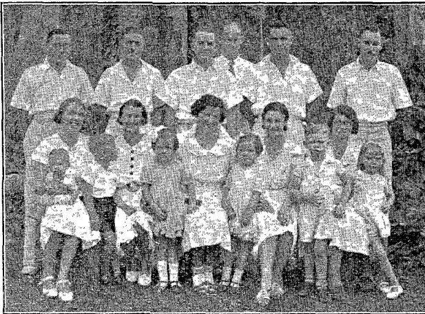
Missionaries in New Guinea at the Council

The committee decided unanimously to pass a vote of thanks to be forwarded to