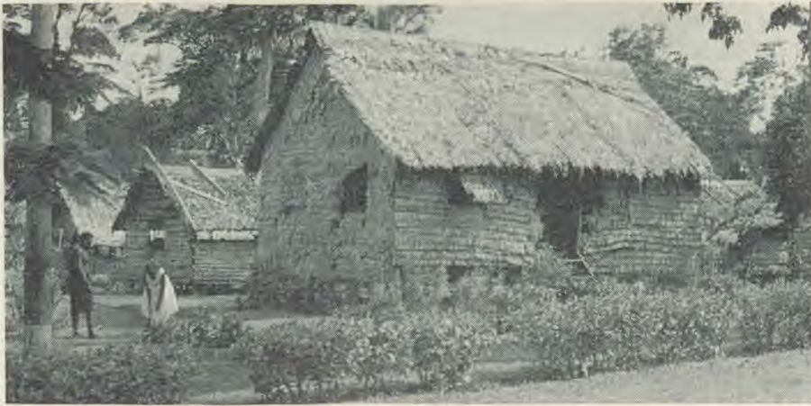
One of the many old houses which are being "sewn" out of existence.

starting after 7 a.m., teaching sewing to the school girls and toiling at the sewing project. Articles and garments sold so far have been the means of building three national workers' houses and money is in hand for a fourth, which is under construction. These were the homes we passed back along the pathway.