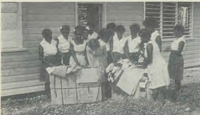
It is a great day when a carton of materials arrives from the Goldsmiths.