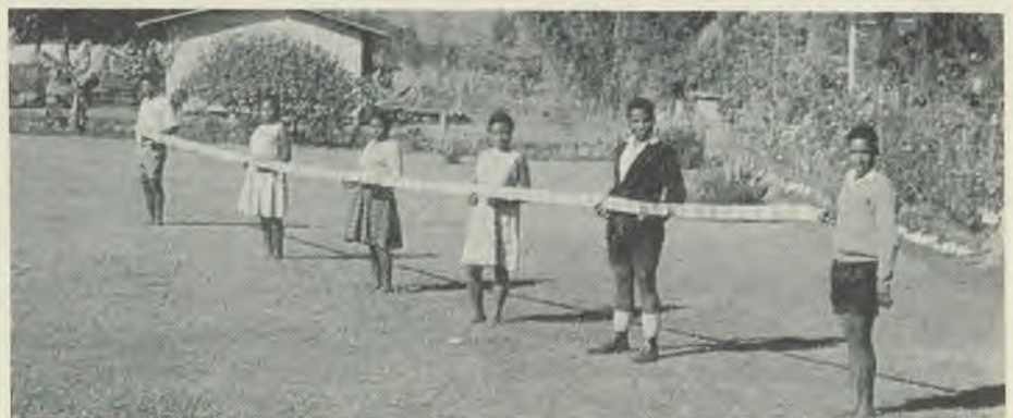
The seventy-eight-dollar Kerowagi camp meeting offering joined with Sellotape to make a banner to be carried into the church at the time for collection of the offering.

Mission of New Guinea in 1969, 163 church groups contributed $1,510 to the camp offering, besides Sabbath school