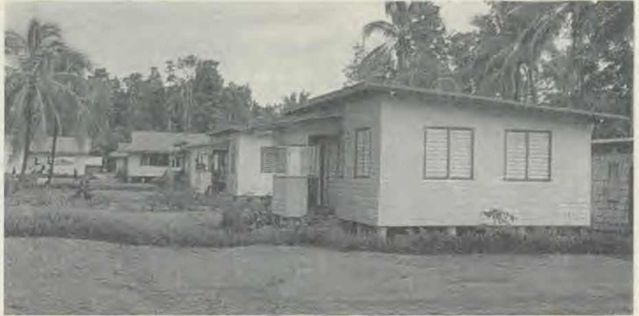
The new homes built as a result of the sewing project at Kukudu.