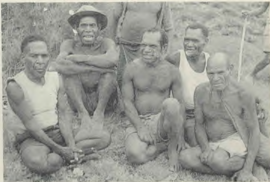
These men at Wando, New Guinea, are all ex-cannibals. Now they are good church members.

The Thoughtful One had been suffering pain so had decided to go and visit the Adventist missionary whom it was reported could cure sickness with special medicines. He crossed the mountains to Bena, arriving late in the evening, and was asked to wait until morning. Given food, he went to sleep beside the fire on the dirt floor of an empty house. During the night he seemed to walk through a long dormitory filled with soft beds with thick mattresses. He noticed that each bed had a name on it and at length he