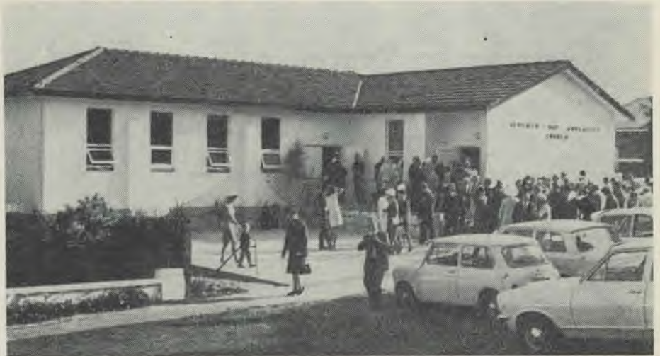
The new Cottesloe church, Western Australia.