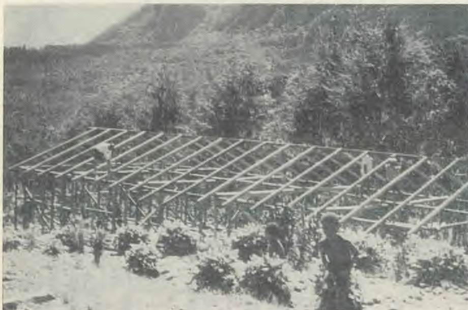
In four days the framework of the church reared itself above the floor of the valley to the astonishment of the local people.

To build a church at an altitude of 7,500 feet where all hardware and even some of the timber had to be flown in, was no usual task. But the construction team accepted the challenge and caused a flurry of activity never before seen in this extremely isolated valley guarded by 12,000-foot-high mountains. On the Tuesday the heap of roughly cut pilsawn timber was vigorously attacked by saw, chisel and hammer, and by the first Sabbath the sixty-foot by twenty-six-foot frame was standing and meetings were even held beneath the portion of the roof