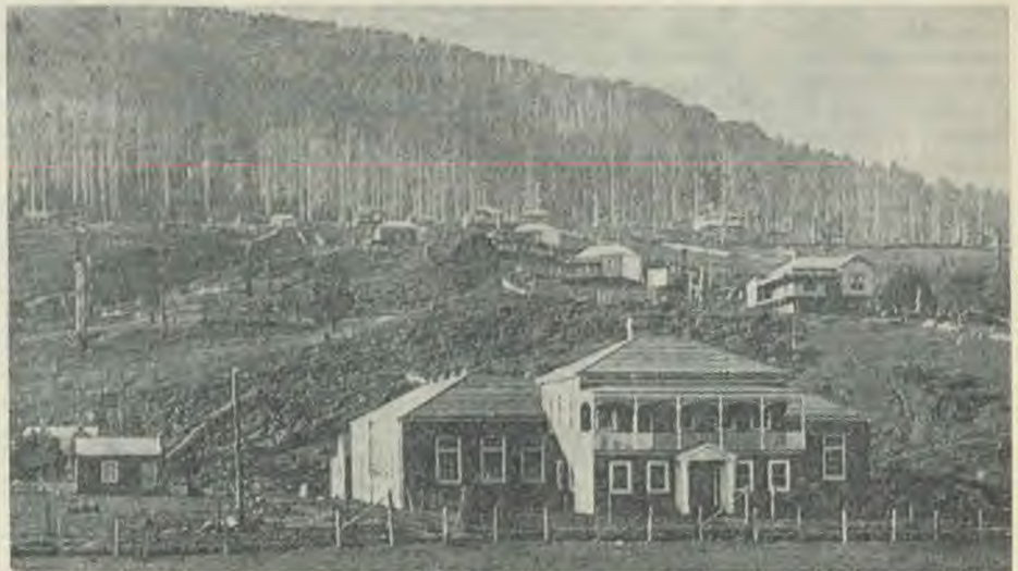
THE SIGNS PUBLISHING COMPANY, WARBURTON, IN 1906

The publishing house is in the foreground and the homes of the workers on "Signs Hill" are in the background. May we say that Warburton in 1969 looks far more beautiful and attractive than it did in 1906. The publishing house pictured above is no longer standing, though, unfortunately, some of the houses are still with us.