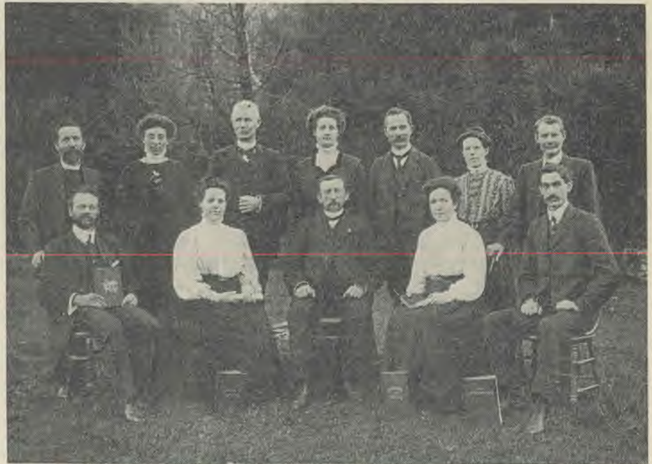
PUBLISHING DEPARTMENT WORKERS AT THE UNION CONFERENCE SESSION HELD IN WARBURTON, VICTORIA, IN 1910.