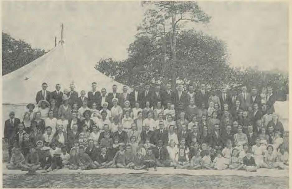
IS THIS THE FIRST NORTH QUEENSLAND CAMP?