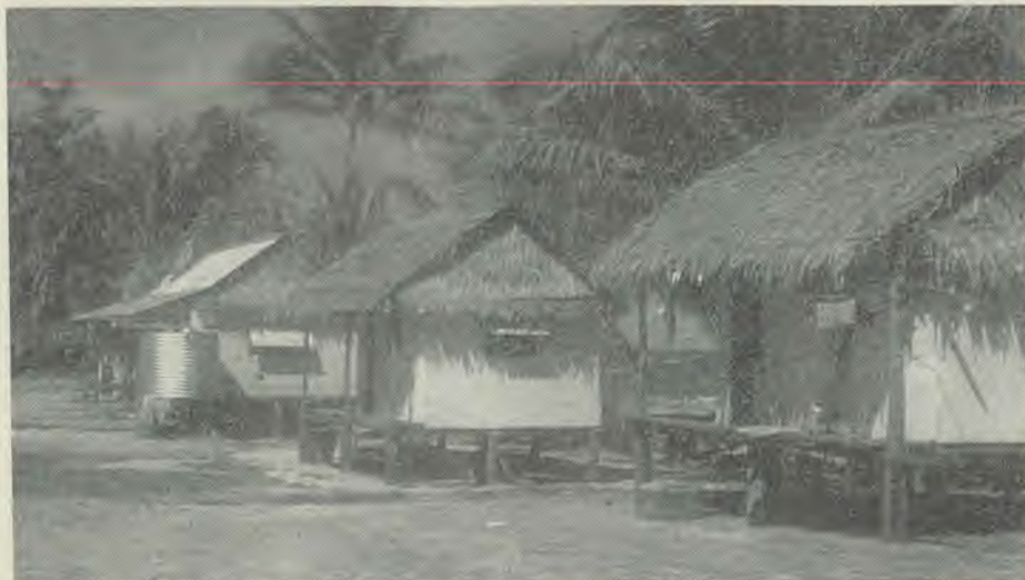
The clean, orderly Adventist village on the island of Aua, north of Wewak, is a strong, silent testimony to the power of the gospel.