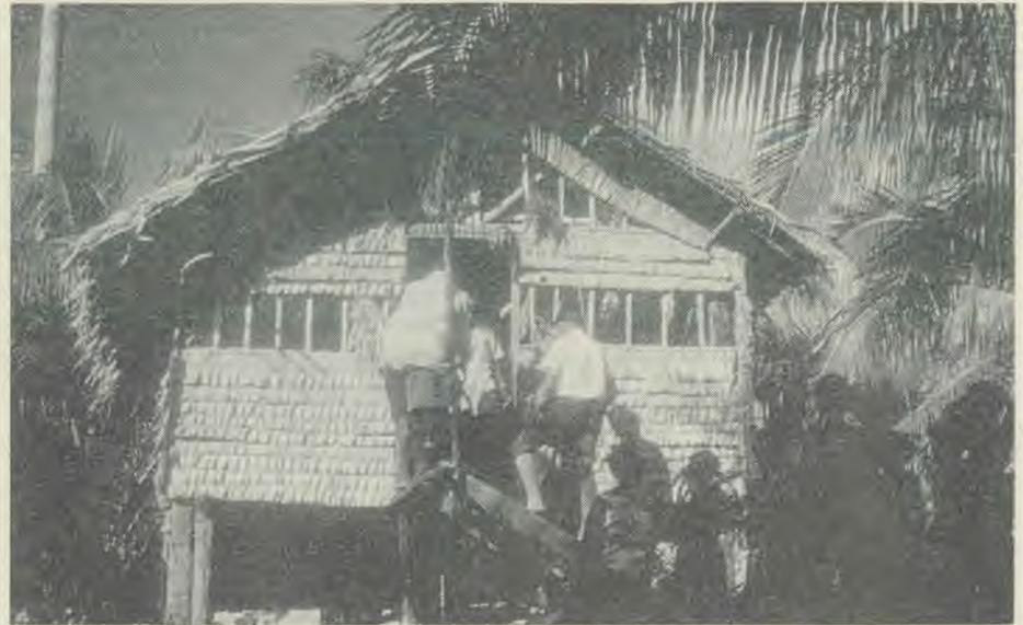
The new church at Fote, East Malaita.

July 10, 1969, was a lovely sunny day, though there was a stiff breeze blowing when a group of us set off from Atoifi in the big canoe with outboard motor. In