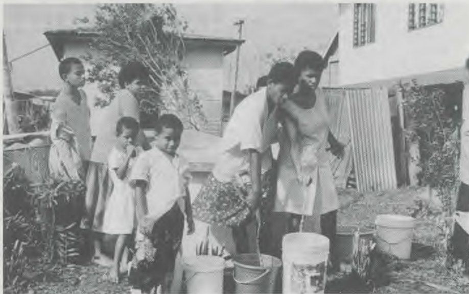
Fresh water is in short supply and has to be rationed, by the bottle.

C yclone Kina hit the Fiji Islands between January 2 and 4, 1993. Some 25 lives were lost, and assessments made by the Fiji government put the damage bill at over $A130 million.