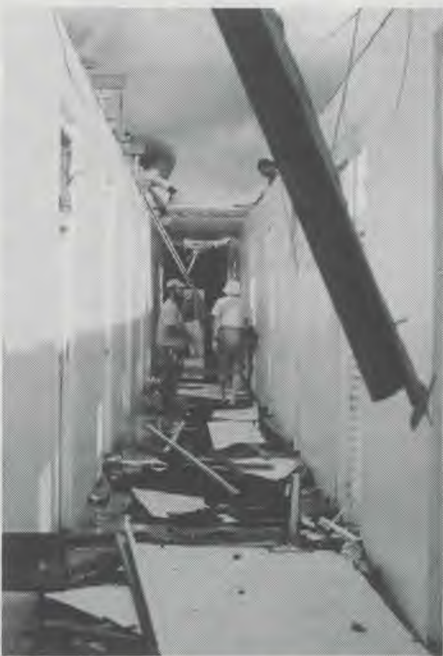
Fulton College boys dormitory, pictured from the third floor, after losing its roof due to Cyclone Kina.

The roof of the girls dormitory was also lifted and taken 100 metres down