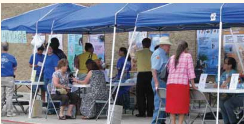
People take advantage of the health fair given by Bass students and local Adventist medical personnel.

For Mother’s Day, May 9, 2010, 14 students, along with local Adventist