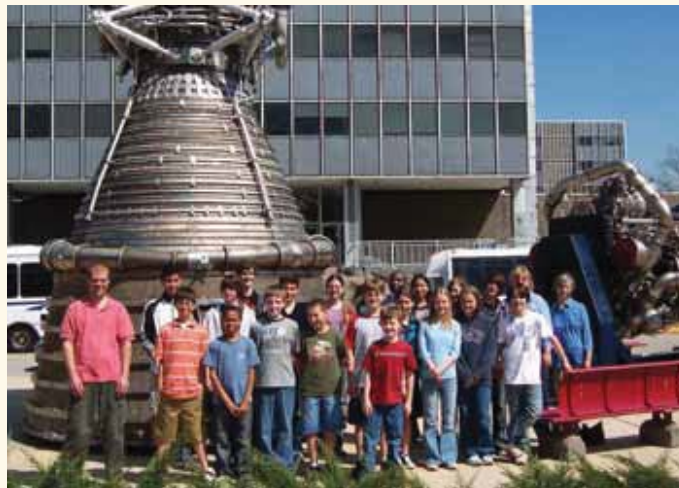
These Big Cove students enjoyed attending the Space Shuttle STS-130 mission review where they met four of the crew members.

Big Cove Christian Academy (BCCA) grades four through nine attended the Space Shuttle STS-130 mission review at the NASA Marshall Space Flight Center in Huntsville, Ala., on March 31, 2010. Other attendees included public school students, Space Camp students, and Marshall Space Flight Center employees. The STS-130 mission carried the Cupola, the last major piece to the International Space Station, now orbiting the Earth. The Cupola is the windowed segment that allows the astronauts to view the space station exterior, the Earth, and outer space with