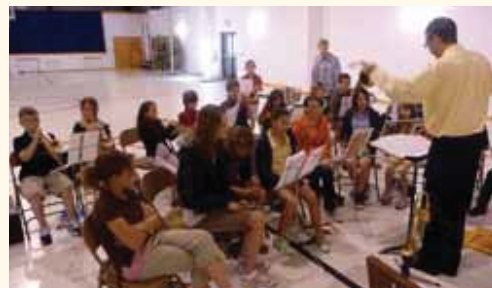
Silver Creek orchestra