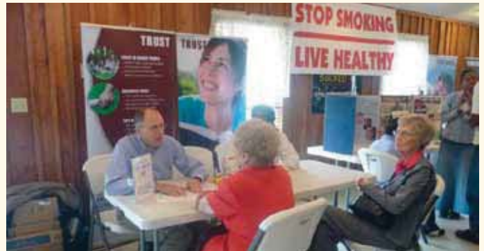
Twenty-five people from the community came to the health expo, where they were provided with health screening and information to help them live healthier lives.

On Sunday, the training moved to the Ardmore, Tenn., Community Center where the attendees received hands-on training as they learned about the equipment, and how to set up a health expo. This workshop also taught participants how to use the health expo as a natural bridge to spiritual meetings, and the simple steps of how to organize an expo in their community. Participants were given opportunity to practice using the various screening equipment that makes an expo