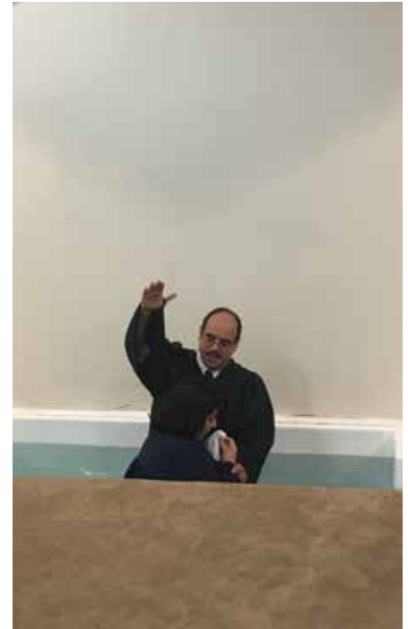
Bautismo en Fayetteville