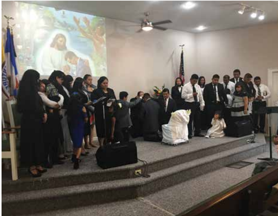
Ceremonia de despedida de los hermanos que se reunirán en la nueva filial de Lumberton