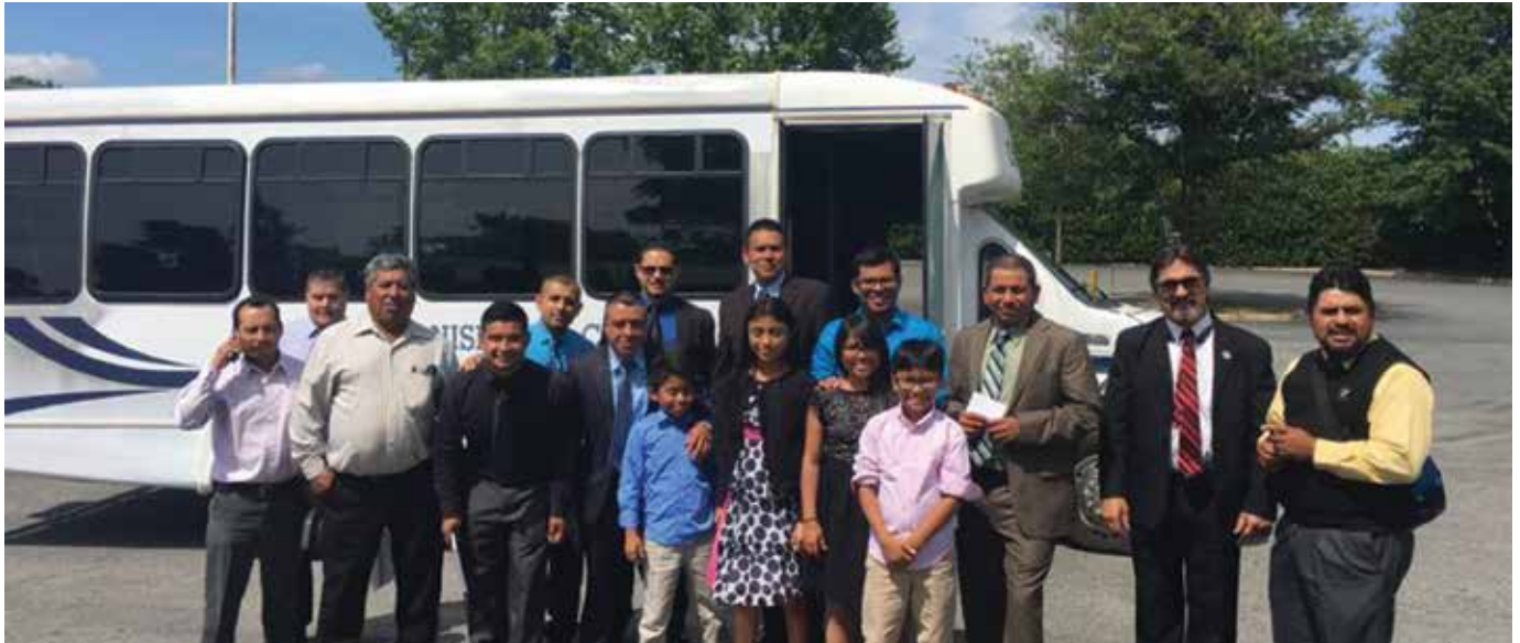
Parte de los asistentes al evento de Charlotte