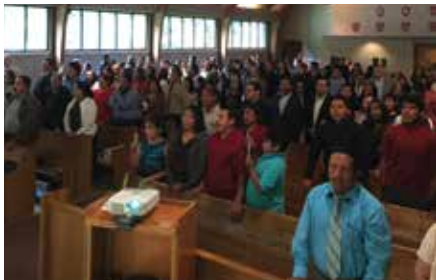
Vista parcial de la asistencia en Charlotte