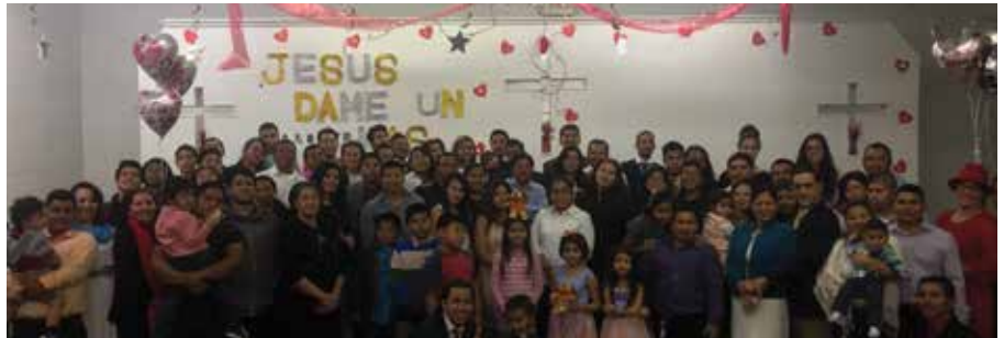
Asistentes al retiro

Alabado sea el nombre de Dios, ya que en