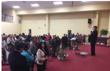
Vista parcial de los asistentes en Mt. Olive