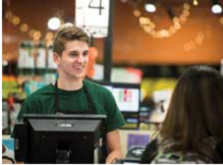
Southern students work in a wide range of jobs, and through the WISE program, they can receive dollar-for-dollar matching funds toward their tuition.

Several prominent supporters of Southern Adventist University recently met with school administrators and expressed their desire to assist hardworking students. While many of these donors are alumni who worked their