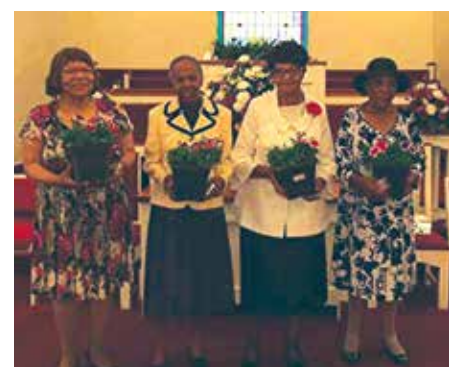
Mothers who were honored at Mt. Olive Church in Hemingway, S.C.

One of the reasons God created mothers was to give an earthy example of His heavenly love for all. Each stage of motherhood reveals an aspect of His love; therefore, the service ended with a prayer of thankfulness and praise for mothers young and old. ●