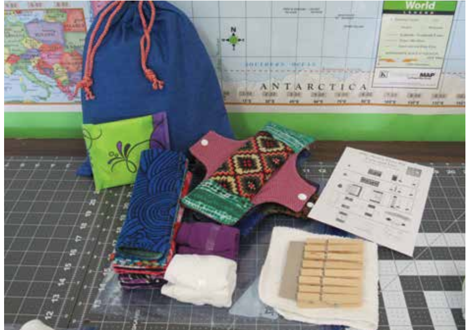
SUBMITTED BY: PENNY WHITE

Goodwin's intense desire was for KISM to create kits in carry bags packed with protective shields, menstrual pads, underwear, clothespins, zip lock baggies, and instruction sheets. With proper care, the Project Shield kits last two-plus years at no cost to the young girls.