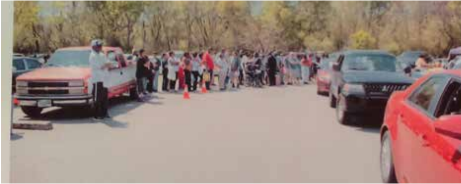
The community lined up to receive goods and services.

During Hurricane Matthew in September 2016, the Adventist Community Service Center accumulated three feet of water, losing everything inside, including shelving and fixtures. They had not been able to distribute goods for six months.