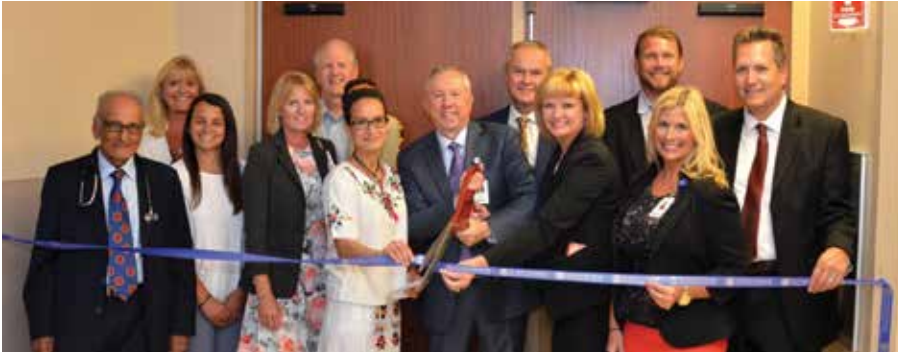
Nearly 450 community members joined Florida Hospital Memorial Medical Center on May 11, 2017, to celebrate the opening of a new unit to care for pediatric patients. Located on the hospital's fourth floor, the Center for Women and Children is a $10 million, 34-bed expansion that increases the number of beds at Florida Hospital Memorial Medical Center from 293 to 327.

whether you are preparing to expand your family, having a baby, or have a sick child.”