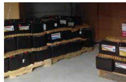
Advance Auto provided the Adventist Community Service Center with nearly 13,000 items, including approximately 200 batteries worth $15,000.

The Adventist Community Service Center team, with the help of volunteers from the community, logged more than 100 volunteer hours sorting, de-barcoding, and organizing the donated items for distribution.