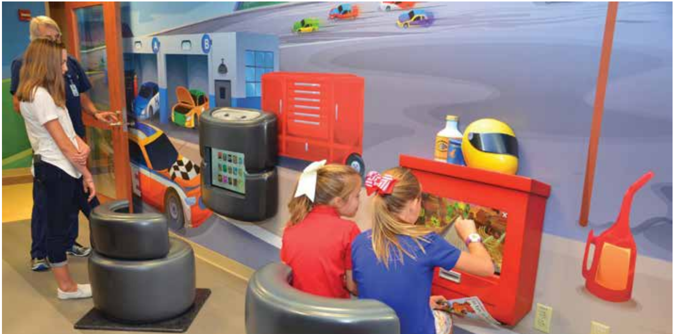
Florida Hospital Memorial Medical Center's new pediatric unit features a playroom to help children heal. Designed to put children at ease when receiving medical care, the playroom features a racing theme, complete with chairs that look like stacked tires and a tool chest, and interactive games.

Nearly 450 community members joined Florida Hospital Memorial Medical Center on May 11, 2017, to celebrate the opening of a new unit to care for pediatric patients.