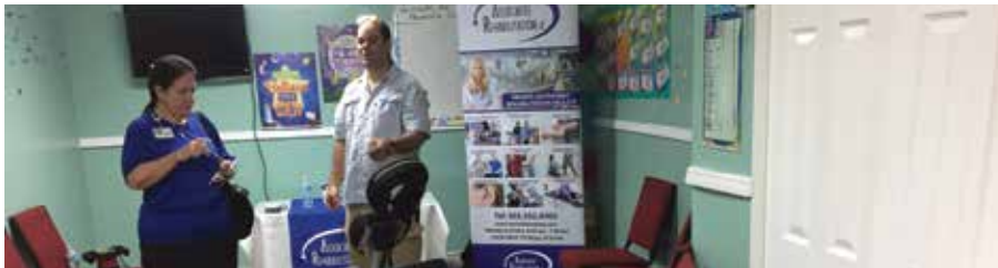
Preparándose para recibir un masaje

El domingo 4 de abril la iglesia Los Peregrinos, en Hialeah, Florida, llevó a cabo una feria de salud en la que numerosas personas de la comunidad recibieron atención médica gratuita. 📍