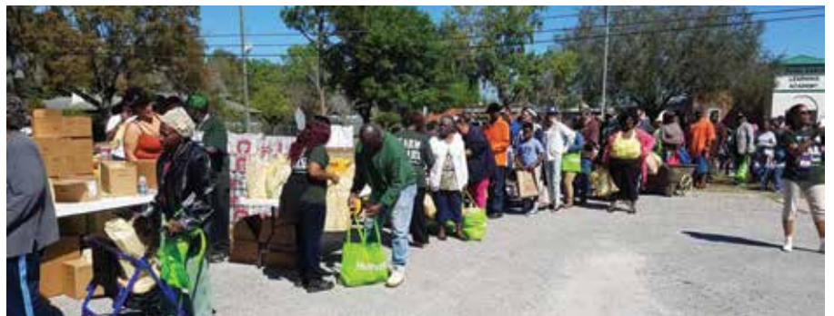
Food and clothing giveaway, and health screening at Bethel Church in Gainesville, Fla.