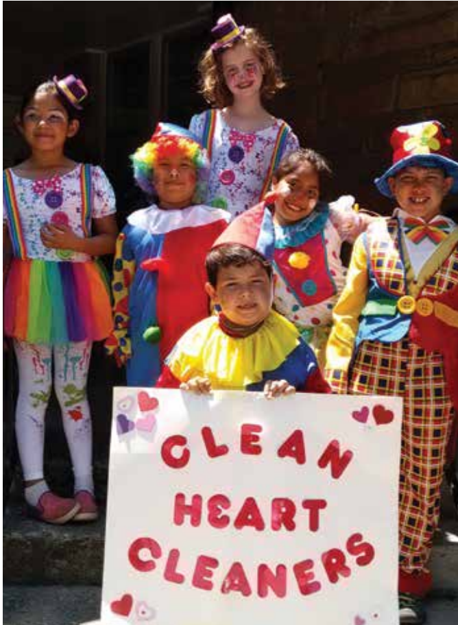
Students dressed as clowns.