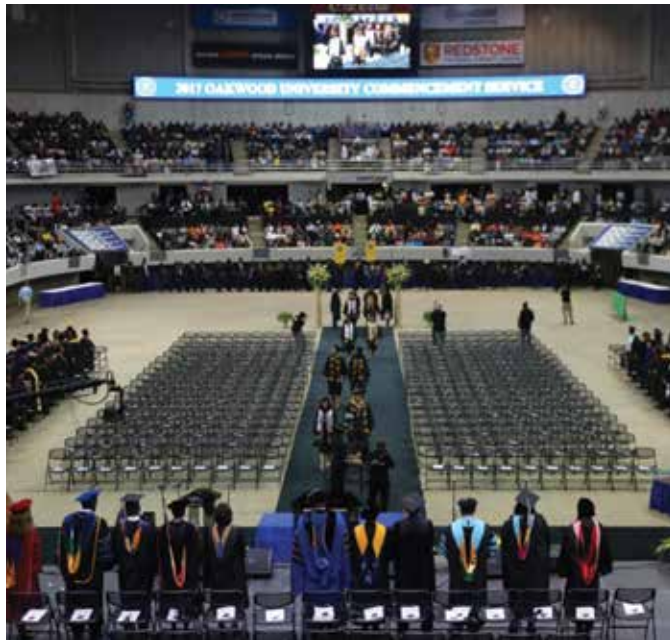
Oakwood University administrators and faculty prepare to greet the Class of 2017 at Commencement.