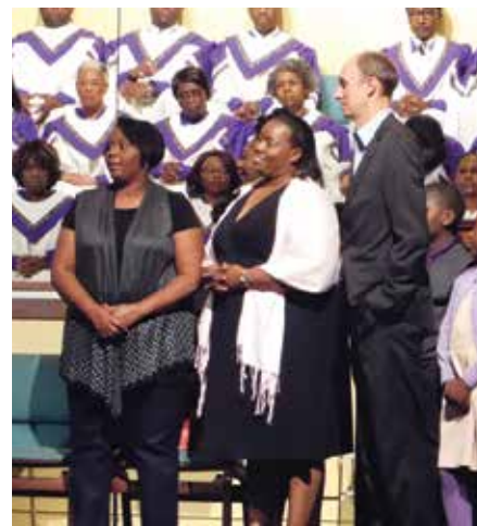
The Conyers, Ga., Church took time to recognize those who serve their community in April.