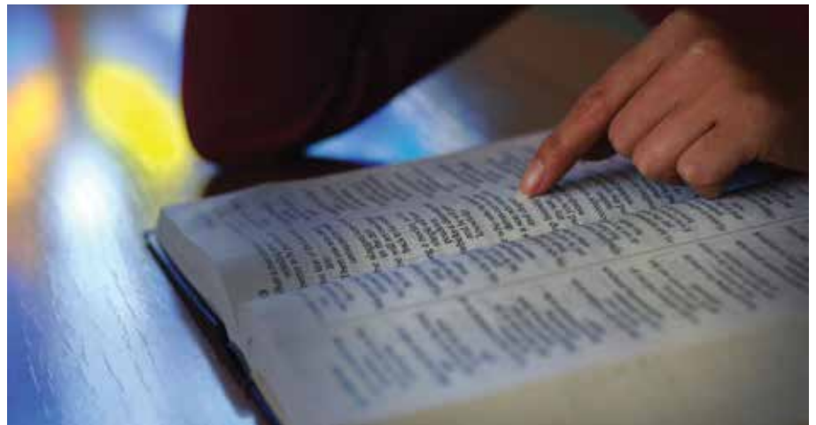
Inmates find peace and hope from the Bibles donated to them by Park Ridge Health.