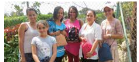
SUBMITTED BY: PENNY WHITE

God moves in marvelous ways. Cuba received 217 kits this past March, and Columbia received 100 kits in May. Upcoming shipments are scheduled for Ecuador in June, Nigeria in August, Malawi in October, and Haiti in the last quarter of 2017.