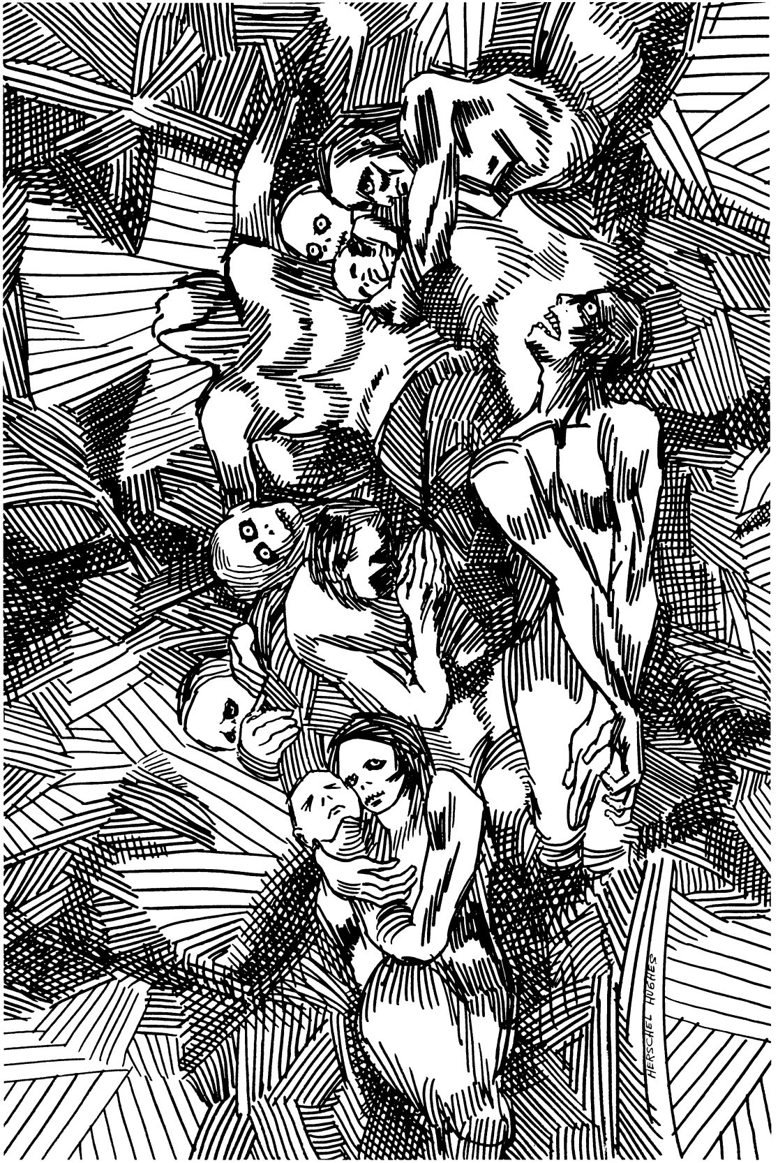
WAR GLORIES . . . HERSCHEL HUGHES