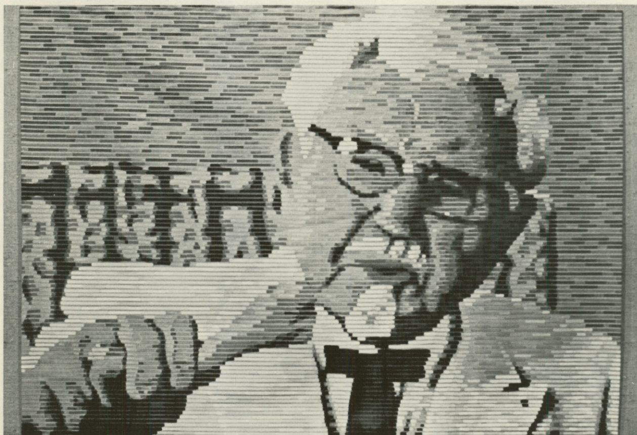
"Colonel Sanders," acrylic on canvas, 51" x 65".