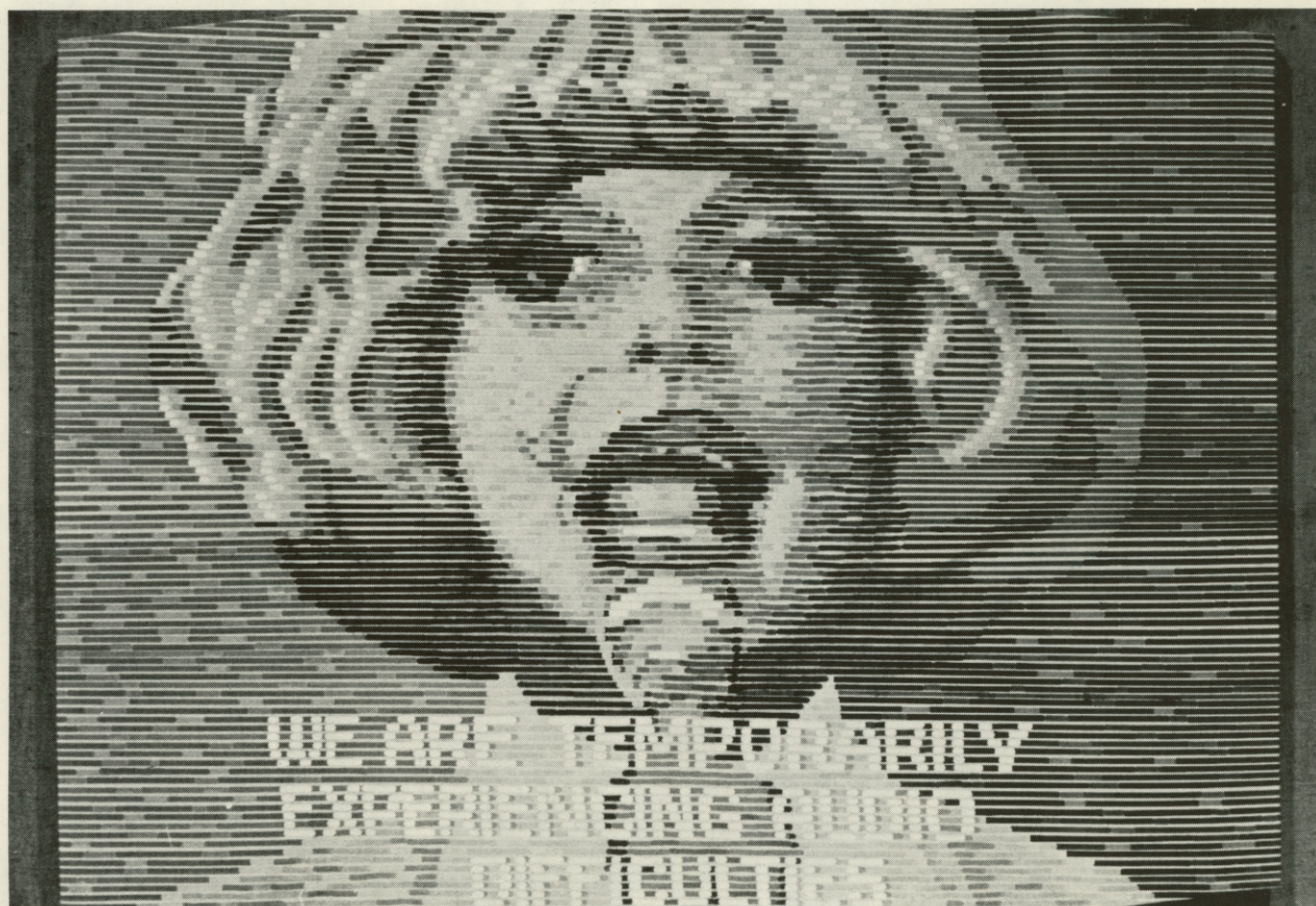
"Carol Channing," acrylic on canvas, 51" x 65".