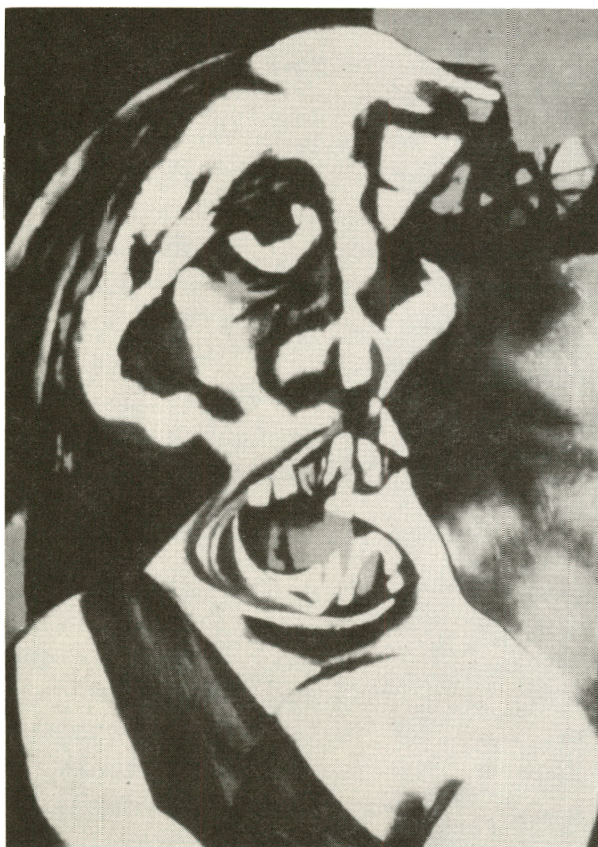
The Victim, 1954