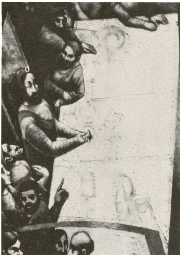
Last Supper: After DaVinci, 1967