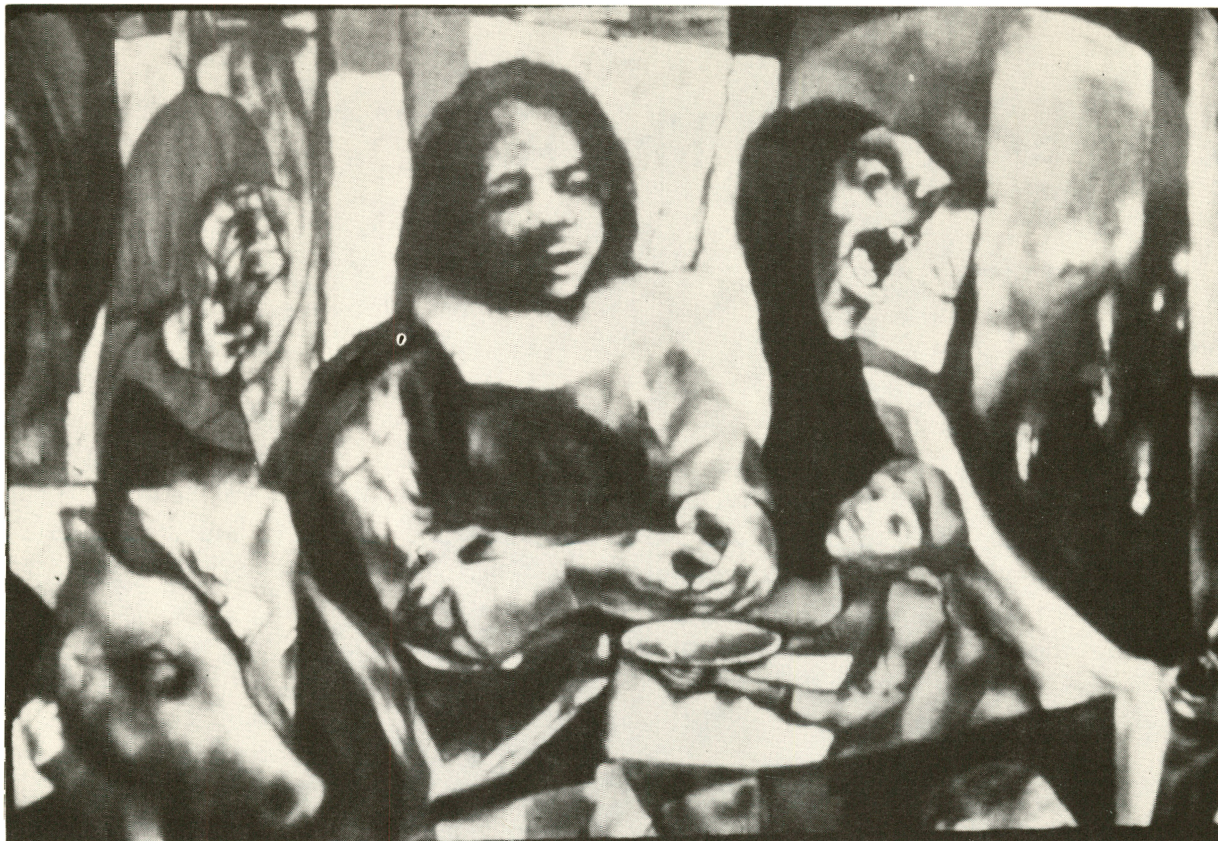
He is Blinding the People, 1950