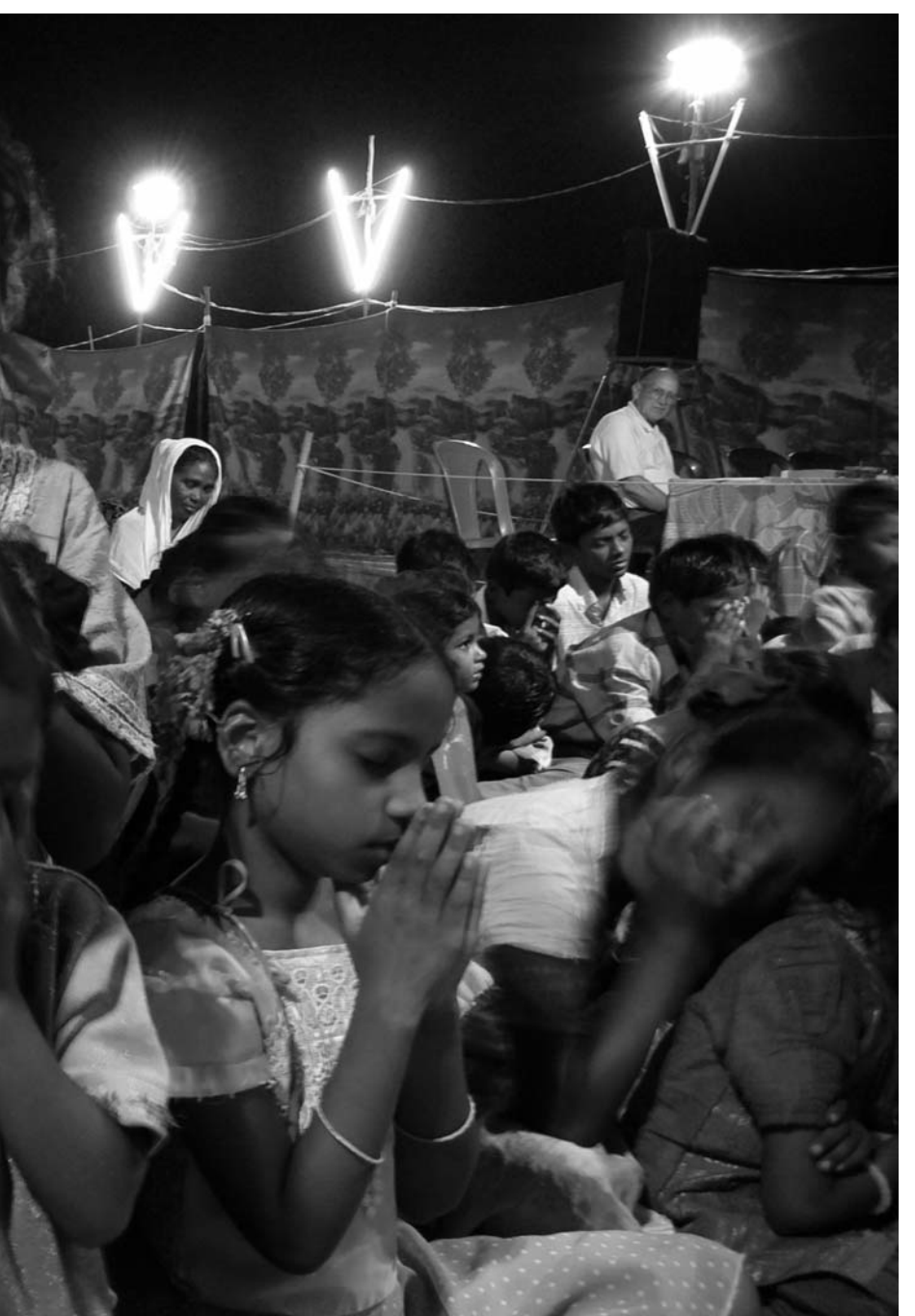
A MOVEMENT IN PRAYER Children Praying in Chirala, India