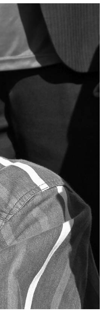
YES FOR CHRISTIANITY IN CUBA An Adventist believer from Cespedes, Cuba.