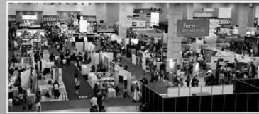
The majority of booths at the 2015 General Conference session were focused on adult ministries.

I recently traveled on a plane filled with over a hundred enthusiastic 16-year-olds who were part of a church youth group coming home from a mission trip, each proudly wearing matching blue shirts with the name of their church on them. I had a middle