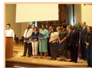
Graduate Certificate Recipients Dedication 2009