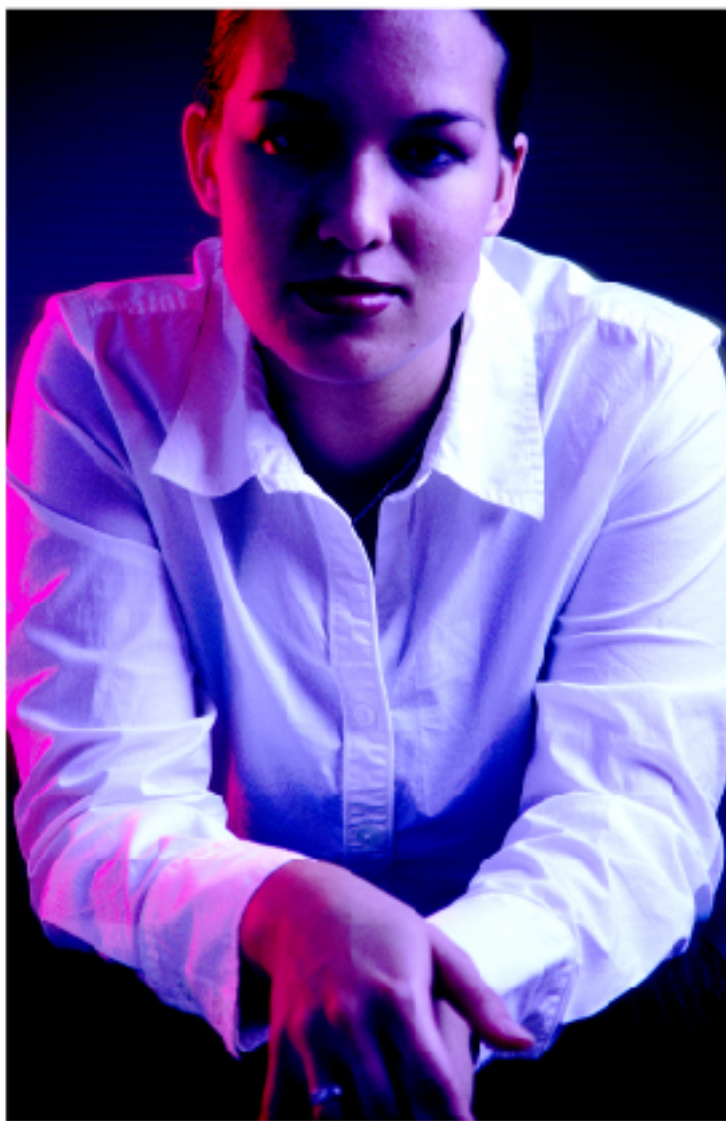
gels, head shot: Technical study of various lighting setups and colorings. [nikon N70, tamron 28-200, fuji velvia] [mamiya rz, 250mm, kodak tmax]