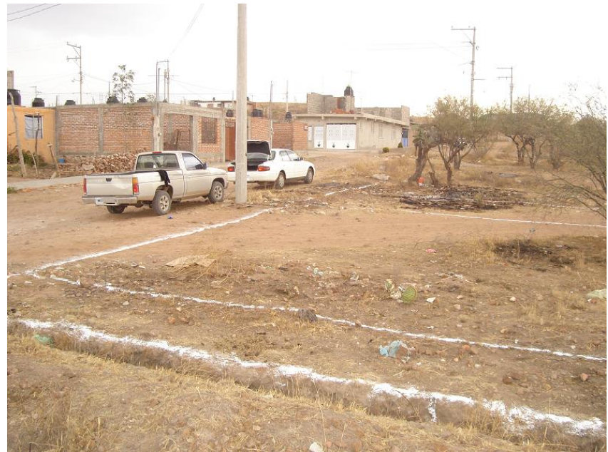
The church property being outlined for leveling